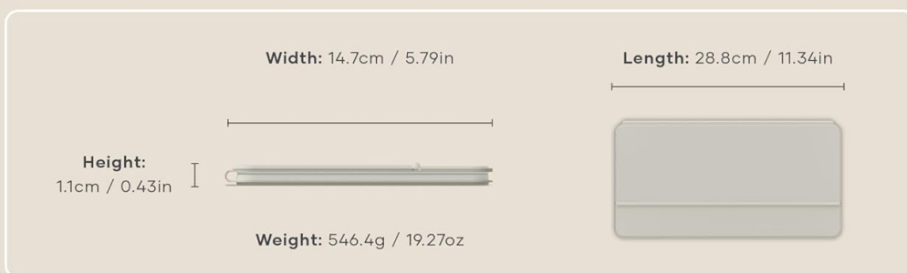
Image: The keyboard in its compact, folded state, with dimensions and weight indicated.