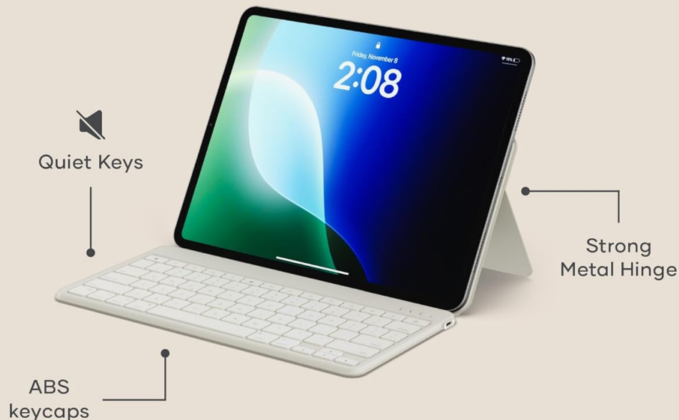
Image: The Satechi OntheGo Keyboard highlighting Bluetooth 5.1 and 3-device connectivity.