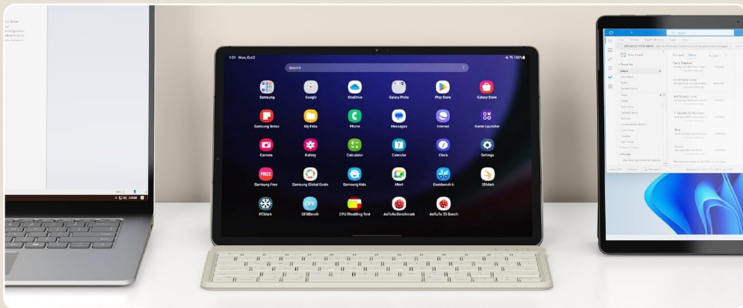
Image: Satechi OntheGo Keyboard connected to a USB-C charging cable.