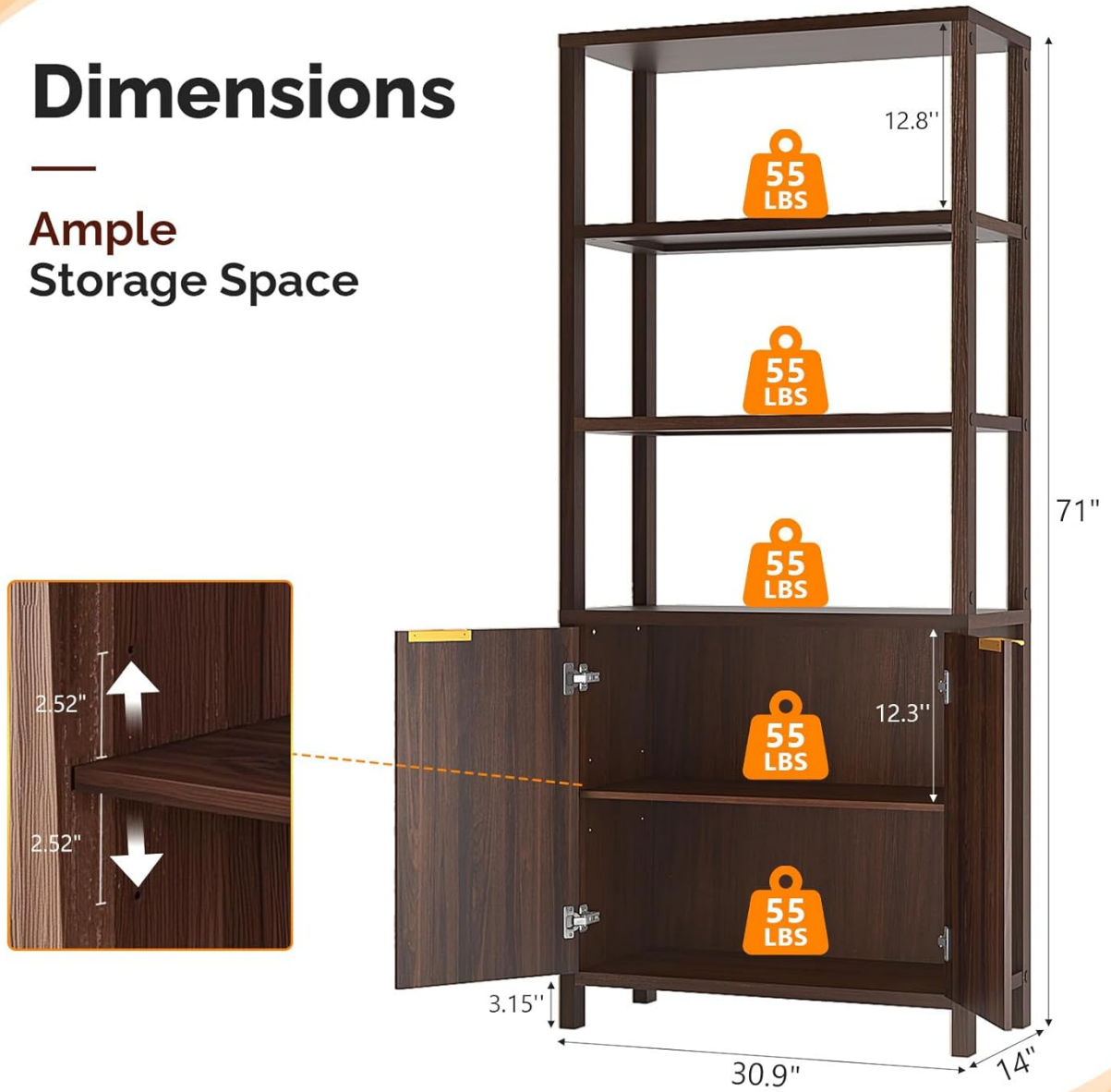
Figure 2: Detailed dimensions of the bookcase and a close-up of the adjustable shelf mechanism within the lower cabinet, highlighting the 2.52-inch adjustment increments.