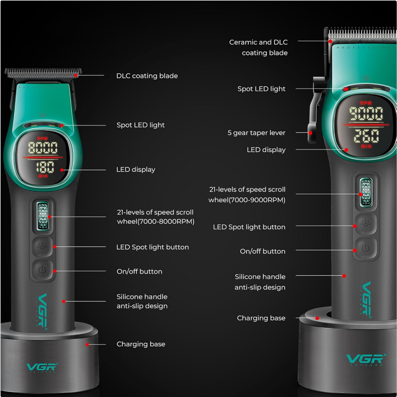
Image 6.1: Close-up of the DLC-coated ceramic blades, highlighting their precision design for smooth cutting.

Regular lubrication is crucial for maintaining blade performance and longevity. After cleaning and drying the blades, apply a few drops of the provided lubricant oil to the teeth of the blades. Turn on the device for a few seconds to allow the oil to distribute evenly. Wipe off any excess oil.