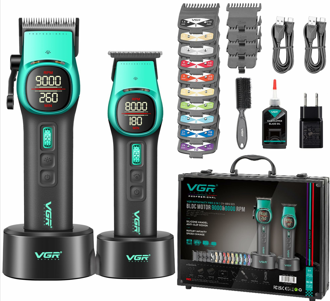
Image 1.1: The VGR 885 S2 Cordless Barber Clippers and Trimmers Kit, showcasing both the clipper and trimmer units on their magnetic charging bases.