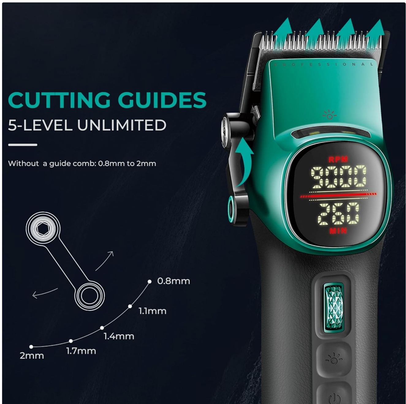
Image 4.2: Diagram showing the 5-level taper lever adjustment on the clipper for precise cutting lengths.

The clipper features a 5-position taper lever for fine-tuning cutting length without a guide comb. Adjust the lever to select lengths from 0.8mm to 2mm (0.8mm, 1.1mm, 1.4mm, 1.7mm, 2mm).