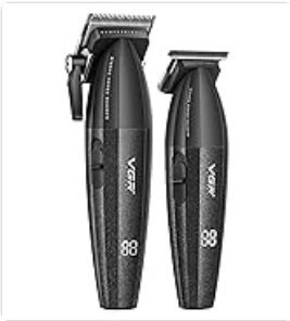
Image 9.1: VGR offers a 1-year warranty and 24-hour customer support for their products.

VGR products are manufactured with high-quality standards. This product comes with a 1-Year Limited Warranty from the date of purchase, covering defects in materials and workmanship under normal use. For technical assistance, troubleshooting, or warranty claims, please contact VGR customer support. Our support team is available to assist you.