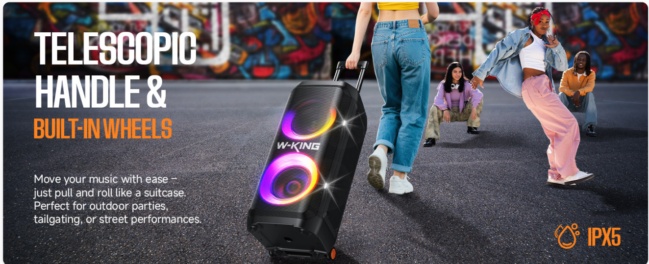
Image: A person pulling the W-KING T12 speaker using its telescopic handle and built-in wheels on an urban street, highlighting its portability and IPX5 water resistance rating, suitable for outdoor use.