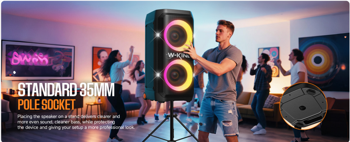
Image: The W-KING T12 speaker positioned on a stand, demonstrating the use of its standard 35mm pole socket for elevated placement, which can improve sound clarity and bass.

Position the speaker on a stable, flat surface. For enhanced sound projection and a professional setup, the speaker includes a standard 35mm pole socket, allowing it to be mounted on a speaker stand (stand not included).