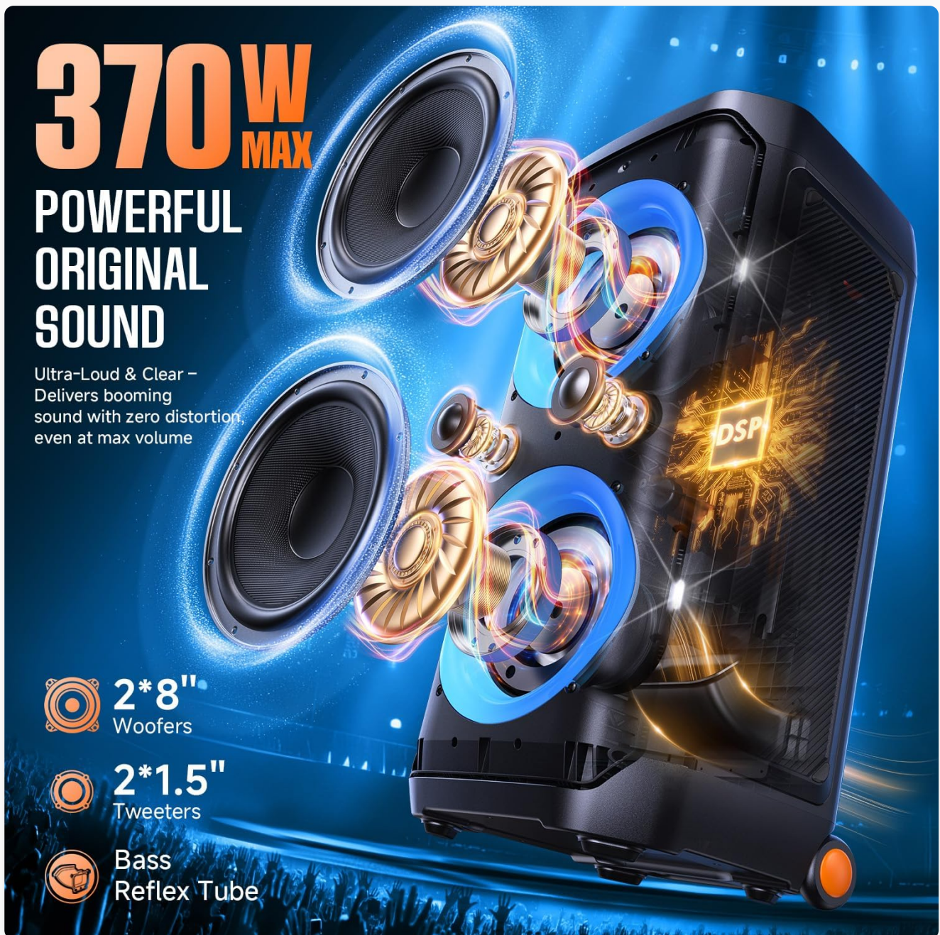
Image: An exploded view of the W-KING T12 speaker, highlighting its internal components including two 8-inch woofers, two 1.5-inch tweeters, and the Digital Signal Processor (DSP) chip, emphasizing its 370W maximum power output.