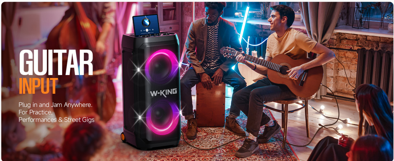
Image: A person playing an acoustic guitar connected to the W-KING T12 speaker, demonstrating the guitar input feature for practice, performances, or street gigs.