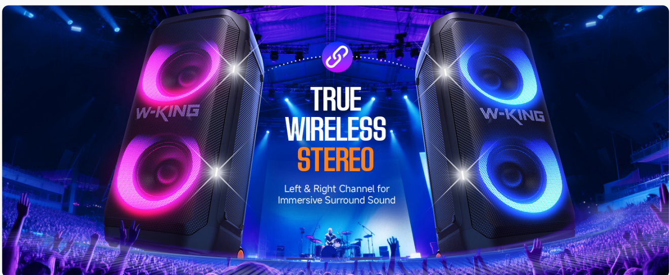
Image: Two W-KING T12 speakers positioned to create a True Wireless Stereo setup, with one speaker acting as the left channel and the other as the right, providing immersive surround sound in a concert-like environment.