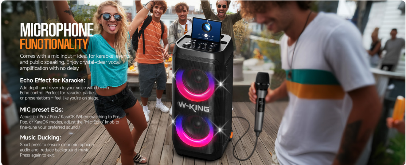
Image: A group of people enjoying karaoke with the W-KING T12 speaker, illustrating the microphone input functionality, echo effect, and microphone preset EQ modes (Acoustic, Professional, Pop, Karaoke) for vocal customization.