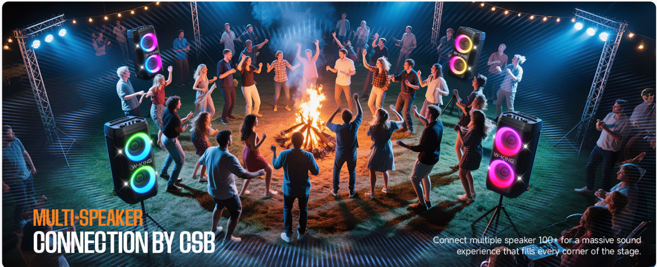
Image: An outdoor party scene with multiple W-KING T12 speakers strategically placed, illustrating the Multi-Speaker Connection (CSB) mode which allows linking 100+ speakers for a massive, synchronized sound experience.