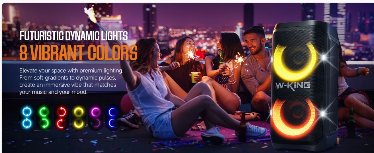
Image: The W-KING T12 speaker displaying various vibrant, dynamic LED light effects, illustrating the 8 available colors and 6 modes that sync with music to enhance the party atmosphere.

The speaker features dynamic LED lights that sync with your music. Press the 'Lights' button on the control panel to cycle through 6 different lighting modes or to turn them off.