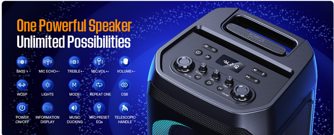
Image: An overhead view of the W-KING T12 speaker's control panel, illustrating the various buttons and knobs for functions such as Bass, Treble, Mic Echo, Mic Volume, Master Volume, Power On/Off, WDSP (EQ modes), Lights, Mode selection, Repeat One, CSB, Information Display, Music Ducking, Mic Presets, and the Telescopic Handle.

Familiarize yourself with the control panel and various input/output ports for seamless operation.