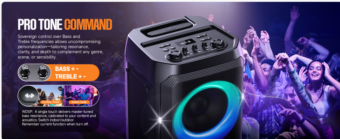
Image: A close-up of the W-KING T12 control panel, highlighting the Bass and Treble adjustment knobs and the WDSP button for switching between Indoor and Outdoor sound modes, allowing users to customize the audio profile.