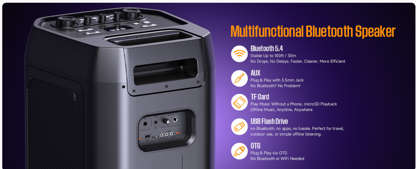
Image: A detailed view of the rear input/output panel of the W-KING T12 speaker, showing connections for Wired Mic, DC-IN Port (for charging), Guitar Volume Knob, Guitar Input, Fast Charging USB-C, USB Drive, TF Card, Monitor Output, AUX Out, AUX In, Reset button, and OTG port.

Image: An overhead view of the W-KING T12 speaker's control panel, illustrating the various buttons and knobs for functions such as Bass, Treble, Mic Echo, Mic Volume, Master Volume, Power On/Off, WDSP (EQ modes), Lights, Mode selection, Repeat One, CSB, Information Display, Music Ducking, Mic Presets, and the Telescopic Handle.