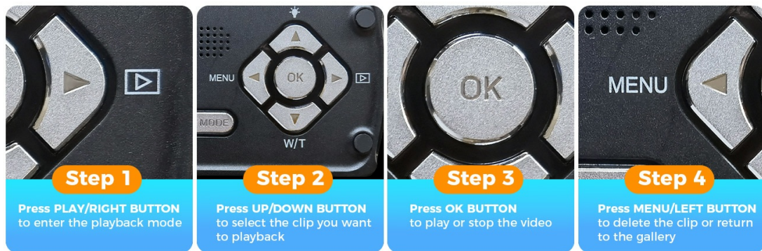
Image: Step-by-step guide on using the camcorder's buttons for recording and photography.