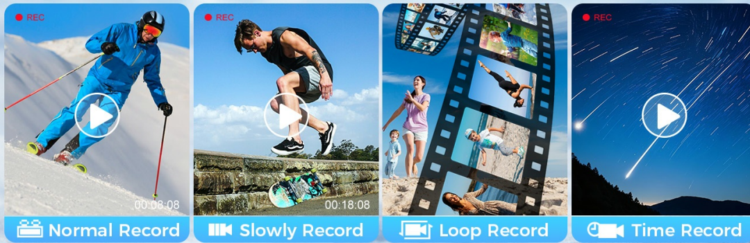
Image: Examples of different recording modes, including pause, slow-motion, and time-lapse.