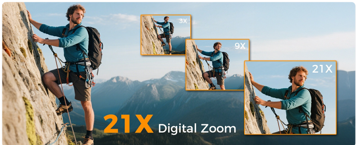
Image: Visual comparison of 3x, 9x, and 21x digital zoom, and the difference between normal and 120° wide-angle views.