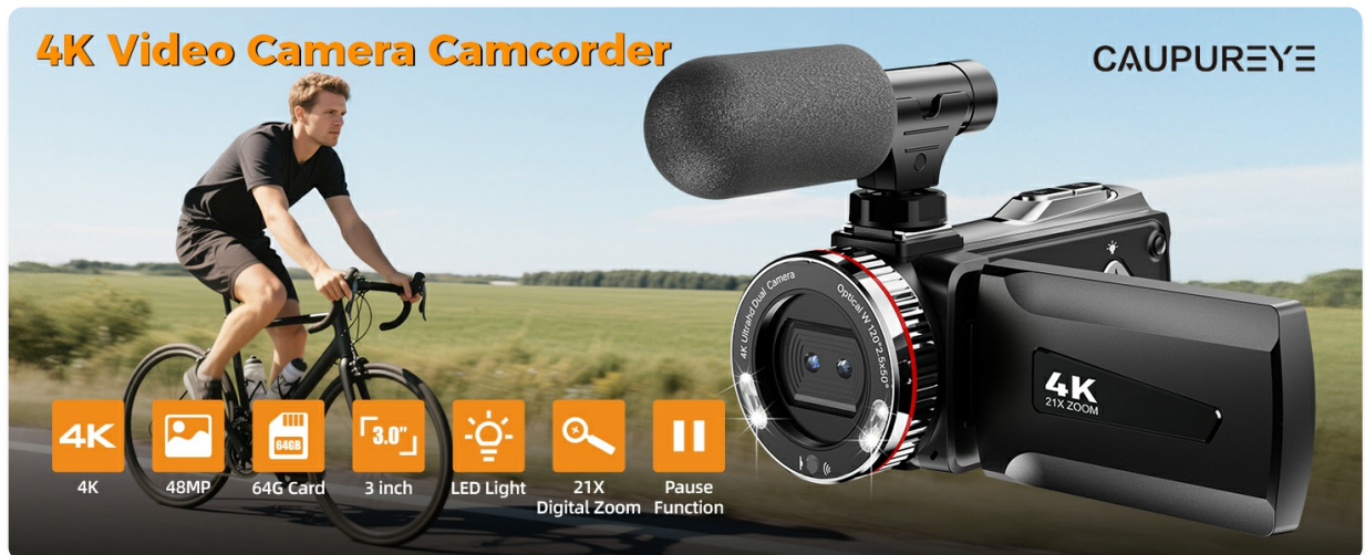
Image: The camcorder capturing a scene, highlighting its 4K 48MP capabilities and rotatable screen.

The Caupureye HDV900pro camcorder features a compact design with a 3.0-inch 270° rotatable screen for versatile shooting. It supports 4K video and 48MP photos, with 21x digital zoom. The camera includes a built-in fill light for low-light conditions and dual lenses (wide-angle and narrow) for various scenarios.