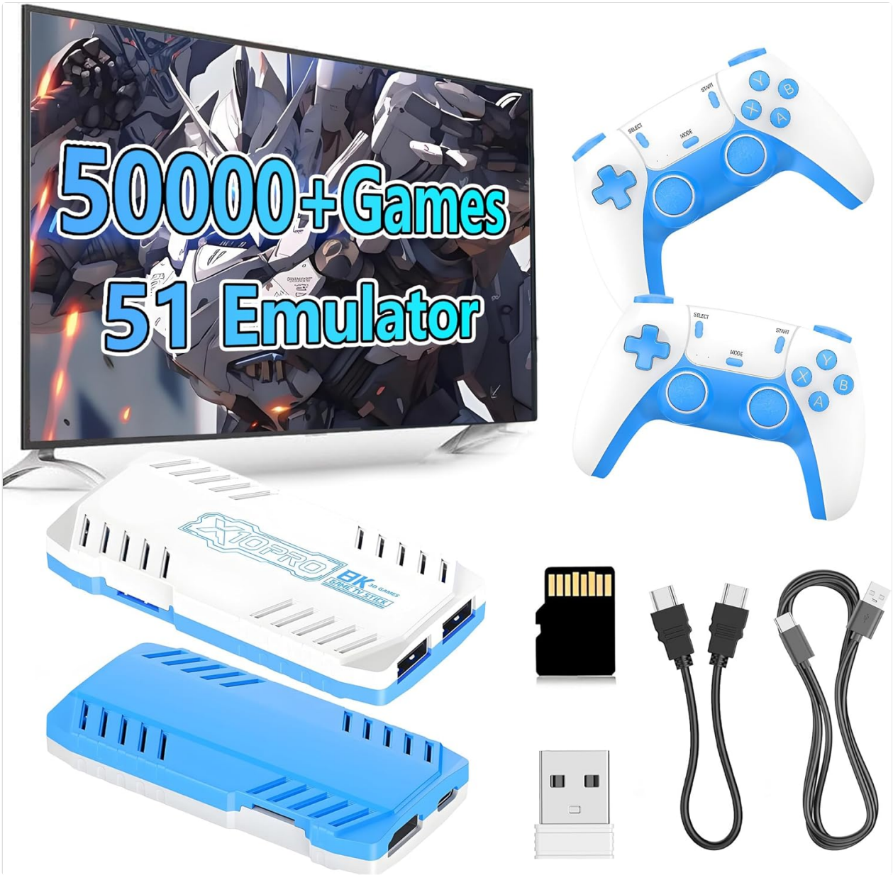
Figure 2.2: QISHENKOLA X10 Pro System Overview