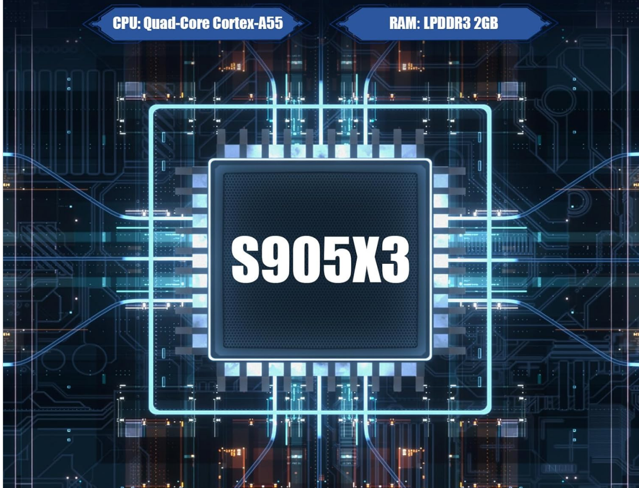
Figure 5.1: S905X3 Chip Overview

S905X3 gaming chip provides smooth gaming graphics and meets the needs of retro 2D games and some 3D games