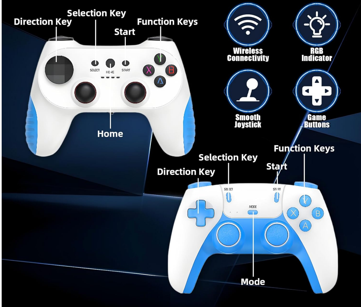
Figure 2.3: Wireless Controller Layout

Free from cables, enjoy gaming joy even away from TV