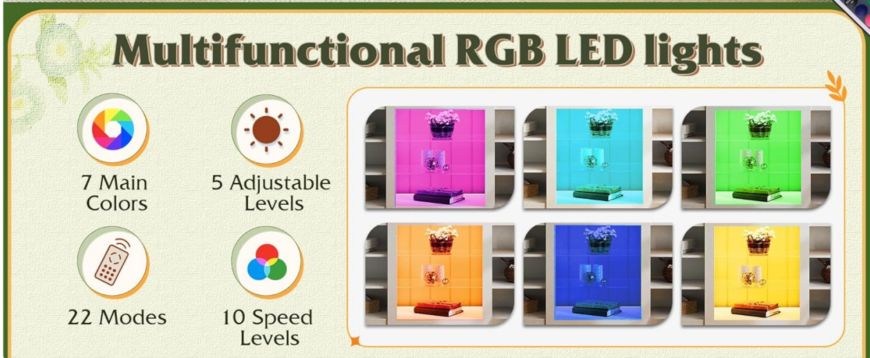
Image 5.1: Remote control and features of the multifunctional RGB LED lights.