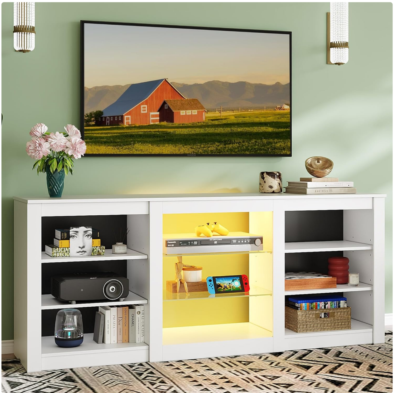
Image 1.1: The WLIVE Modern TV Stand, showcasing its design and storage capabilities.