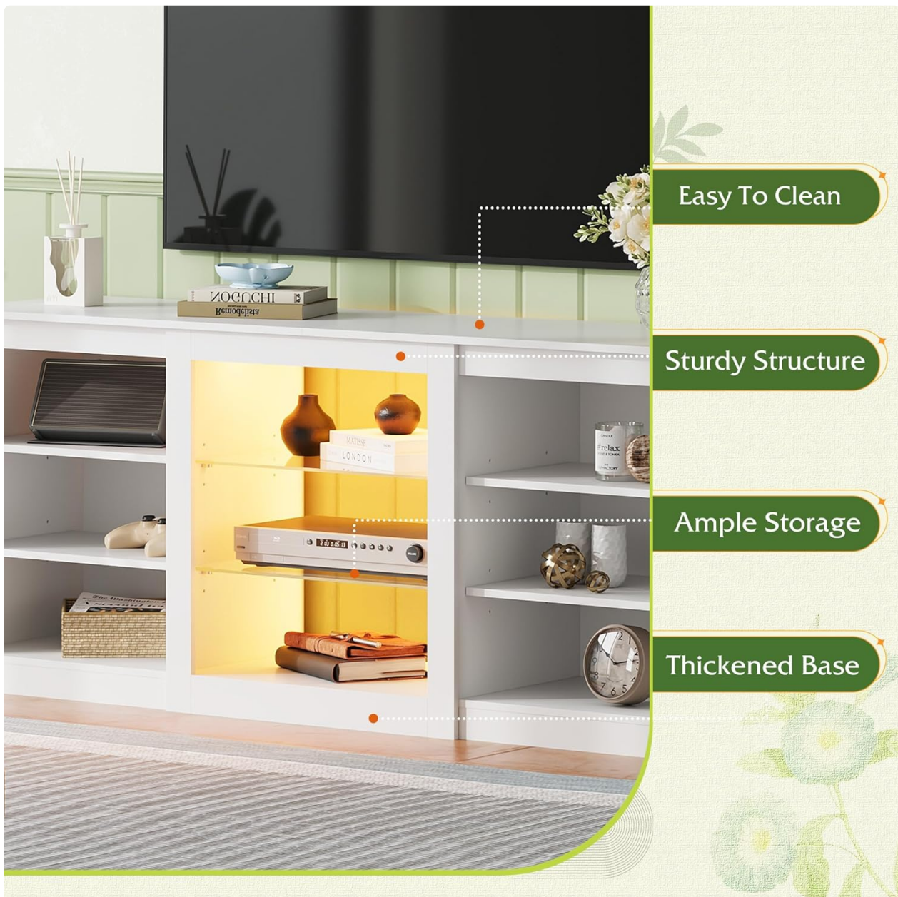
Image 6.1: Key features of the TV stand, including its easy-to-clean surface.