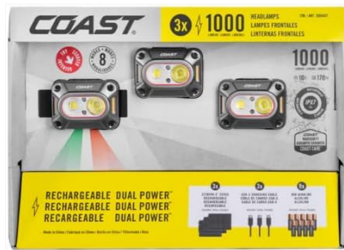
Image: The COASTS CH1000R Headlamp 3-pack in its retail packaging, showcasing the three headlamps and included accessories.

The COASTS CH1000R Headlamp is a powerful and versatile lighting solution designed for various applications, including outdoor activities, work, and emergency preparedness. This 3-pack set provides 1000 lumens of high-performance lighting with multiple adaptable modes. The headlamp features a Dual Optic system for both wide coverage and long-range precision, and is built with IPX7 waterproof-rated construction for durability in rugged environments. It supports Dual Power technology, allowing use with the included USB-C rechargeable batteries or standard AAA alkaline batteries.