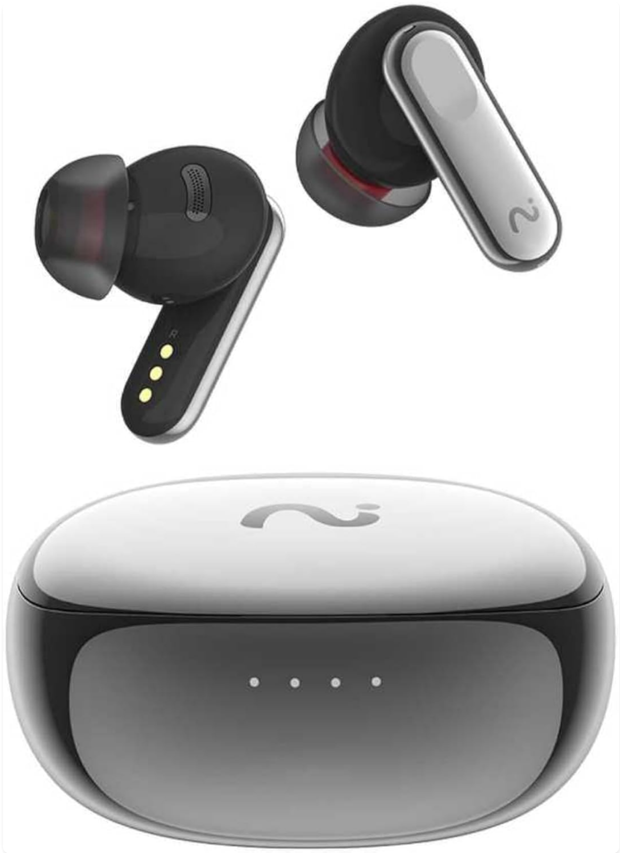
Image: VIAIM Nano+ AI Transcribe&Translation Earbuds and their charging case.