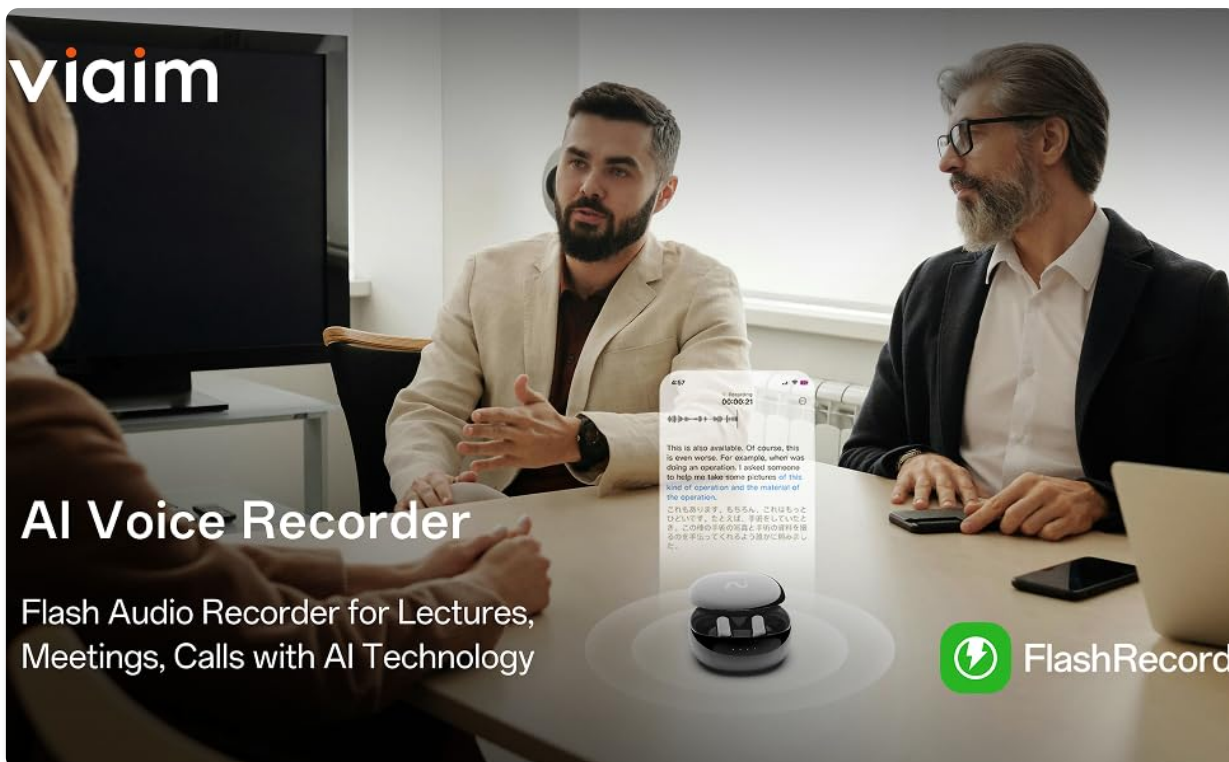
Image: A user utilizing the AI Voice Recorder feature of the VIAIM Nano+ earbuds during a meeting.

Utilize the dual-mode voice recording for capturing audio. Record directly through the earbuds for clear audio capture.