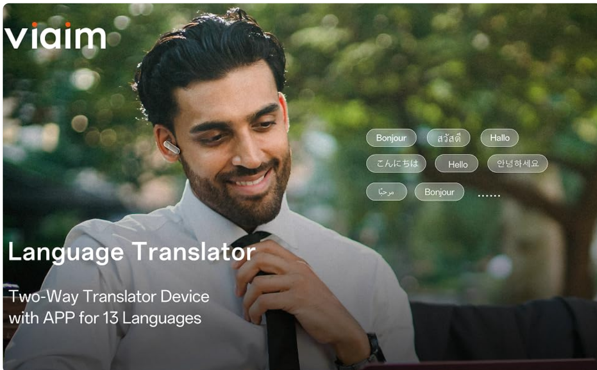
Image: A user demonstrating the real-time language translation feature of the VIAIM Nano+ earbuds.