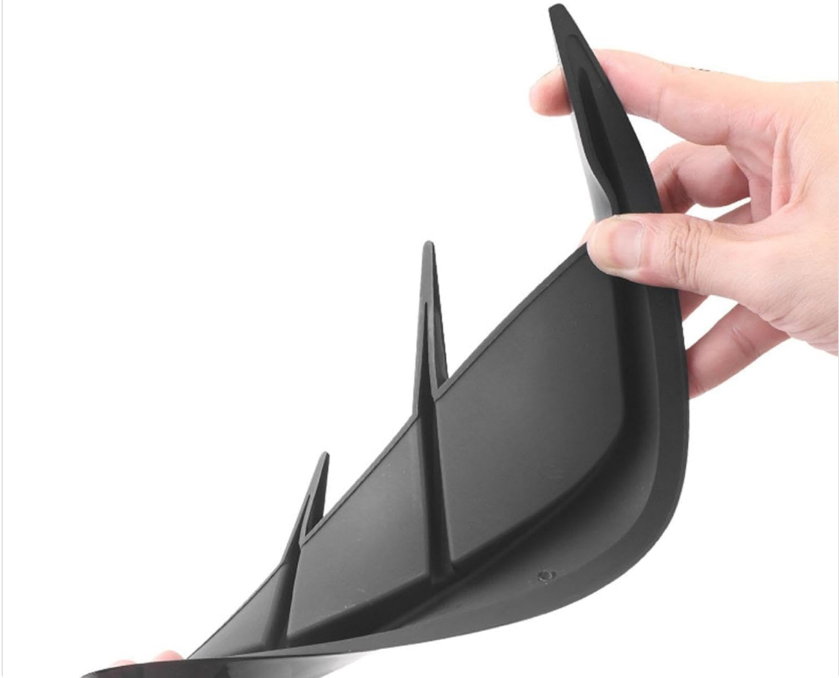
Image 3.2: A hand demonstrating the flexibility of the emblem sticker, showcasing its soft and adaptable material.