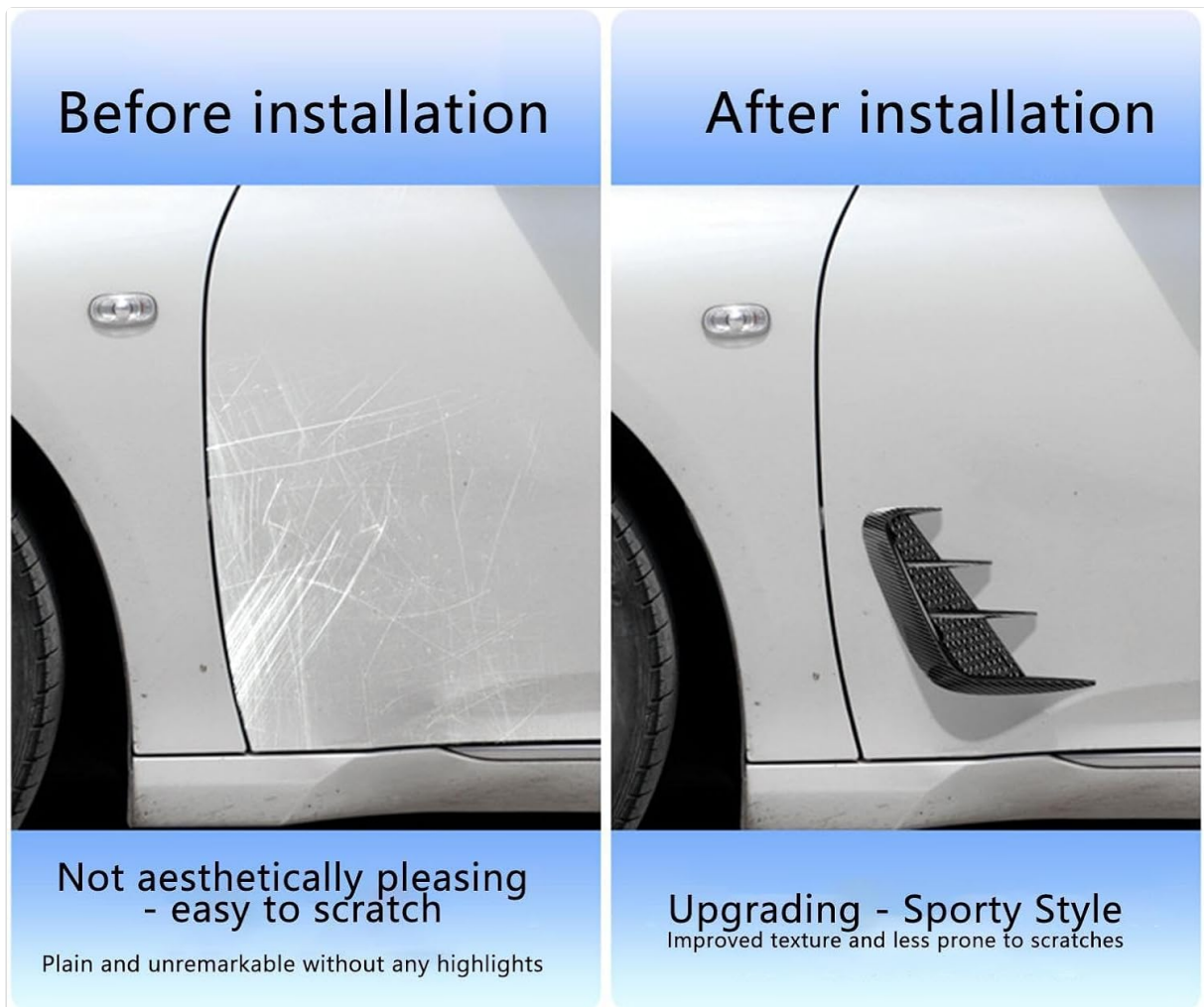
Image 5.2: Visual comparison of a car's side panel before and after emblem sticker installation, demonstrating improved aesthetics and coverage of minor imperfections.