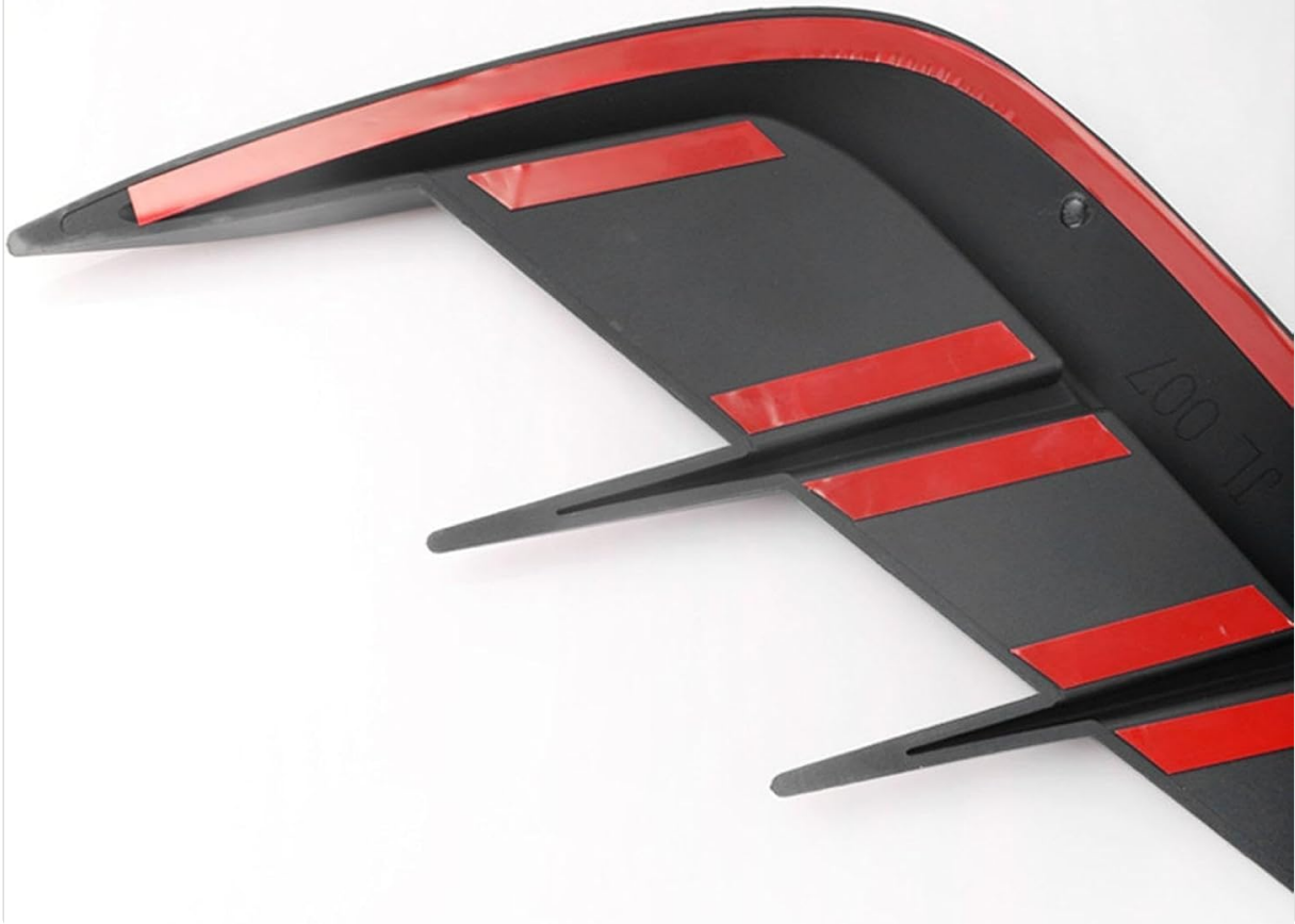
Image 5.1: Close-up of the emblem sticker's reverse side, showing the customized automotive-grade adhesive backing.