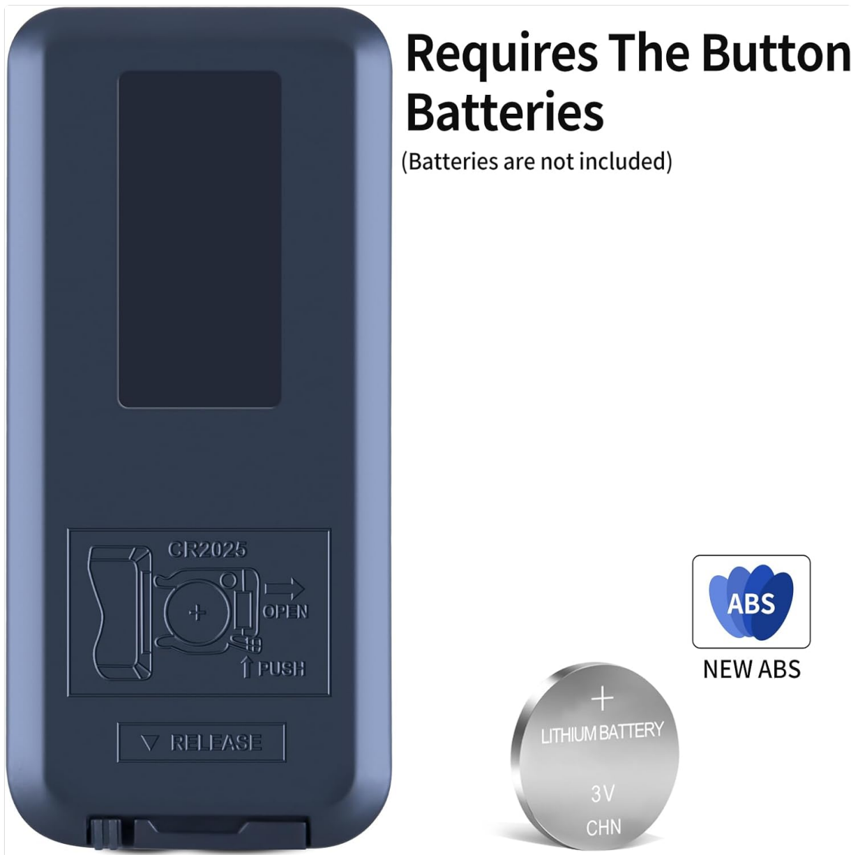
Figure 3.1: The battery compartment on the back of the remote, indicating CR2025 battery type and installation direction.

Important: Ensure the battery is inserted with the correct polarity. Incorrect installation may damage the remote control.