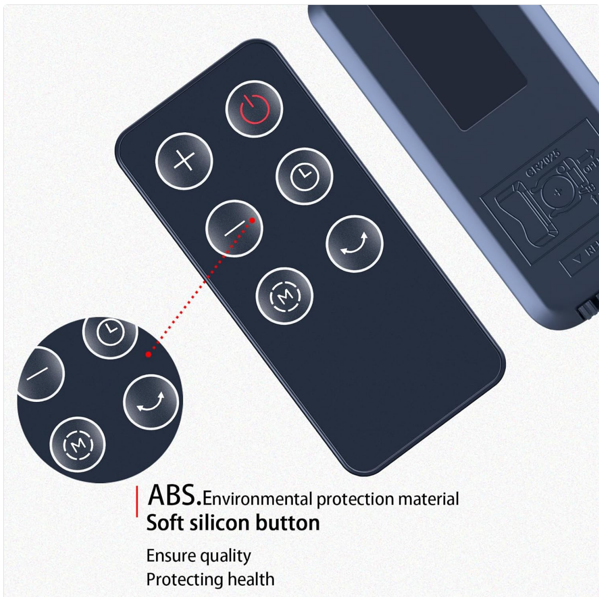
Figure 2.2: Detail of the remote control's soft silicone buttons and durable ABS material.

The remote control includes the following buttons: