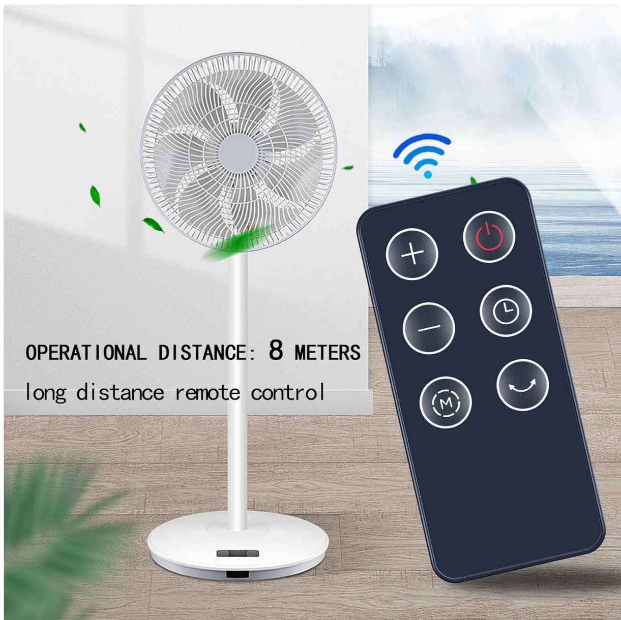
Figure 4.2: The remote control's effective operational distance from the device.