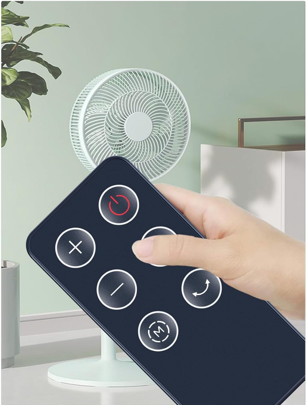
Figure 4.1: Proper way to hold and point the remote control towards the device.

The operational distance for the remote control is approximately 10 meters (33 feet) under optimal conditions. Ensure there are no obstructions between the remote and the device's receiver.