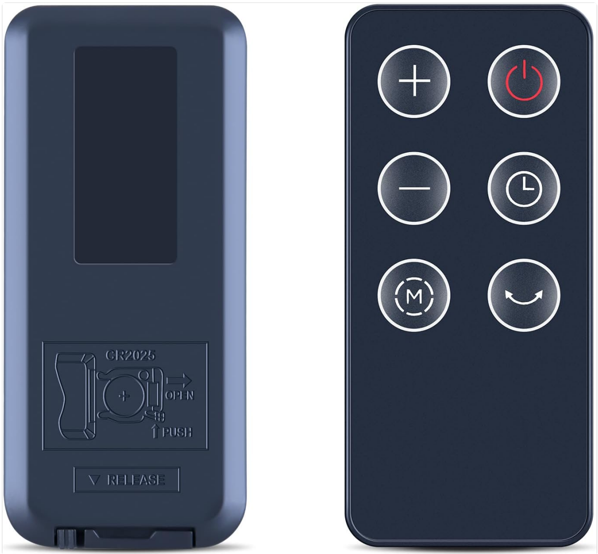
Figure 2.1: Front and back view of the remote control, showing the button layout and battery compartment.