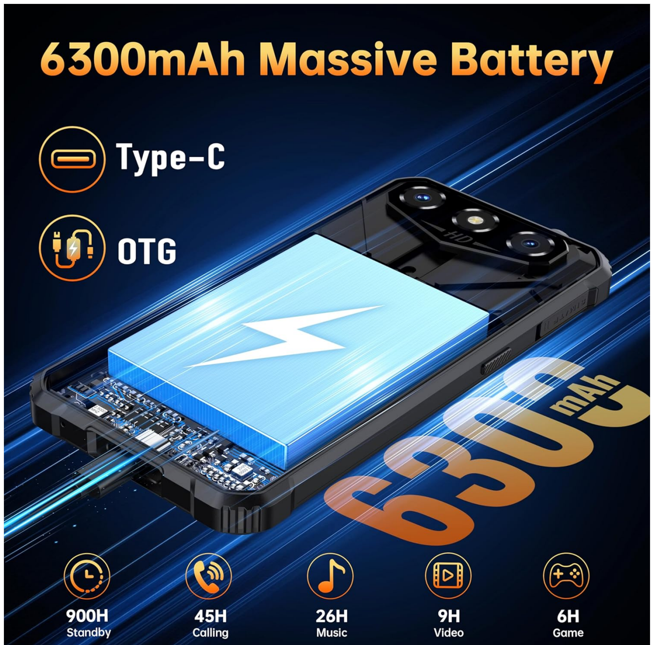
Image: Visual representation of the 6300mAh battery capacity and estimated usage times for standby, calls, music, and video playback.

The OUKITEL G3 is equipped with a 6300mAh battery, providing extended usage times. A full charge can offer up to 900 hours of standby time, 45 hours of call time, 26 hours of music playback, or 9 hours of video watching.