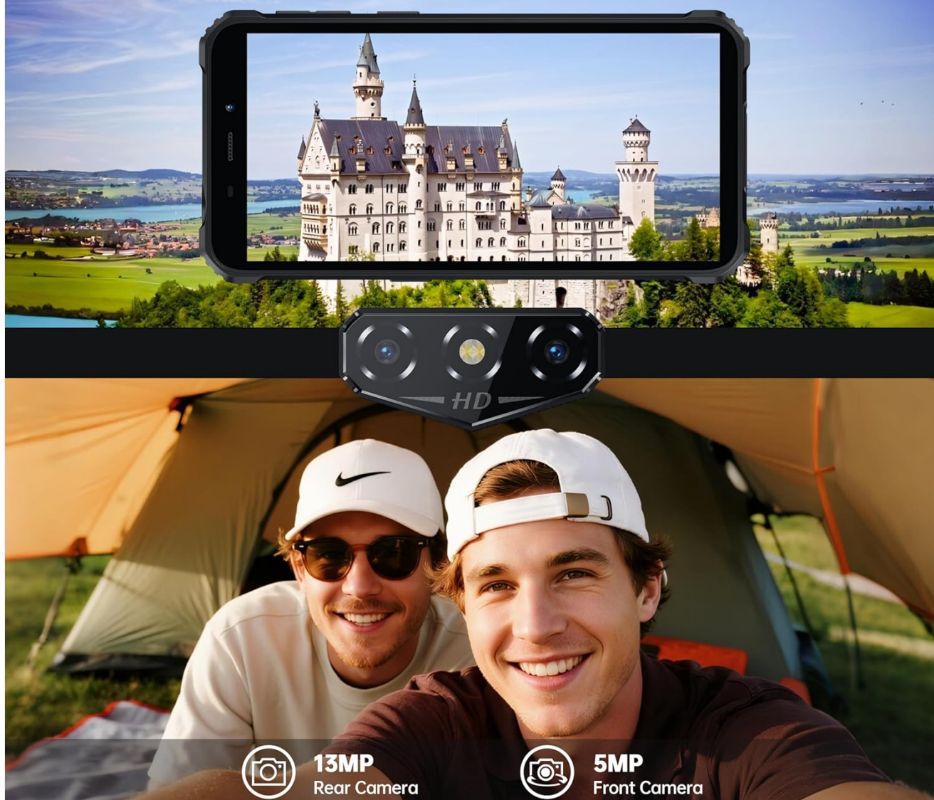
Image: Depiction of the OUKITEL G3's triple AI cameras, including the 13MP rear camera and 5MP front camera, capturing images of landscapes and people.