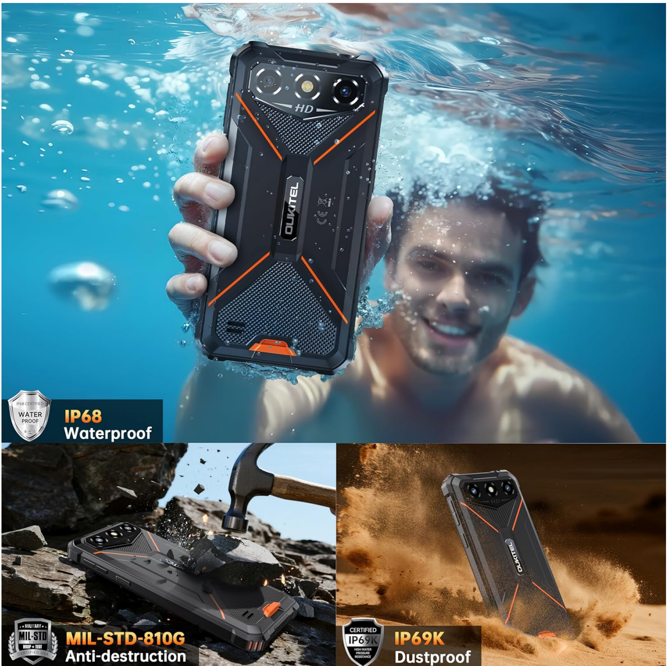
Image: Composite image showing the OUKITEL G3 submerged in water, being hit by a hammer, and covered in dust, illustrating its IP68, MIL-STD-810G, and IP69K certifications.