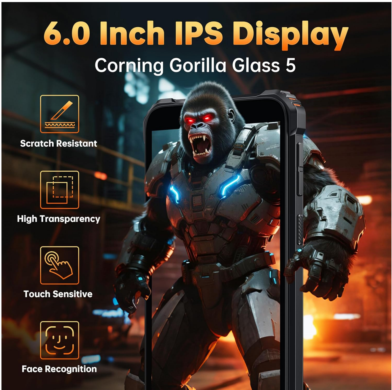
Image: Visual highlighting the 6.0-inch IPS display with Corning Gorilla Glass 5, emphasizing scratch resistance, high transparency, and touch sensitivity.

The device features a 6.0-inch HD+ display protected by Corning Gorilla Glass 5. This screen offers enhanced resistance against scratches and drops, ensuring clear and vivid visuals with a brightness of 415 nits.