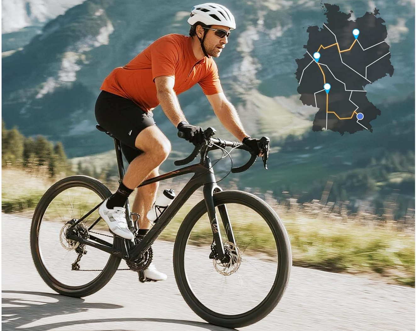
Image: A person cycling with the OUKITEL G3, illustrating the phone's GPS, Galileo, Beidou, and GLONASS navigation capabilities.