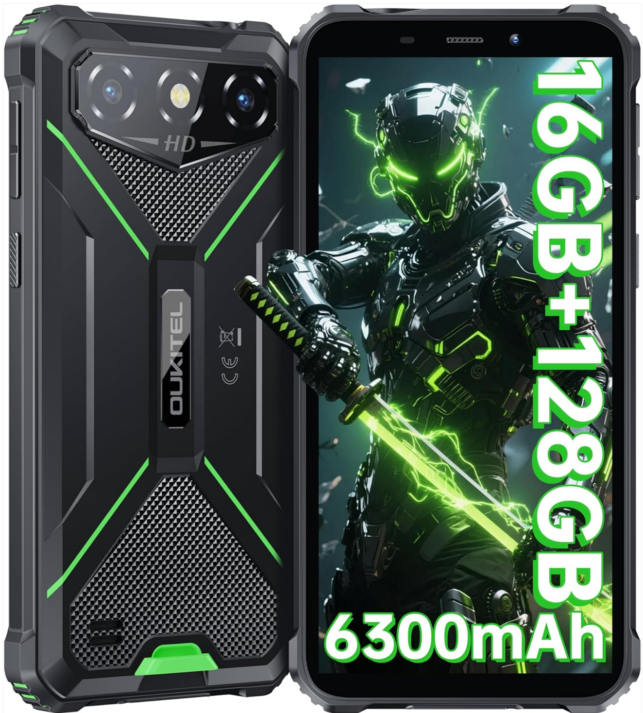
Image: Front and back view of the OUKITEL G3 Rugged Smartphone, highlighting its robust design.