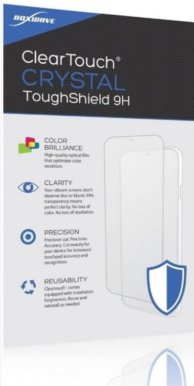
Image: Blaupunkt BP260PLAY device with the ClearTouch Crystal ToughShield 9H screen protector installed, demonstrating its clear appearance.