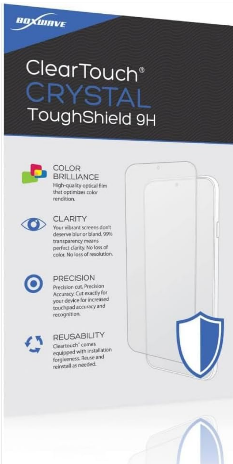
Image: Contents of the BoxWave ClearTouch Crystal ToughShield 9H package, including two screen protectors and tools for installation.