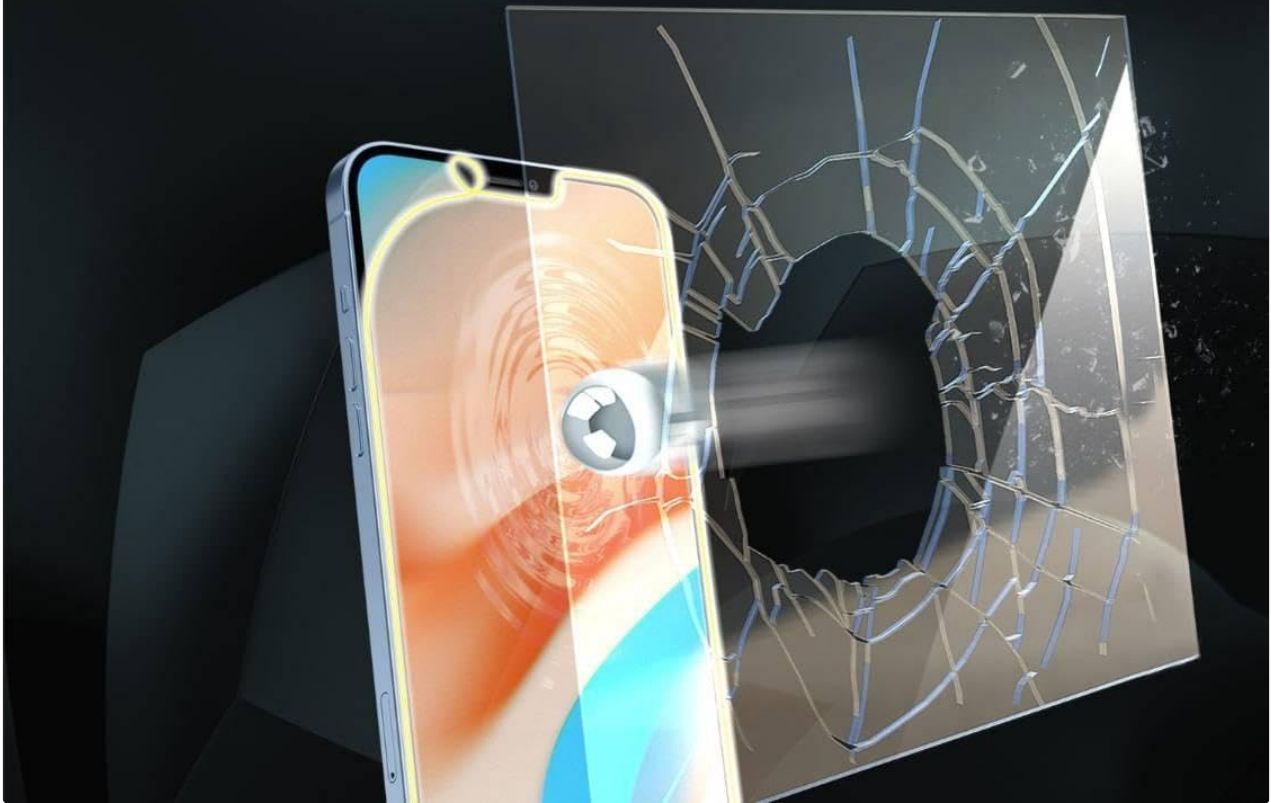
Image: The 9H ToughShield provides ultimate protection against daily hazards like keys, spills, and minor drops.