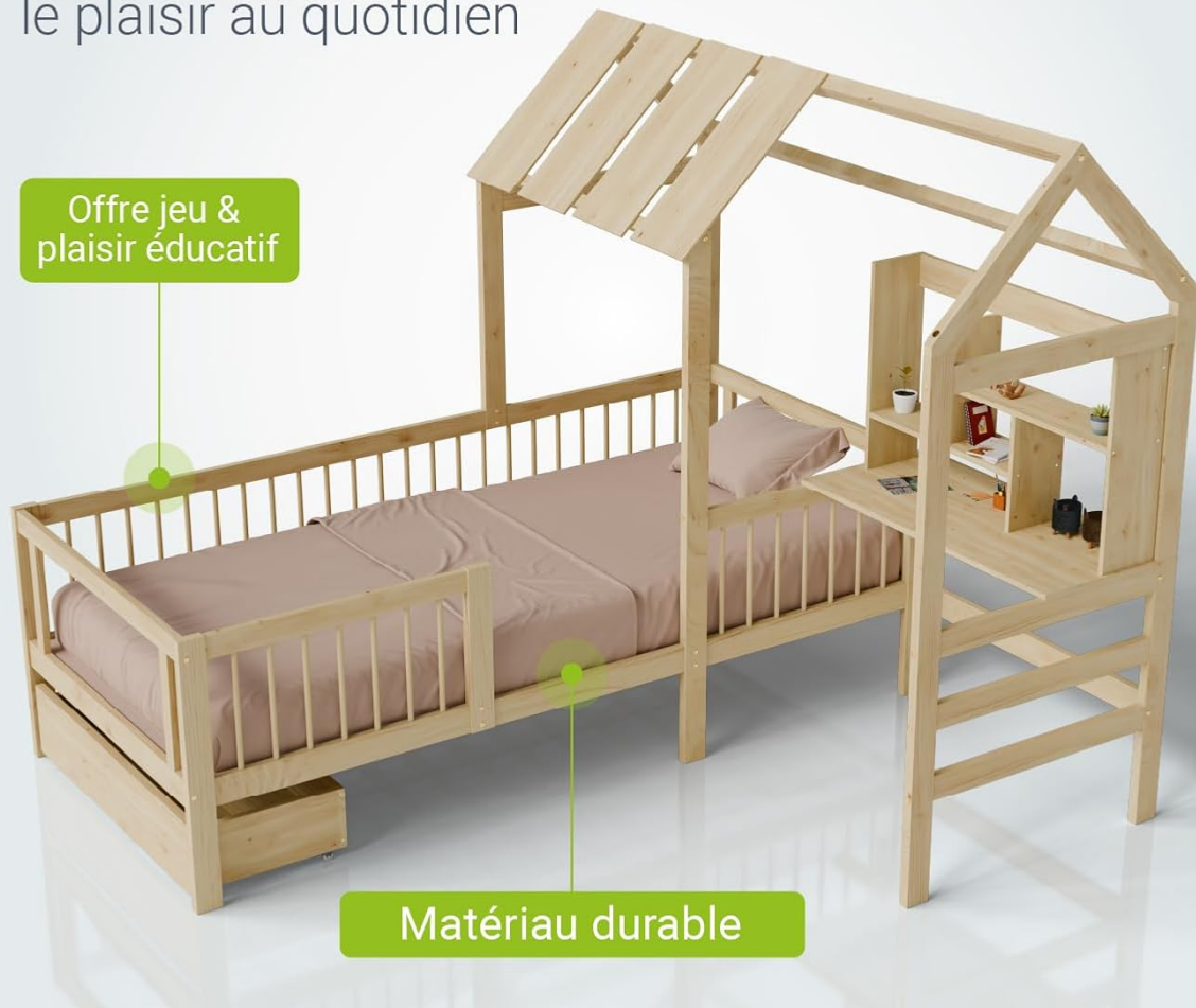
Image 4.1: The Juskys Yari bed functioning as a play bed with an integrated desk, promoting creativity and daily enjoyment. This image highlights the multi-functional aspect of the bed.

Lit de jeu conçu avec amour pour la créativité et le plaisir au quotidien