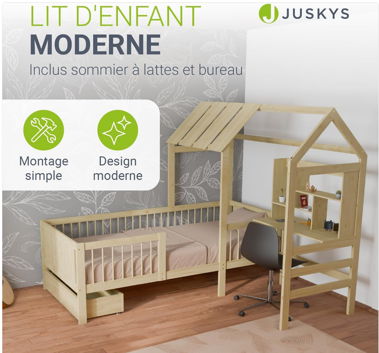
Image 3.1: The JusKys Yari children's bed, showcasing its modern design with an integrated desk and slatted frame. This image illustrates the assembled product.