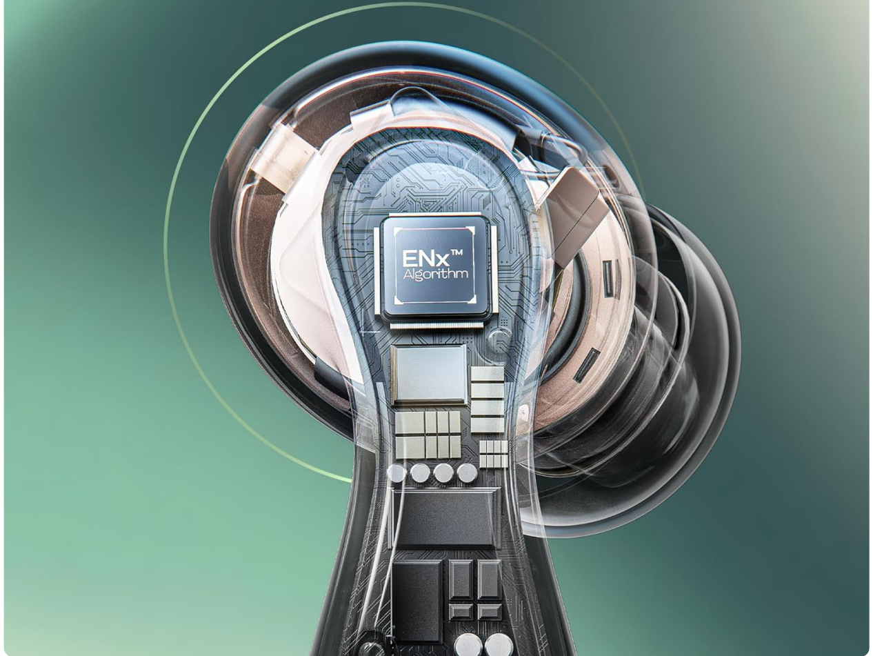
Figure 5: Internal view highlighting the Quad Mics with ENx Technology for enhanced call clarity.