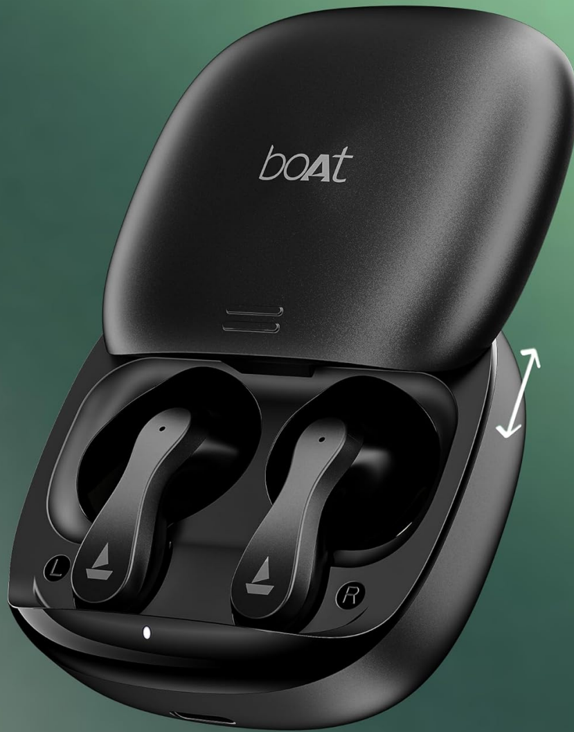
Figure 2: The Glide Shell design allows for smooth opening and closing of the charging case.