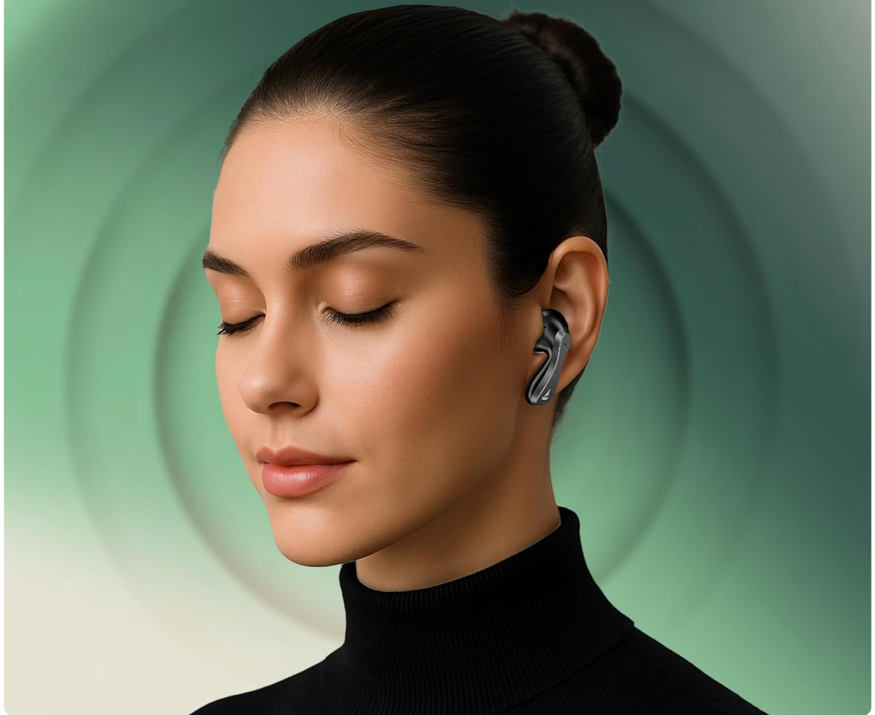
Figure 3: The 13mm drivers are engineered to deliver boAt Signature Sound for an immersive listening experience.