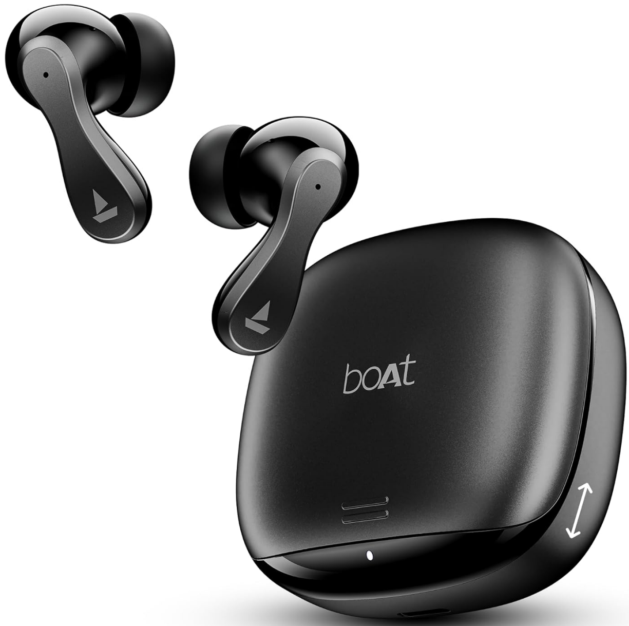
Figure 1: boAt Airdopes 313 TWS Earbuds and Charging Case in Carbon Black.