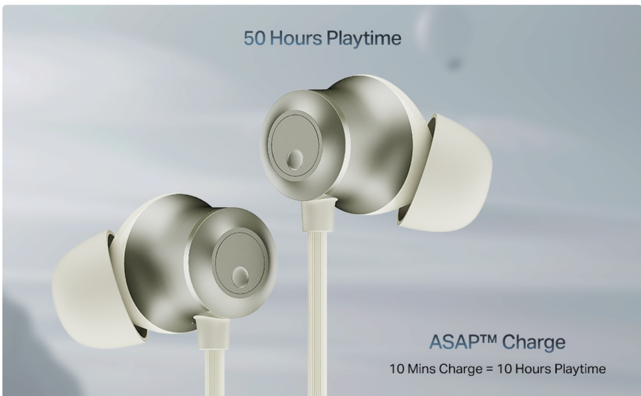
Image: The boAt Rockerz Prime 255Z neckband earphones, showcasing their sleek design.

Thank you for choosing the boAt Rockerz Prime 255Z Bluetooth Neckband Earphones. This manual provides essential information for setting up, operating, and maintaining your device to ensure optimal performance and longevity. Please read these instructions carefully before use.