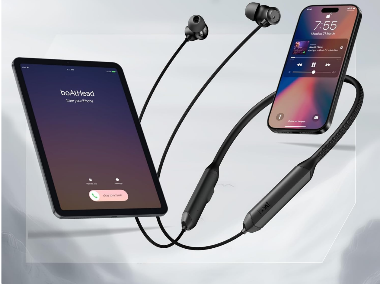
Image: The boAt Rockerz Prime 255Z neckband connected to both a smartphone and a tablet, illustrating the dual pairing feature.