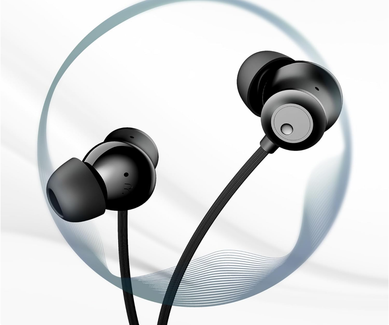
Image: A close-up of an earbud with a visual representation of sound waves, indicating 'AI-ENx Technology for Enhanced Voice Clarity on Calls'.