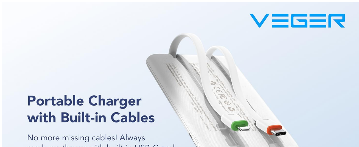
Image: Close-up of the VEGER V1202 showing the built-in USB-C and Lightning cables neatly integrated into the device.