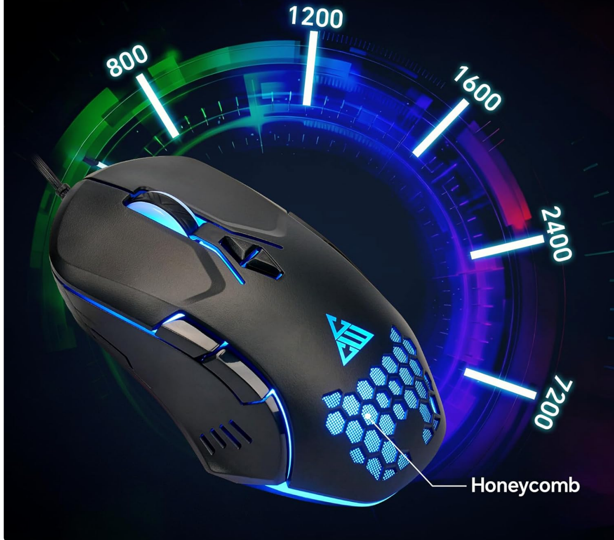
Image: The CHONCHOW Gaming Mouse with its illuminated honeycomb design, illustrating the 5-level DPI adjustment options.