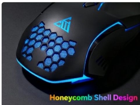
Image: A close-up view of the CHONCHOW Gaming Mouse, highlighting its honeycomb shell design and dynamic RGB backlighting.