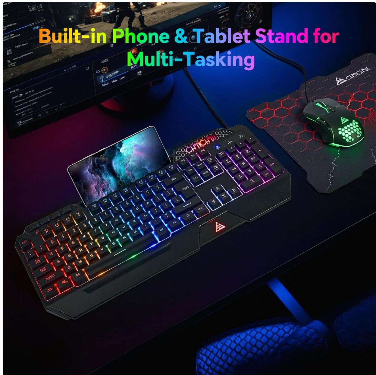
Image: The CHONCHOW Gaming Keyboard with a smartphone placed in its integrated holder, demonstrating the multi-tasking feature.