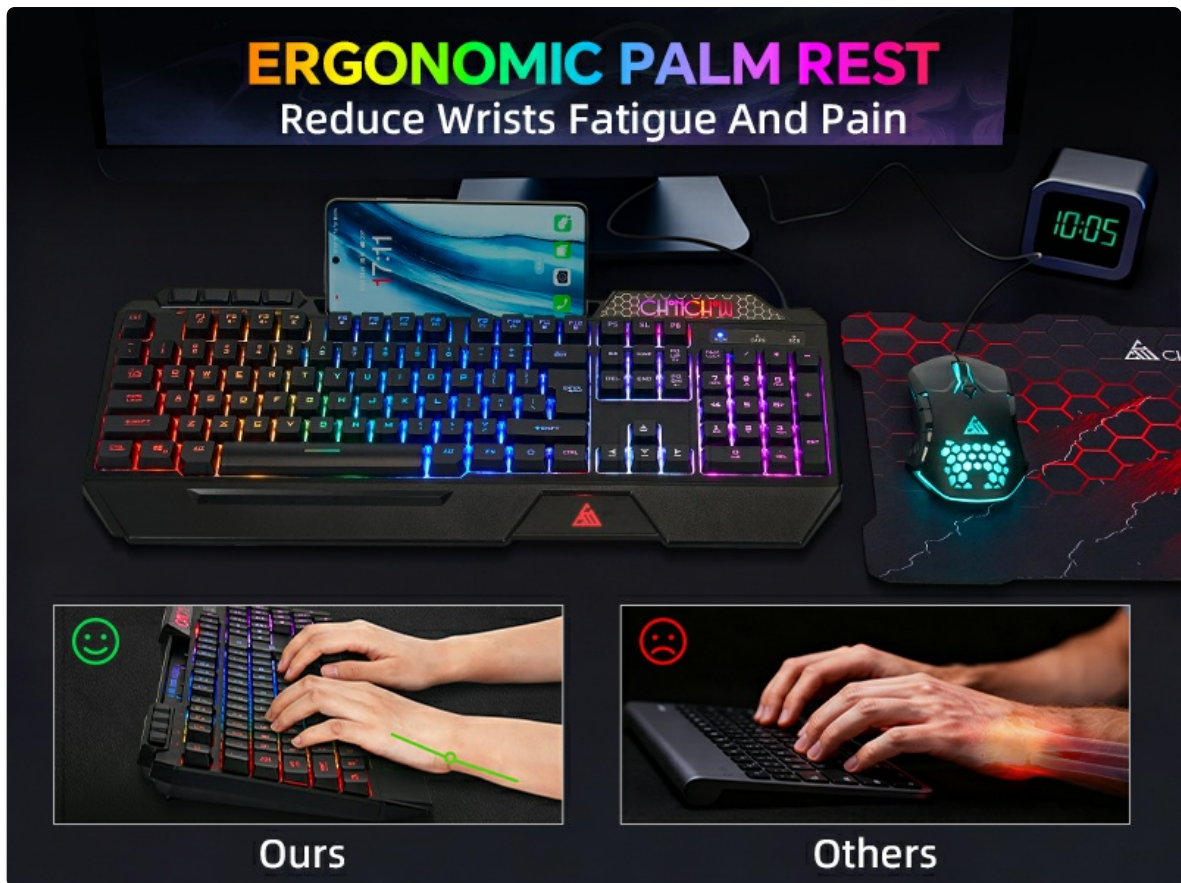
Image: An ergonomic CHONCHOW Gaming Keyboard and Mouse setup, showing comfortable hand placement with the integrated wrist rest and phone holder.