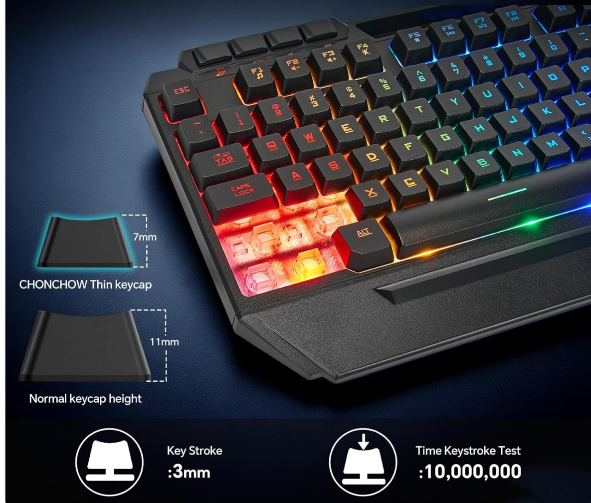
Image: A close-up view of the CHONCHOW keyboard keys, emphasizing the silent key design and tactile feel.