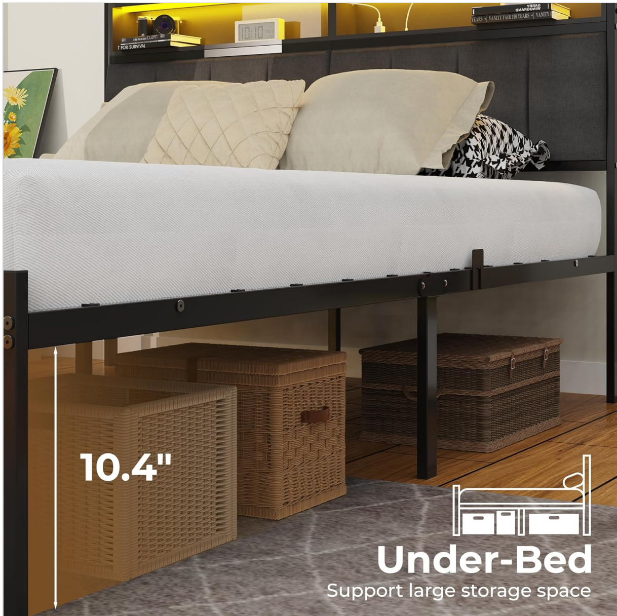
Figure 6: Under-bed storage space of 10.4 inches.