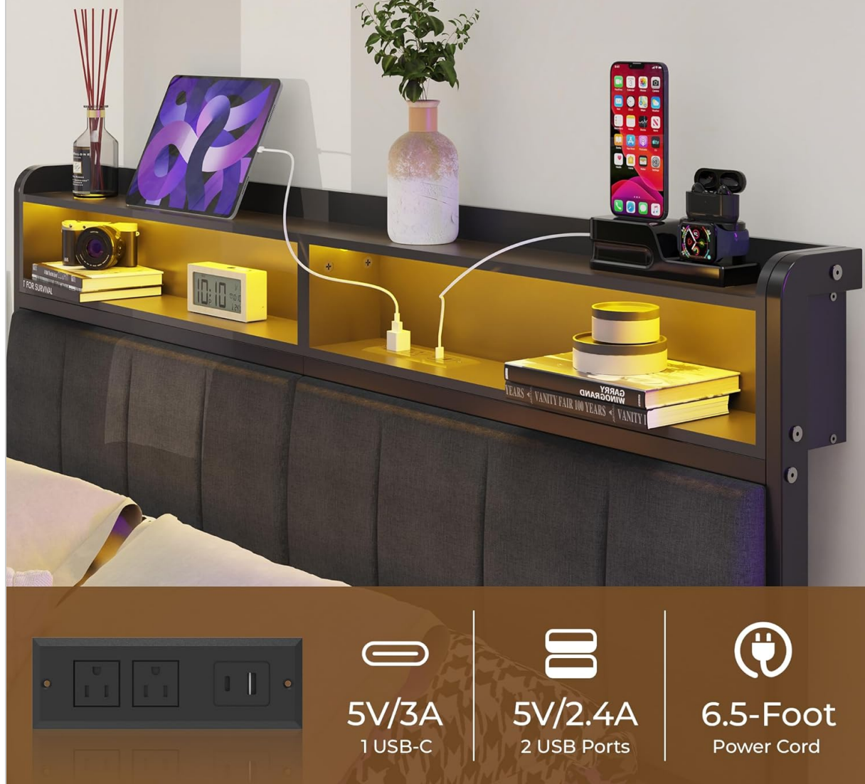
Figure 3: Headboard charging station with USB and Type-C ports.