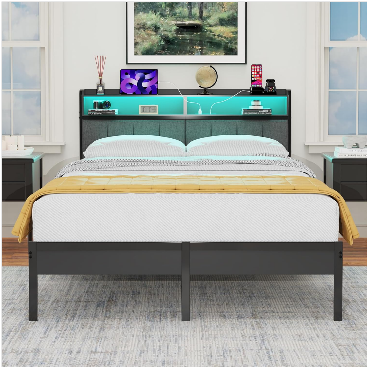
Figure 1: SANGMUCEN HBF025H01 Double Bed Frame with LED headboard and charging station.