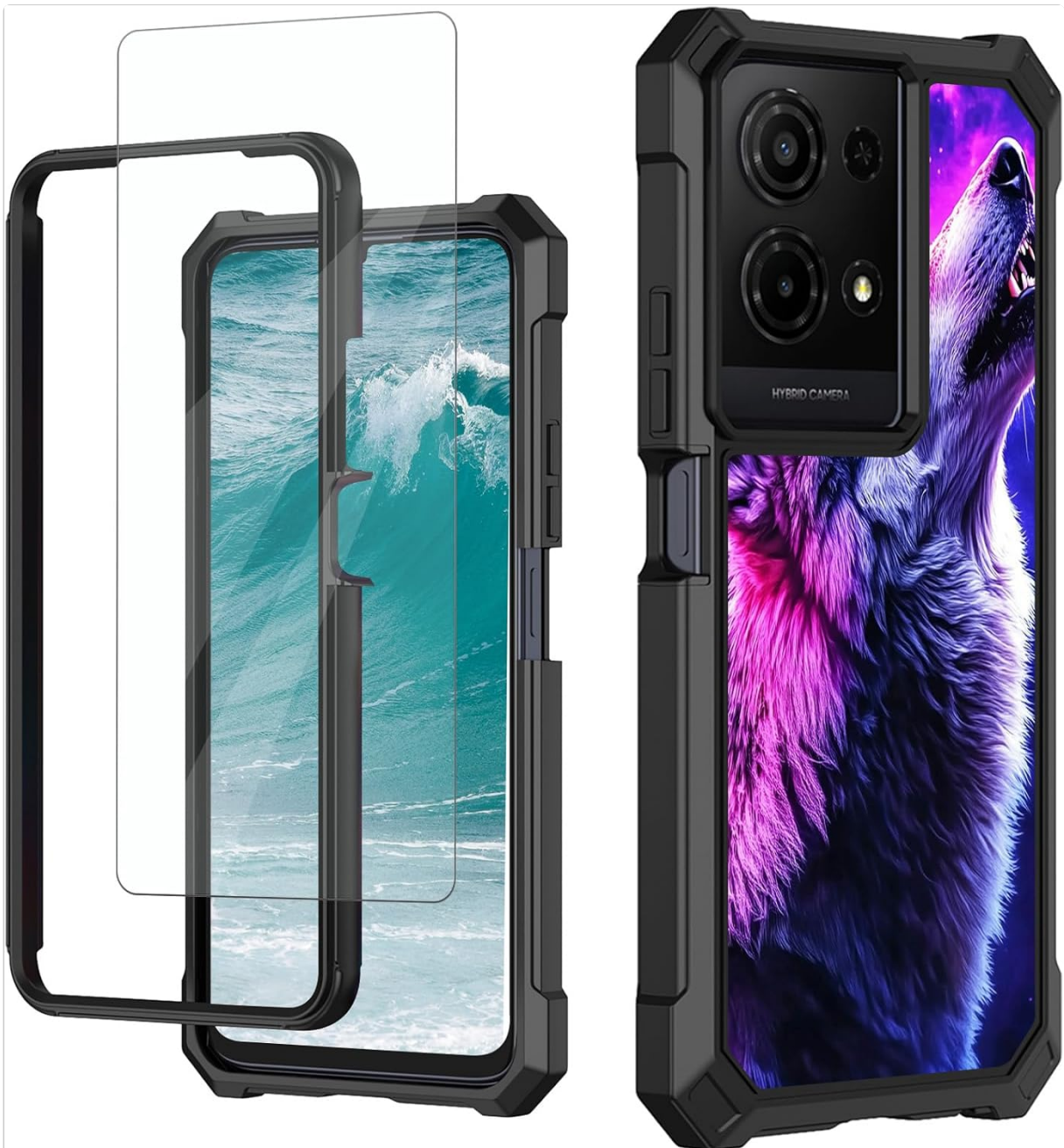
Image 1.1: The GYSYSQSH dual-layer phone case and included tempered glass screen protector.