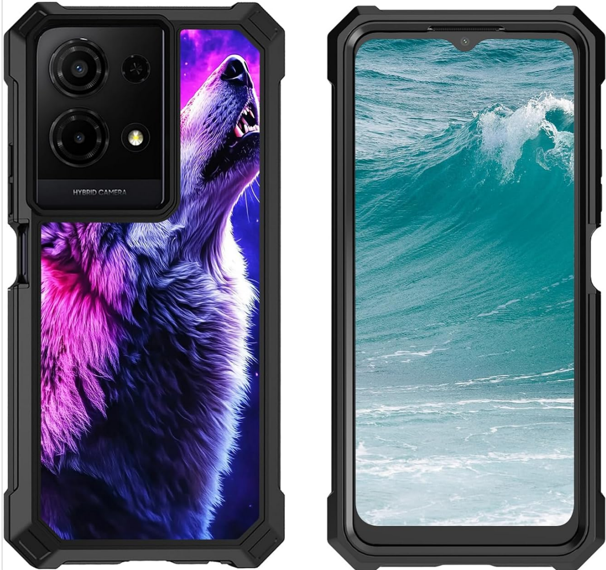
Image 3.1: The case features shock-resistant technology and drop resistance for enhanced phone protection.

Has a well-polished finish that showcases an elegant look without the added bulk.