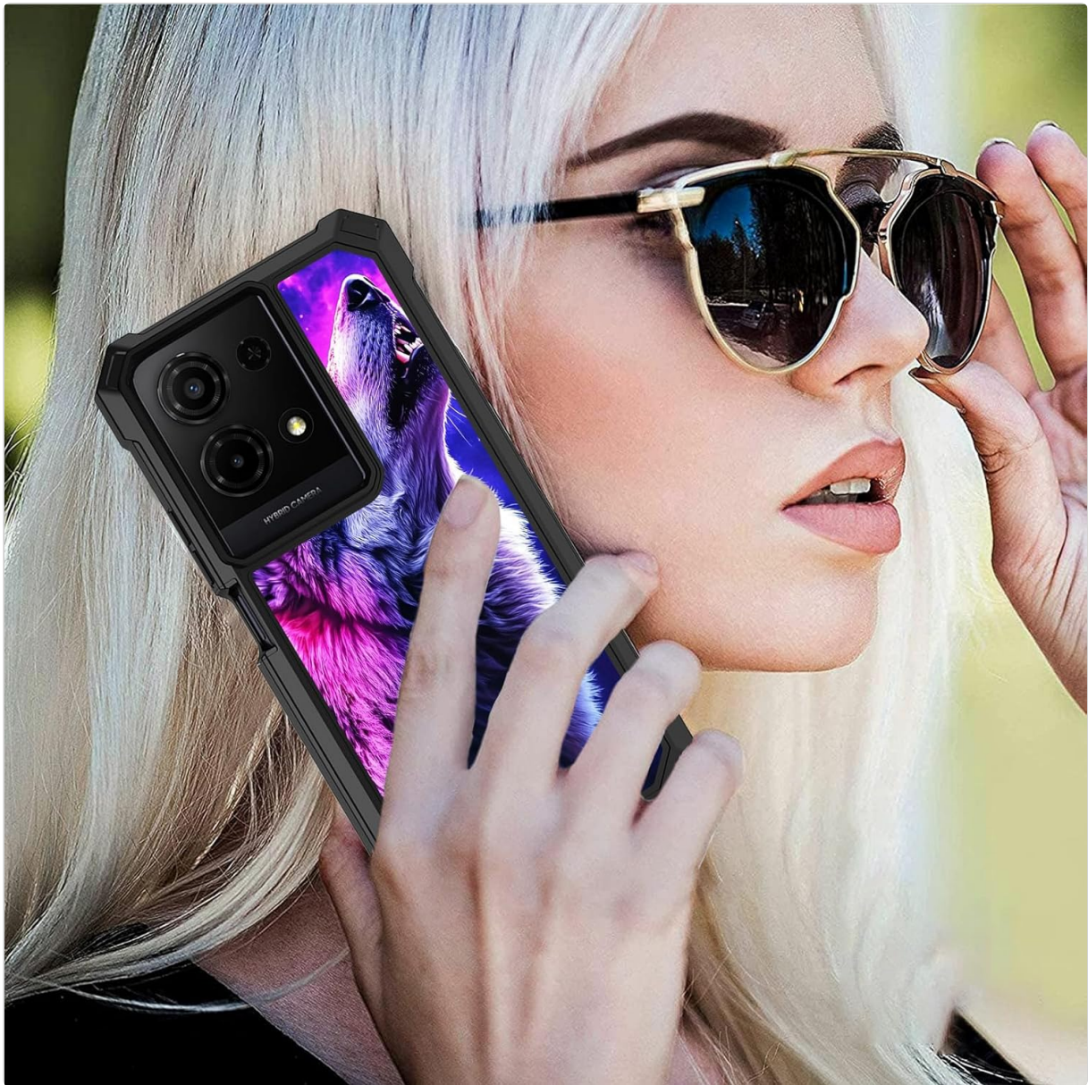
Image 3.2: The phone case supports wireless charging without removal.