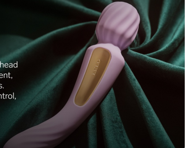
Image: The LELO Switch massager, highlighting its dual-ended design for versatile use. The image describes it as a compact, elegant, and app-enabled device offering a modern upgrade to classic wands.

This dual-ended massager is designed for all-around pleasure, featuring two powerful motors: one for external stimulation and one for internal sensations. The rounded head features soft, textured ribs for enhanced external enjoyment, while the opposite end delivers deep, satisfying vibrations. Compact, elegant, and app-enabled for customizable control, it offers a modern upgrade to the classic wand.