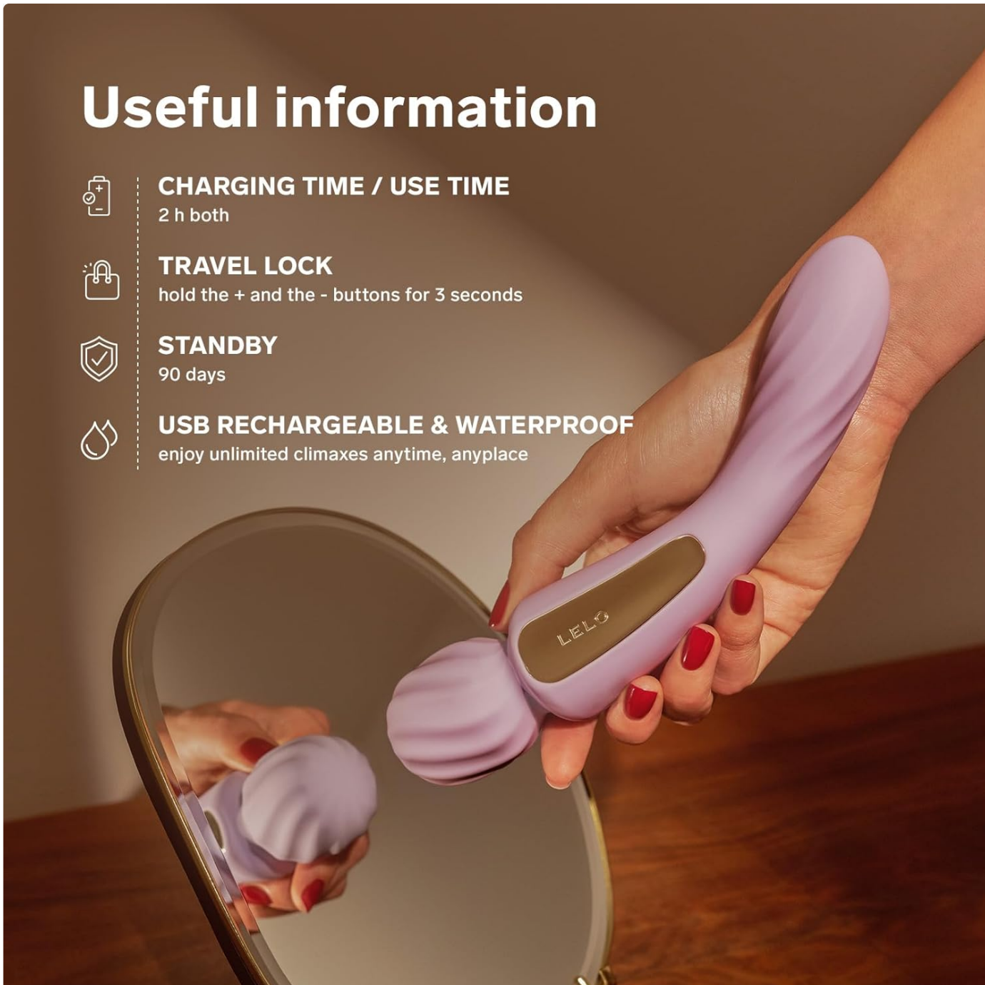
Image: The LELO Switch device accompanied by key information regarding its charging time, usage duration, travel lock function, standby time, and its USB rechargeable, waterproof design.

enjoy unlimited climaxes anytime, anywhere