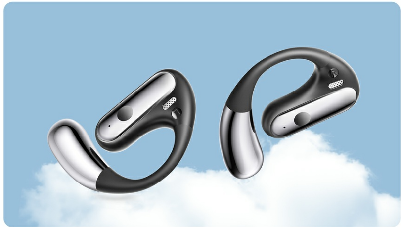
Image: A diagram showcasing the non-intrusive open-ear design with air conduction technology, emphasizing comfort.

Providing a featherlight comfort, these are so weightless that during your daily activities, you'll effortlessly forget you have them on.