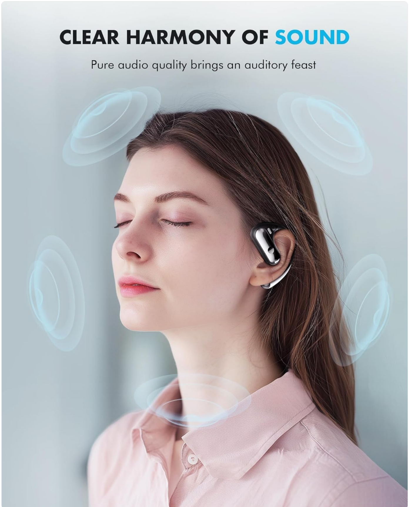
Image: A person wearing the Boytond Q28 Open Ear Earbud, demonstrating the secure and comfortable fit over the ear.

Pure audio quality brings an auditory feast