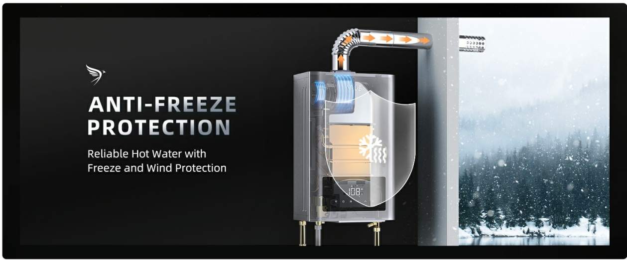
Figure 7: Anti-freeze protection for reliable operation in cold conditions.