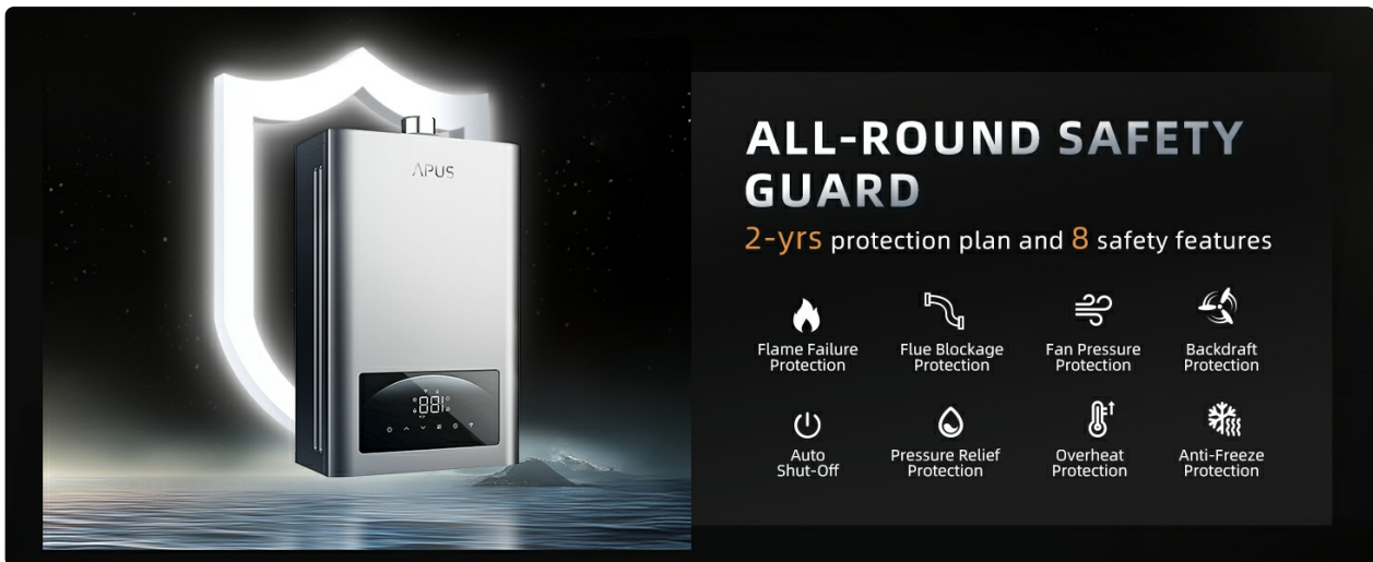
Figure 2: Overview of the 8 advanced safety features integrated into the water heater.