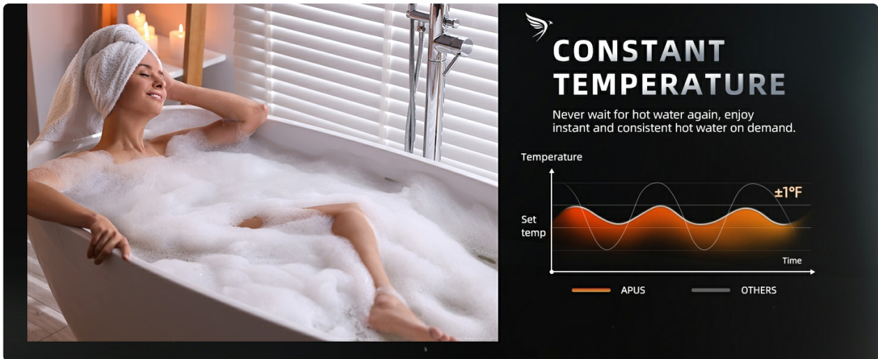
Figure 5: Smart Seasonal Sensing automatically adjusts water temperature for comfort.

Activate Smart Season Comfort Mode for automatic temperature adjustments based on incoming water temperature. This ensures consistent hot water year-round without manual changes.