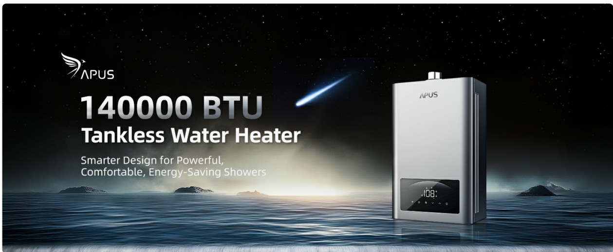
Figure 1: APUS Natural Gas Tankless Water Heater overview, highlighting 140,000 BTU, Natural Gas compatibility, and multi-point supply.

This manual provides essential information for the safe and efficient installation, operation, and maintenance of your APUS Natural Gas Tankless Water Heater. Please read this manual thoroughly before installation and keep it for future reference.