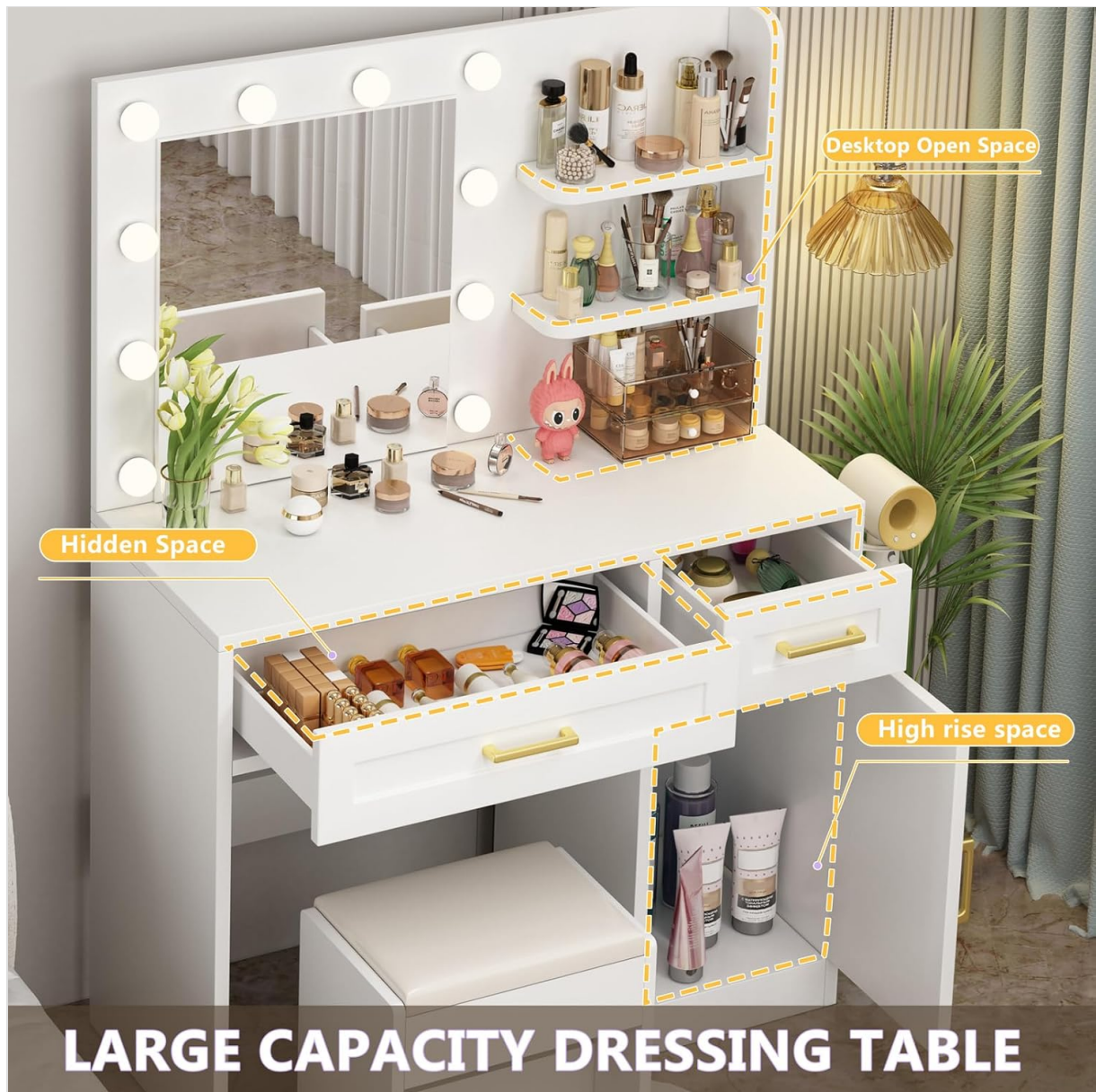
Figure 2: Storage Layout. This image illustrates the various storage areas, including hidden spaces, drawers, and high-rise compartments.