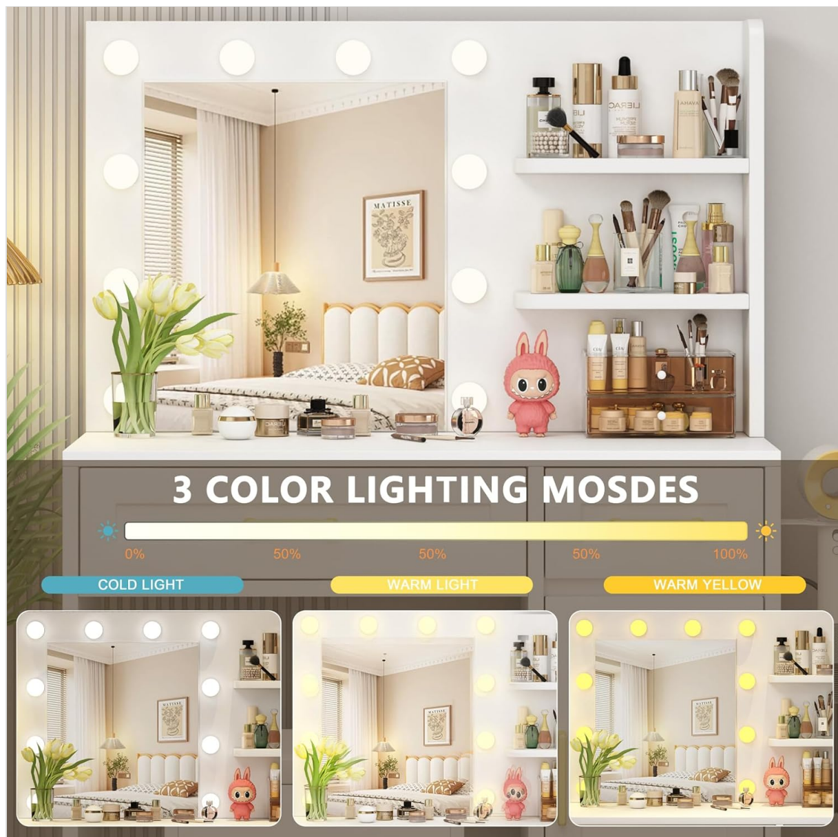
Figure 3: 3 Color Lighting Modes. This image demonstrates the visual difference between the Cold Light, Warm Light, and Warm Yellow settings.