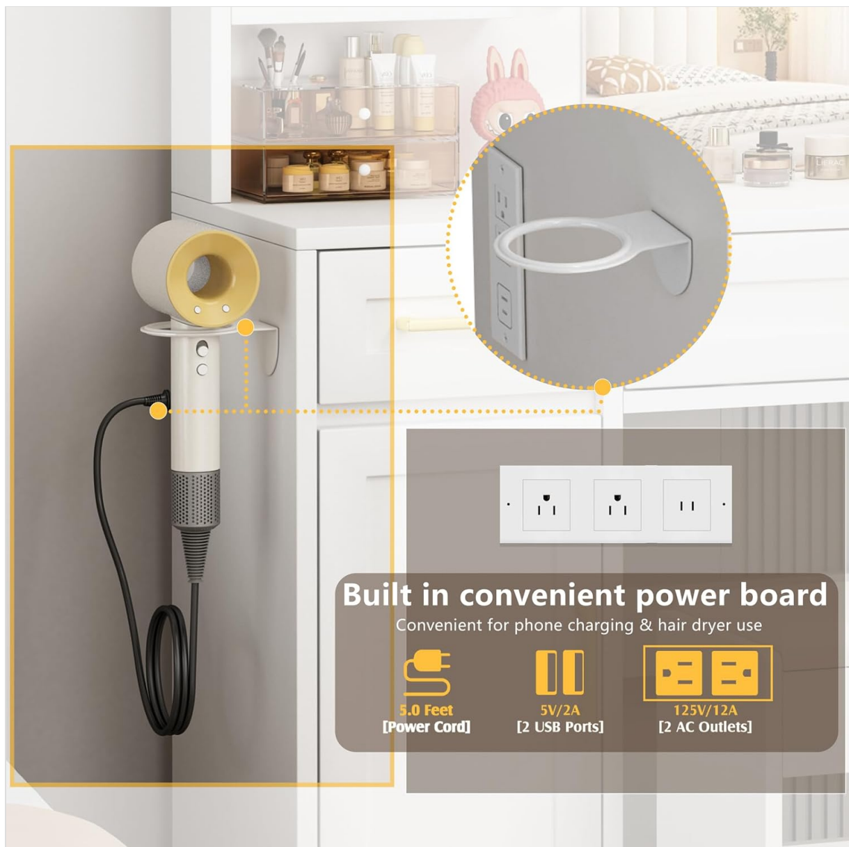
Figure 4: Built-in Power Board. This image highlights the integrated power outlets and USB ports, along with a dedicated holder for a hair dryer.