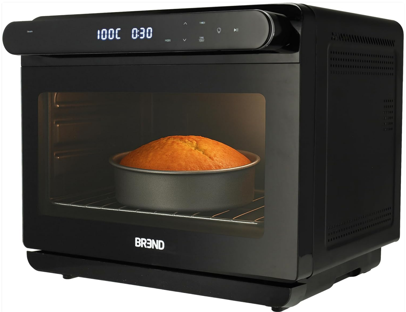
Figure 1.0.1: The BREND BR-2234 XXL Air Fryer and Steam Oven, showcasing its interior capacity with a cake baking on the rack.