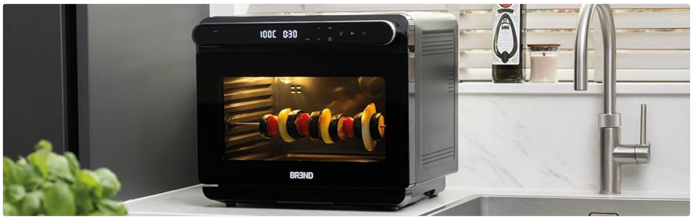
Figure 5.4.1: The BREND BR-2234 oven in operation, with vegetables cooking on the rotisserie spit.