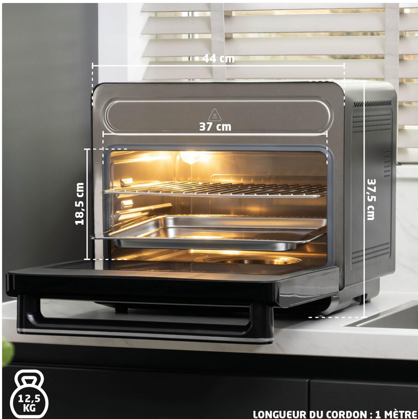
Figure 8.0.1: Visual representation of the oven's dimensions: 44 cm width, 37 cm depth, 37.5 cm height, with an internal height of 18.5 cm. The unit weighs 12.5 kg and has a 1-meter power cord.