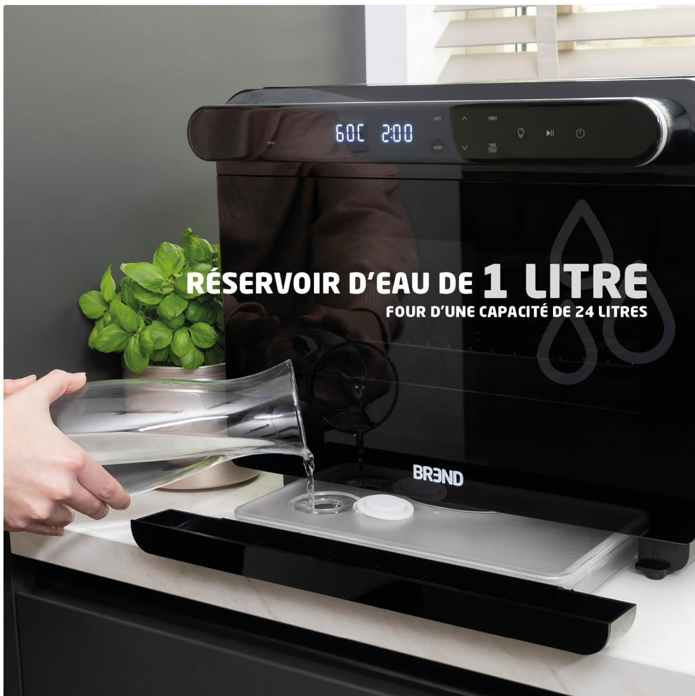
Figure 5.2.1: Demonstrating how to fill the 1-liter water reservoir located at the bottom front of the oven.