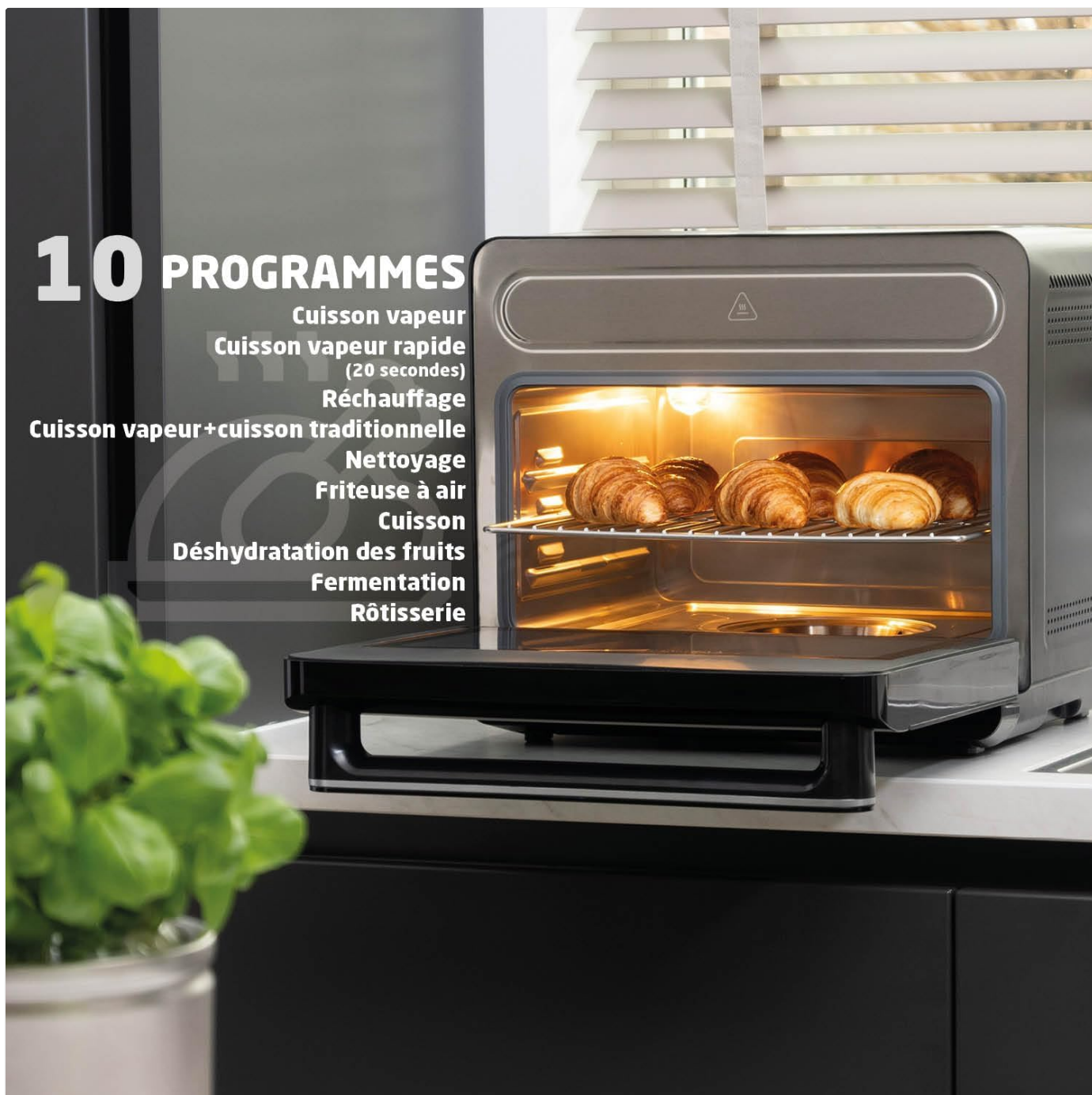
Figure 5.0.1: The oven displaying its 10 cooking programs: Steam Cooking, Quick Steam Cooking (20 seconds), Traditional Cooking, Reheating, Cleaning, Air Frying, Fruit Dehydration, Fermentation, and Rotisserie.