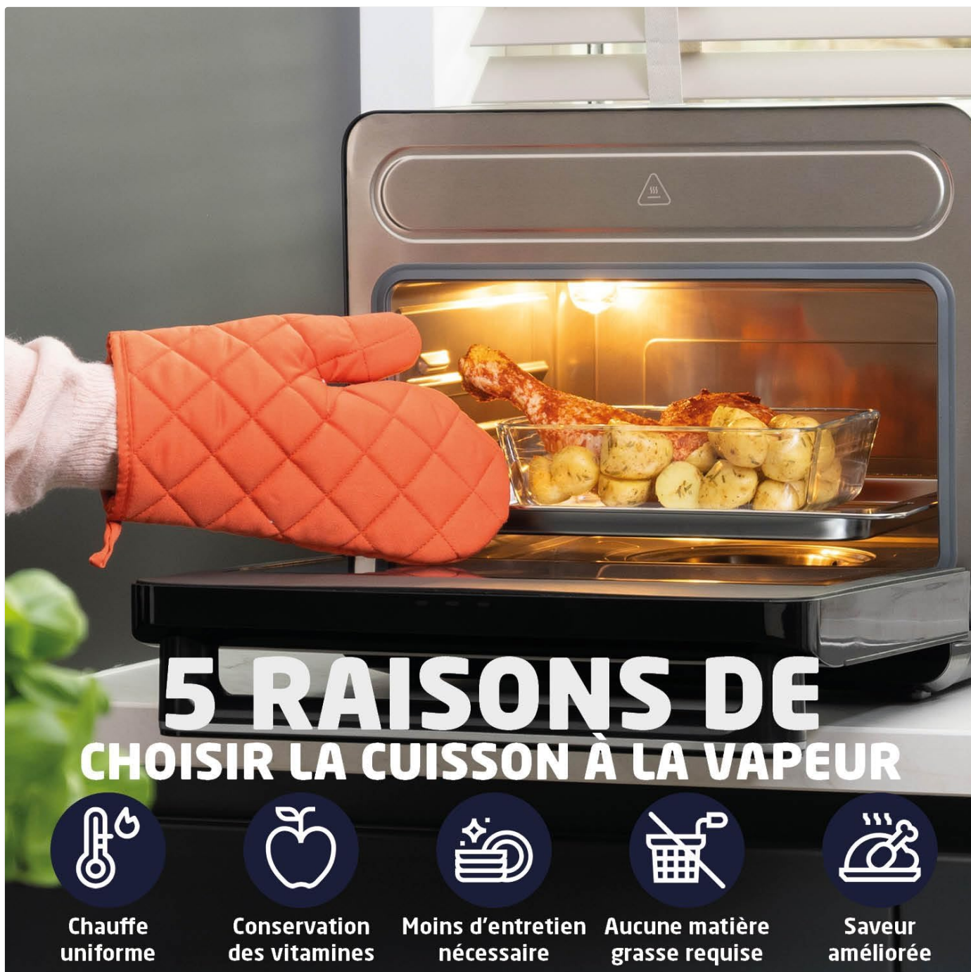
Figure 5.2.2: A hand in an oven mitt removing a dish from the oven, highlighting the five reasons to choose steam cooking: uniform heating, vitamin preservation, less maintenance, no grease required, and improved flavor.