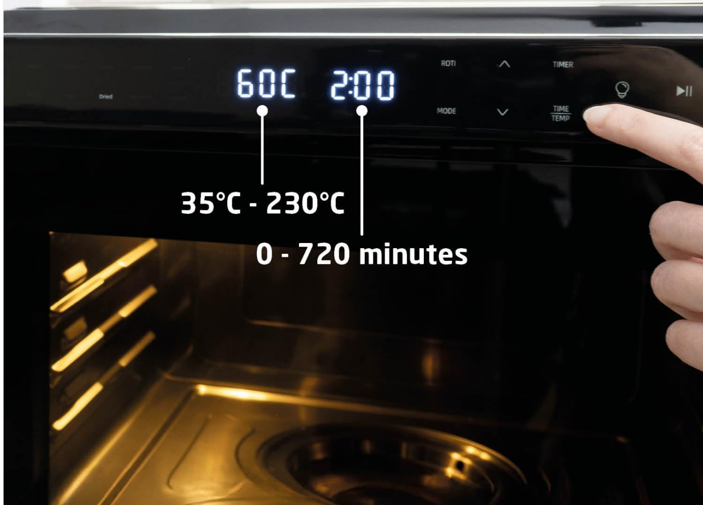
Figure 3.3.1: Detailed view of the touch control panel, showing temperature and time settings. The temperature range is 35°C to 230°C, and the timer can be set from 0 to 720 minutes.