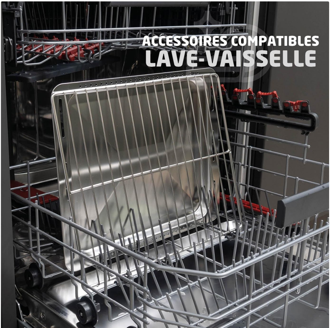
Figure 6.2.1: The wire rack and baking tray placed inside a dishwasher, indicating their compatibility for easy cleaning.