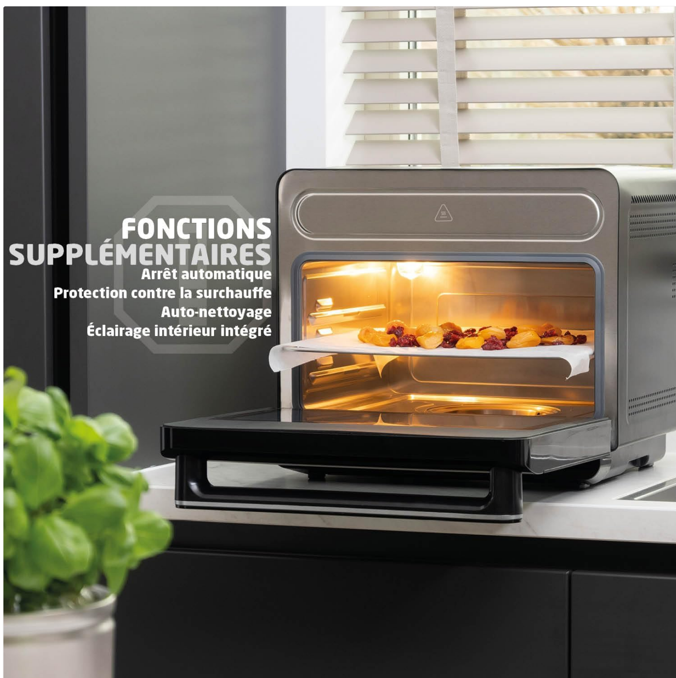
Figure 6.1.1: The oven highlighting additional functions including automatic stop, overheat protection, self-cleaning, and integrated interior lighting.