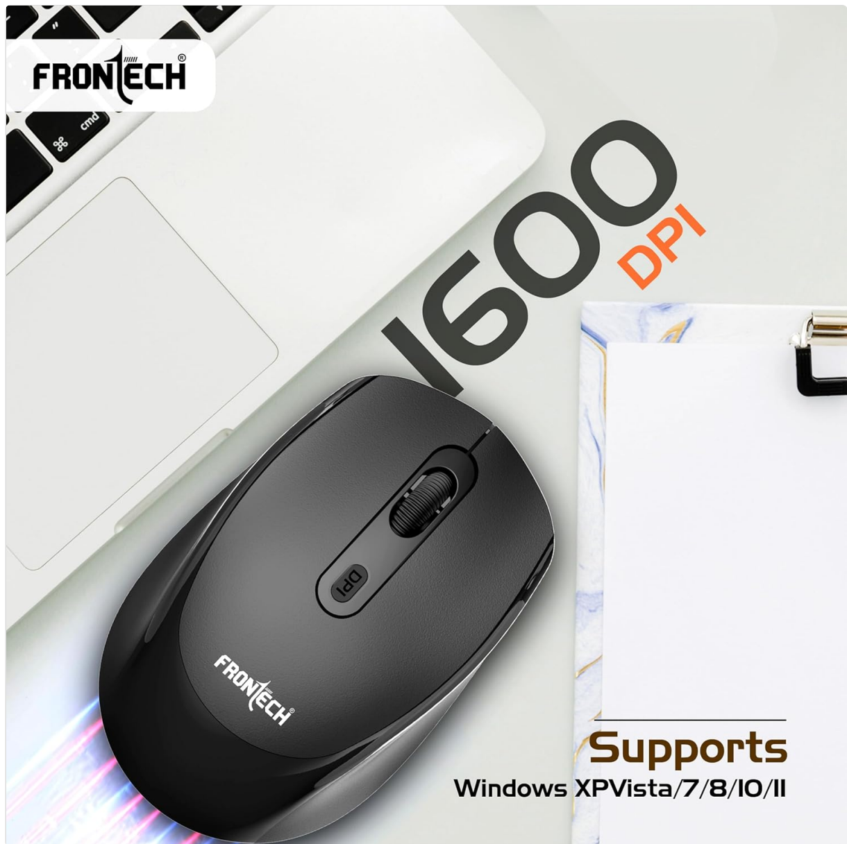
Image: The FRONTECH MS-0074 Wireless Mouse highlighting its 1600 DPI capability and compatibility with various Windows operating systems.