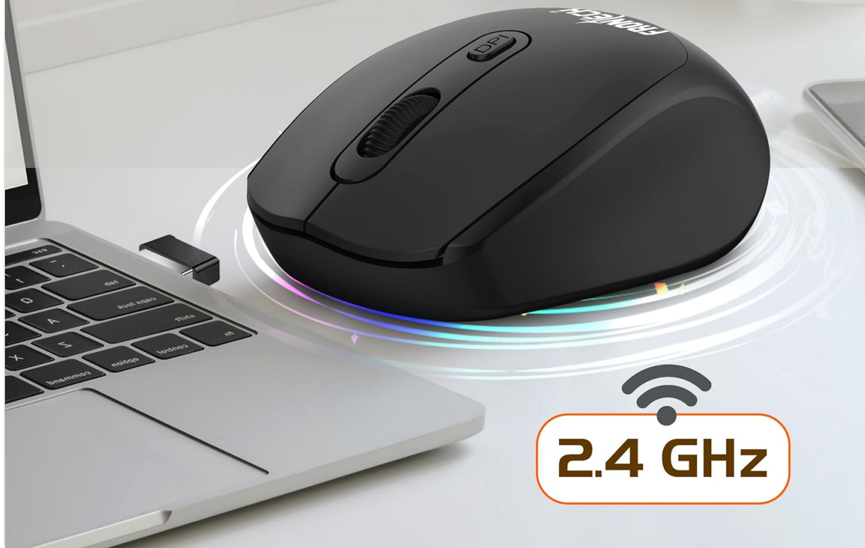
Image: The FRONTECH MS-0074 Wireless Mouse, highlighting its 2.4 GHz wireless technology.