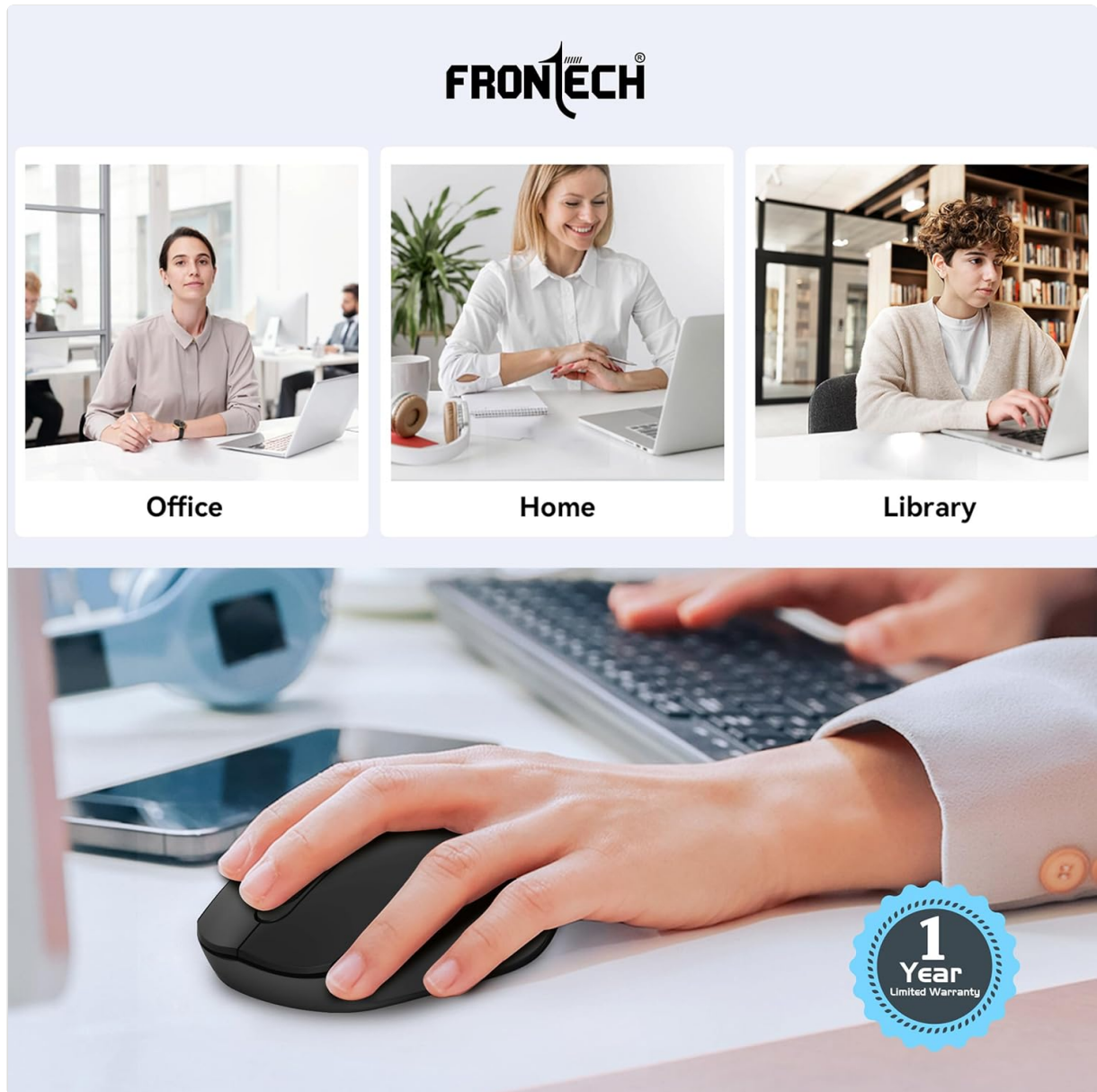
Image: The FRONTECH MS-0074 Wireless Mouse shown in different environments (office, home, library) with a "1 Year Limited Warranty" badge.

The FRONTECH MS-0074 Wireless Mouse comes with a 1 Year Limited Warranty from the date of purchase. This warranty covers manufacturing defects and material faults under normal use. It does not cover damage caused by misuse, accidents, unauthorized modifications, or normal wear and tear. Please retain your proof of purchase for warranty claims.