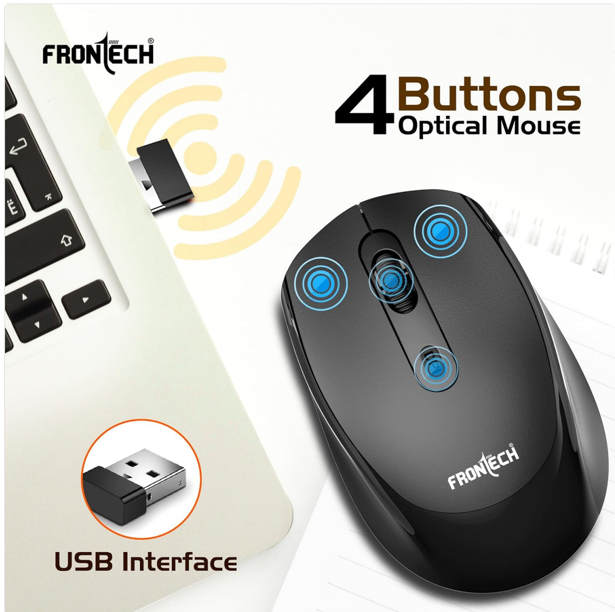
Image: The FRONTECH MS-0074 Wireless Mouse next to its USB receiver, illustrating the wireless connection.