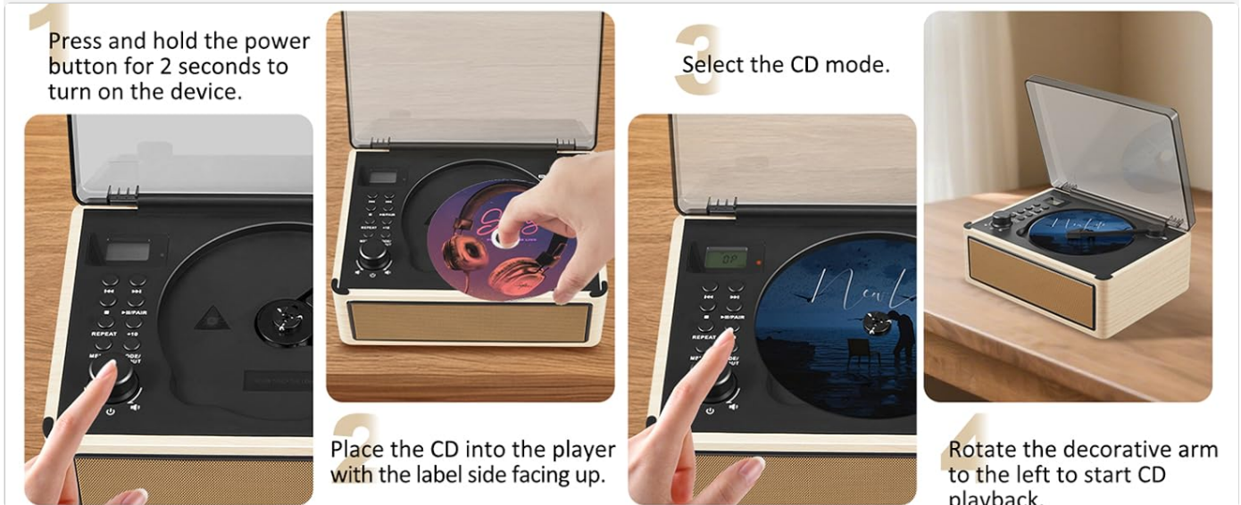
Figure 5: CD Playback Steps

Video 1: Demonstrates how to play a CD on the Gelielim CD player, including powering on, selecting CD mode, inserting a disc, and initiating playback.