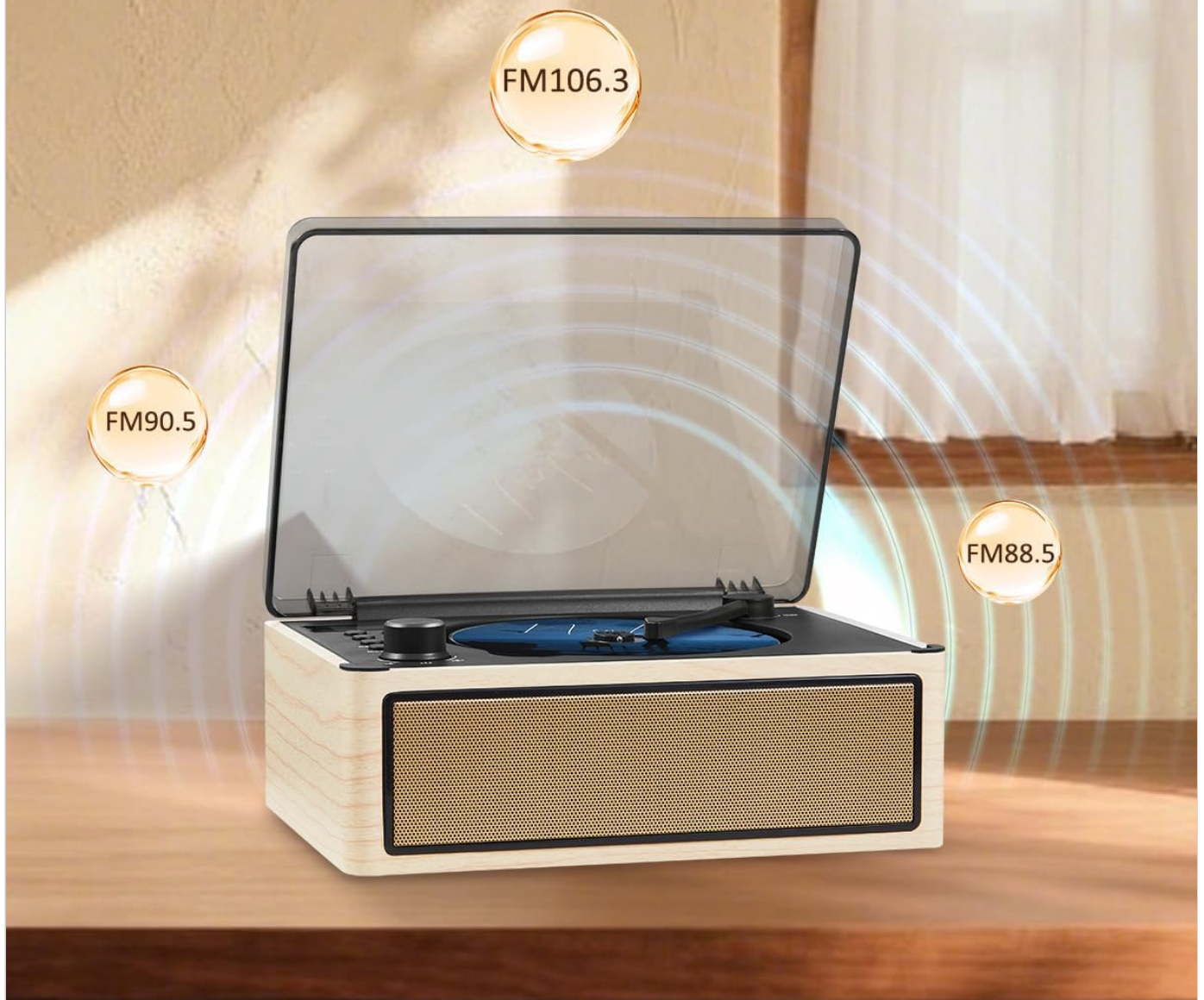
Figure 8: FM Radio Mode