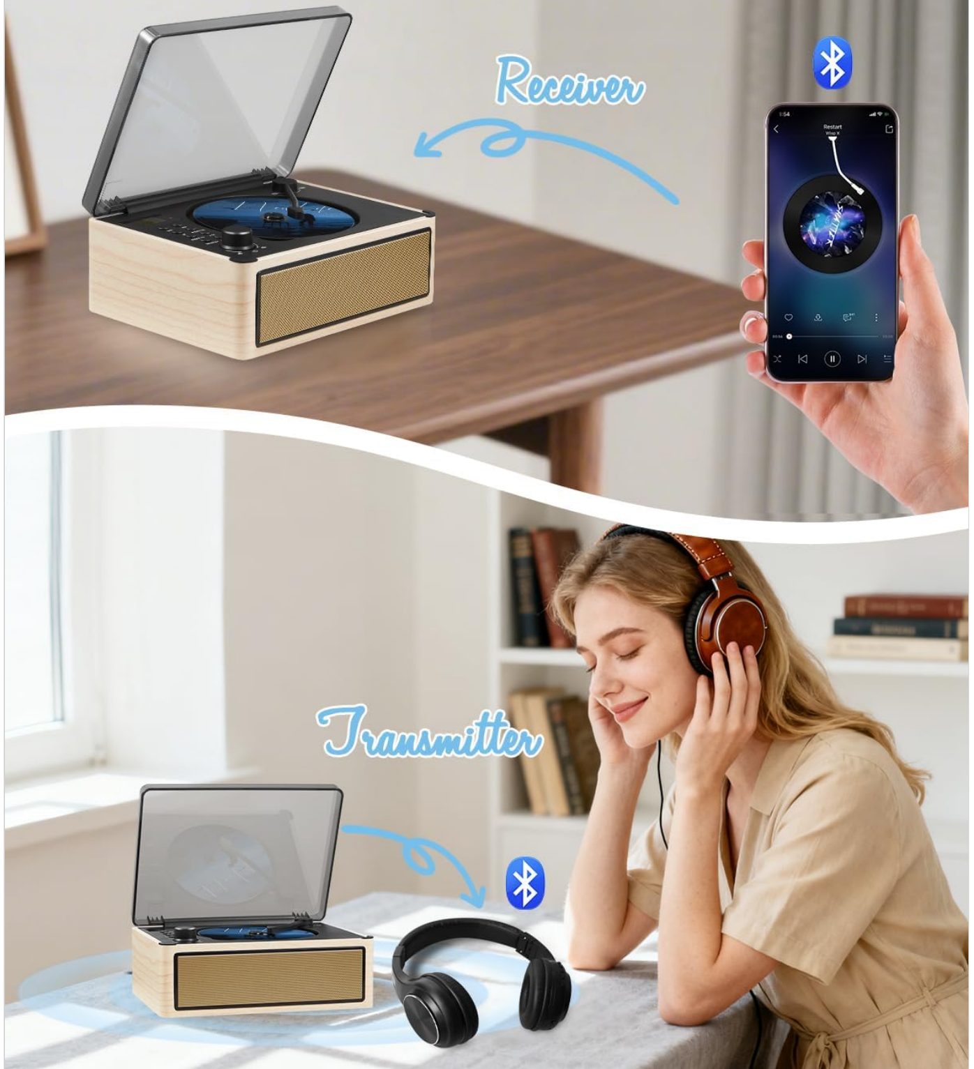
Figure 7: Bluetooth Transmitter Mode