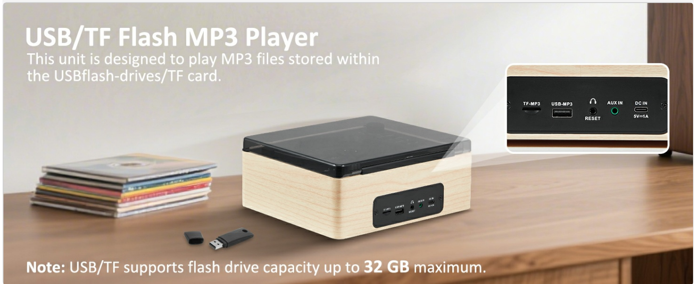
Figure 9: USB/TF Card Playback