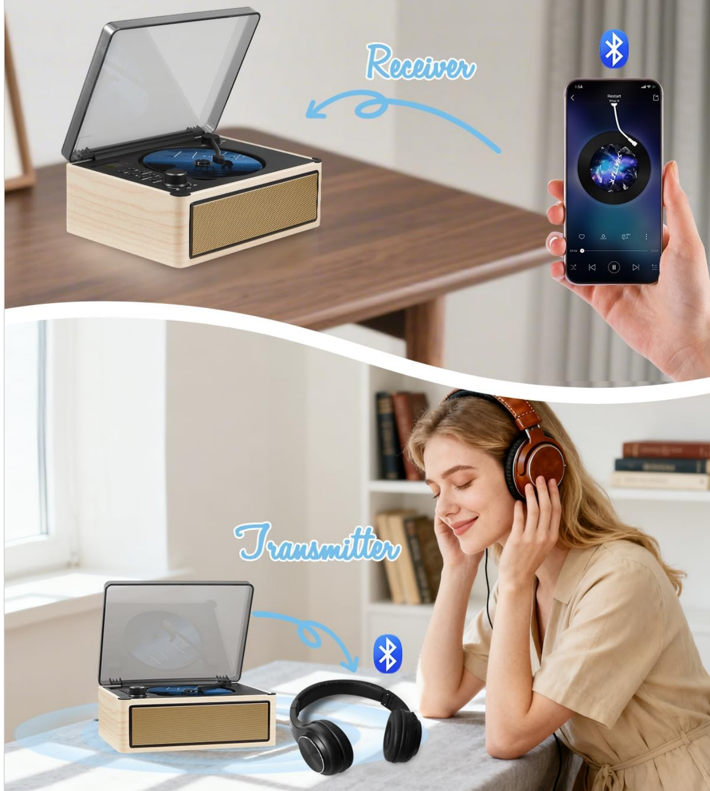
Figure 6: Bluetooth Receiver Mode