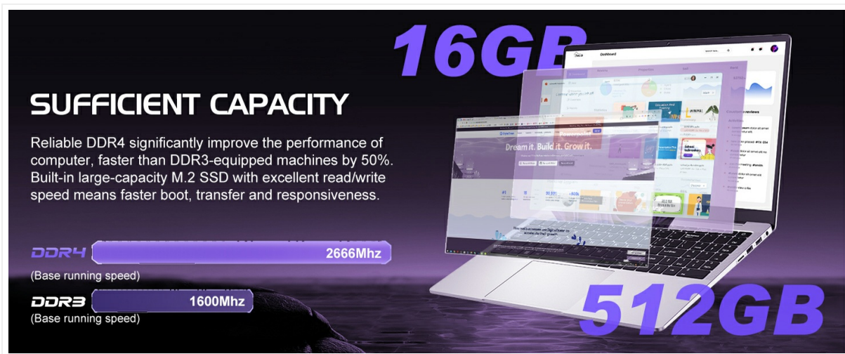
Image 4.2: The laptop's internal components, emphasizing the 16GB DDR4 RAM and 512GB SSD for enhanced performance.

Powered by the Intel 12th Gen Alder Lake Quad-Core processor (up to 3.4GHz), 16GB DDR4 RAM, and a 512GB M.2 SSD, the AX15 delivers efficient performance for multitasking, office tasks, media streaming, and light editing.