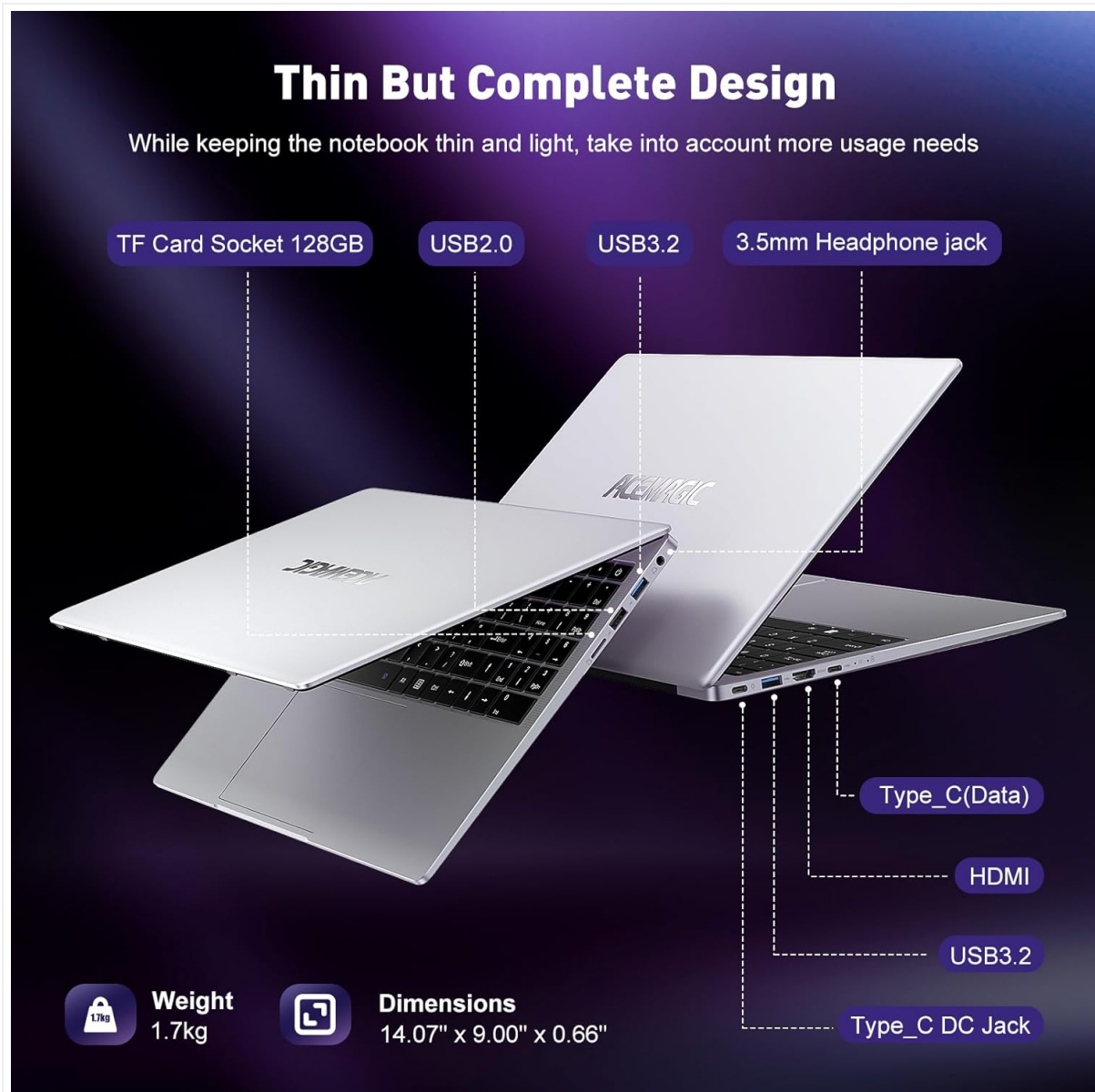
Image 3.2: Detailed view of the ACEMAGIC AX15 Laptop's side ports, including USB, HDMI, and Type-C connections. The ACEMAGIC AX15 is equipped with a versatile array of ports for seamless connectivity: