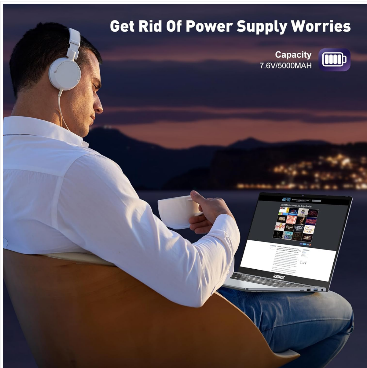
Image 5.3: The ACEMAGIC AX15 Laptop is equipped with a 7.6V/5000mAh battery, providing an average battery life of approximately 5 hours for on-the-go usage.

The laptop is equipped with a 7.6V/5000mAh lithium-ion battery, offering an average battery life of approximately 5 hours, suitable for portable use.