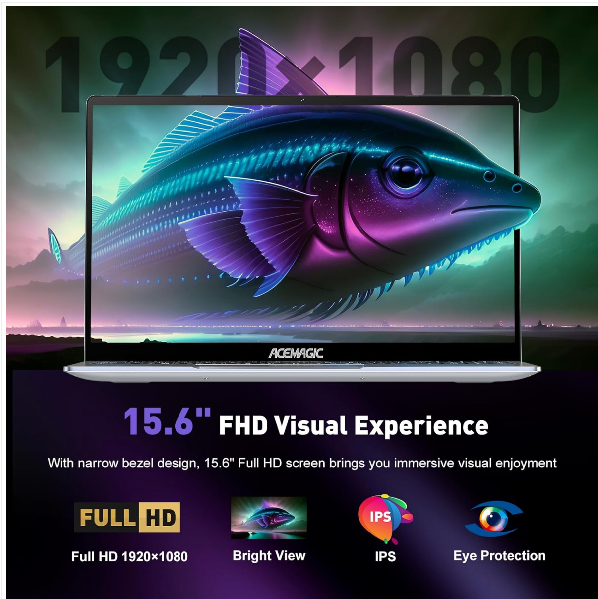
Image 4.1: The 15.6-inch Full HD IPS display of the ACEMAGIC AX15, showcasing its narrow bezel design and immersive visual quality.

The laptop features an immersive 15.6-inch Full HD (1920x1080 pixels) IPS display with a narrow bezel design, providing more usable screen space and eye protection. The built-in front webcam is centered above the screen for convenient video calls and photos.