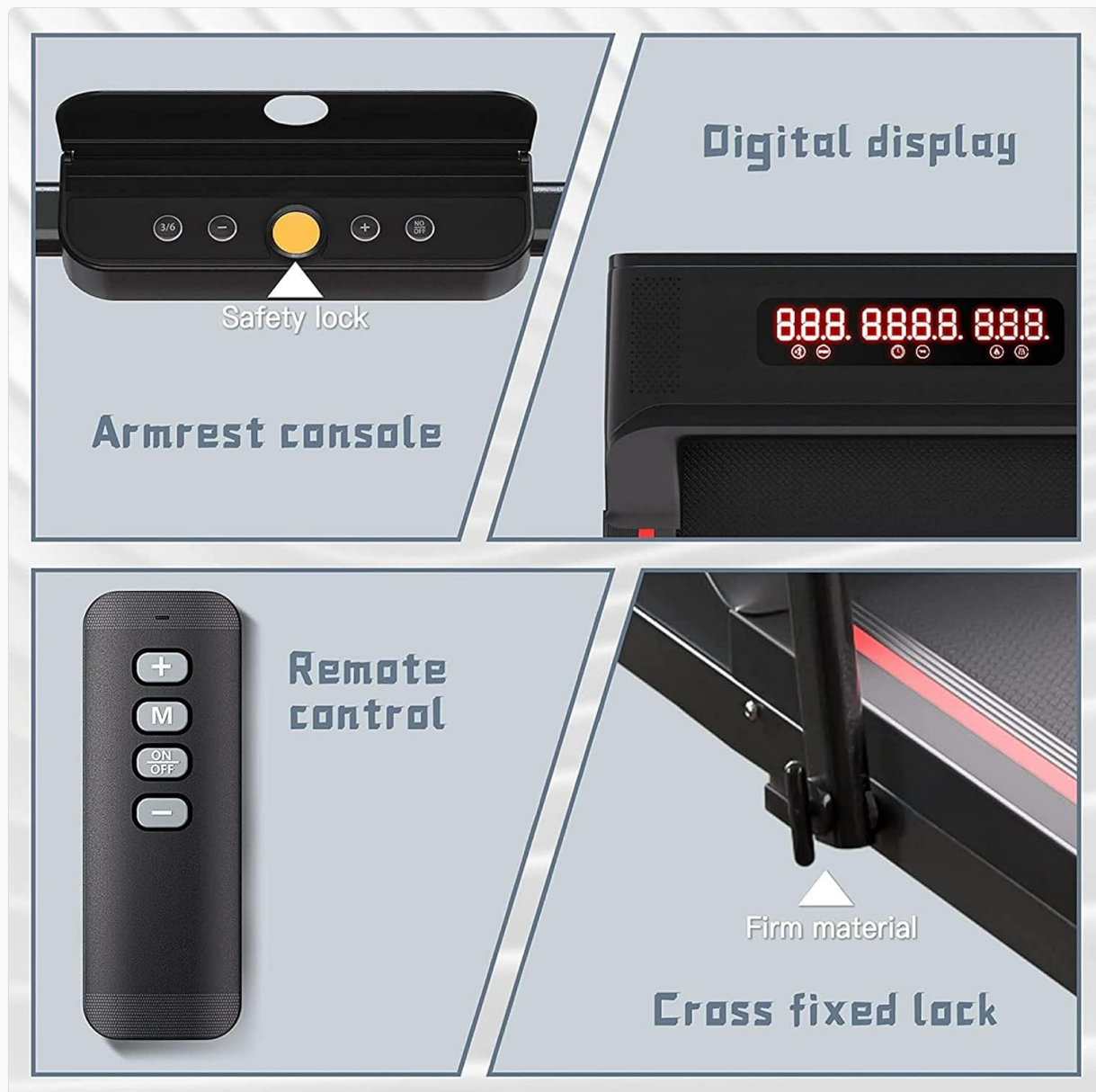
Figure 3: Detailed view of the LED display, console controls, and remote control.

Before starting, ensure the safety key is properly attached to the console and clipped to your clothing. This will immediately stop the treadmill if you lose balance or fall.