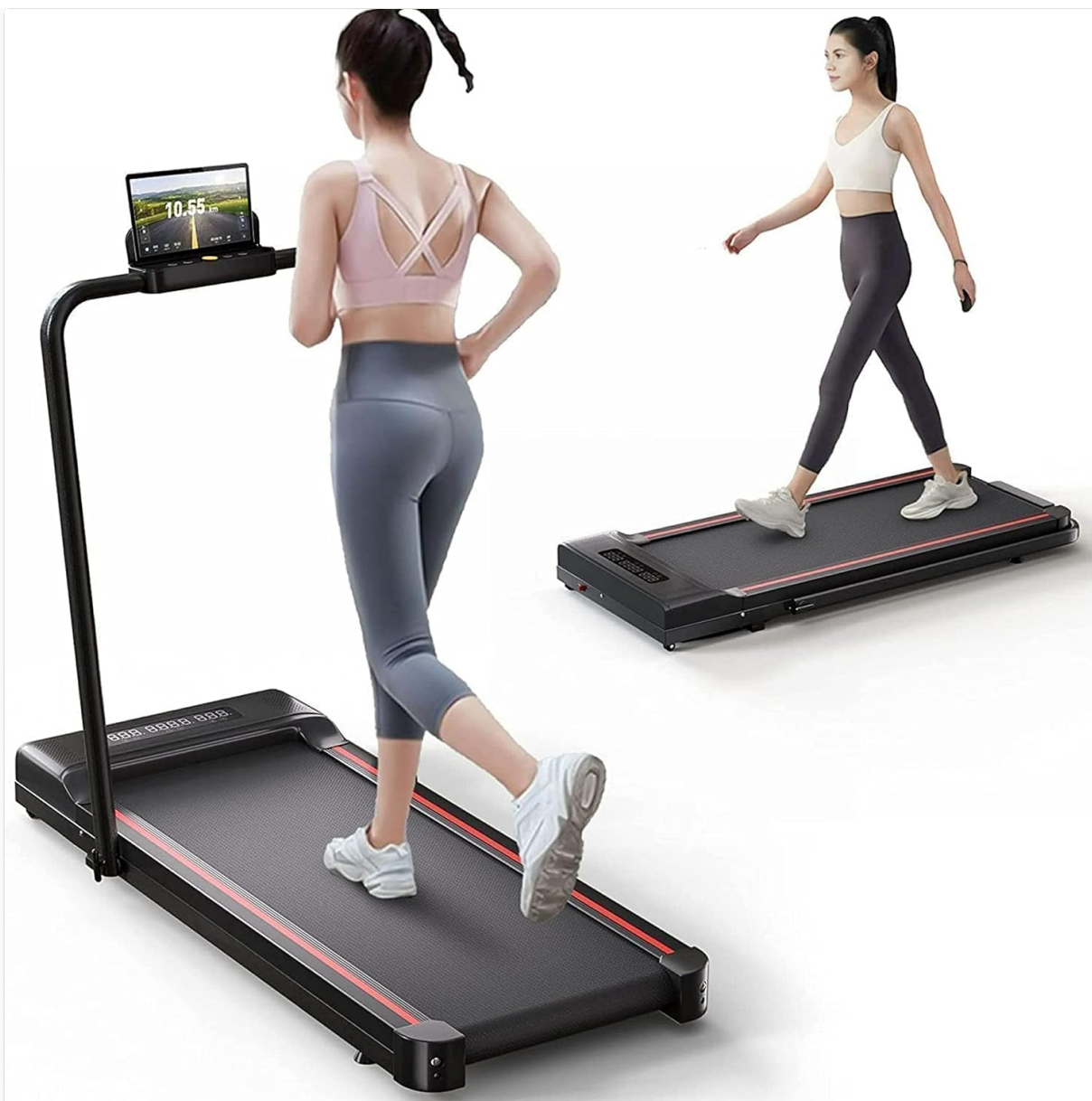
Figure 1: Sperax Walking Pad Treadmill in both upright and flat modes.