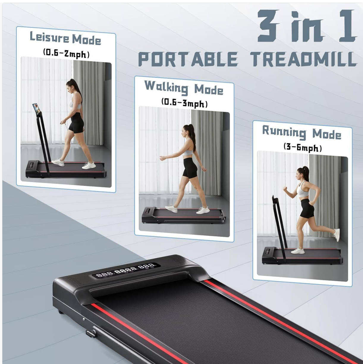
Figure 4: Visual representation of the treadmill's 3-in-1 functionality for different exercise intensities.