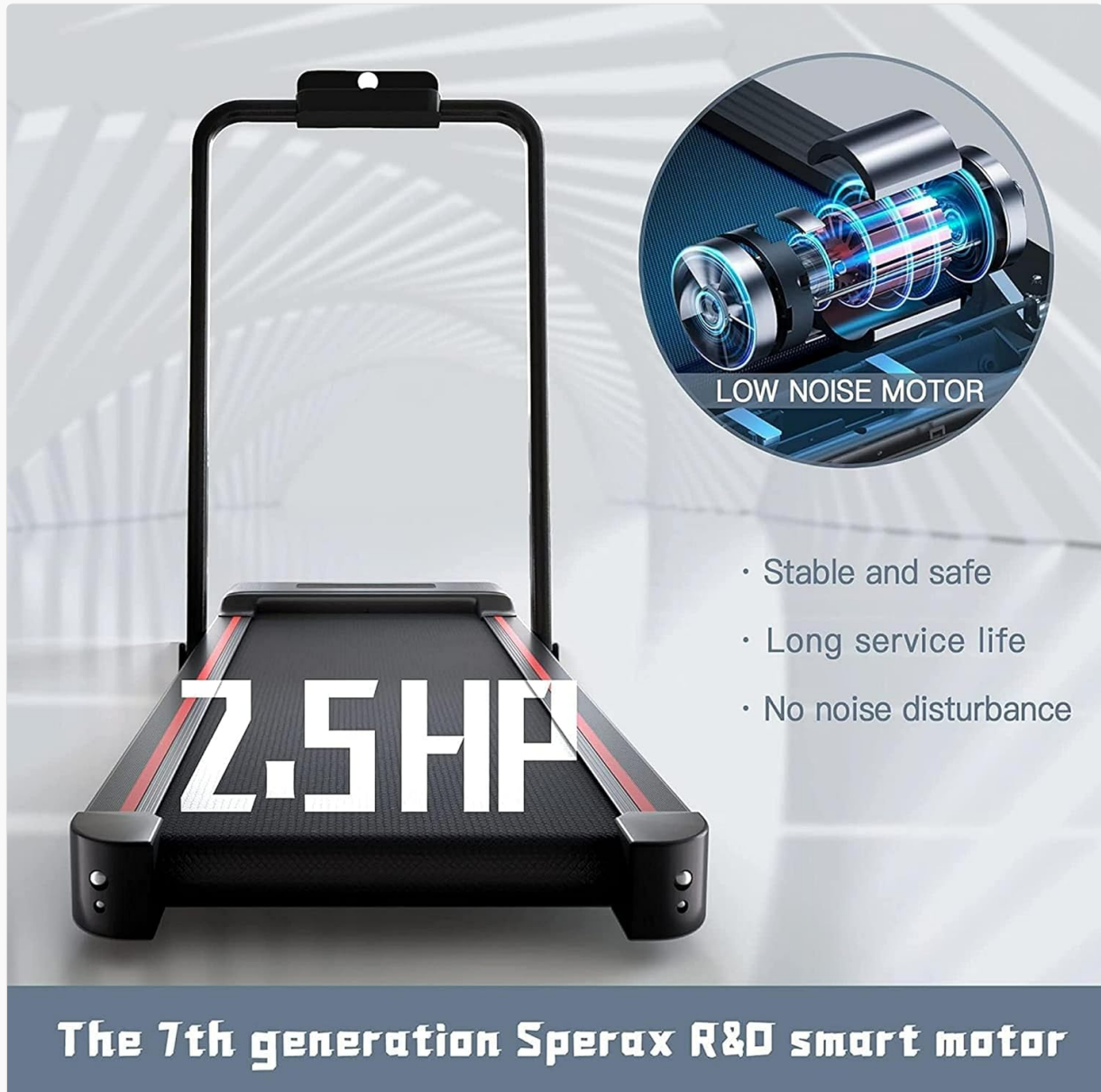
Figure 2: The treadmill's low noise motor, highlighting its stable and safe design.