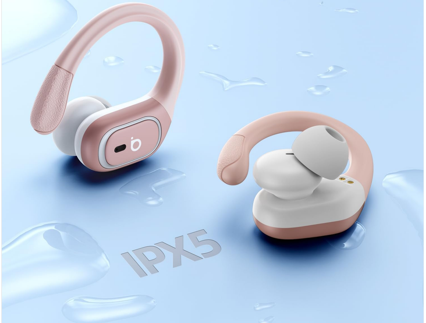
Image: Basike FON240 earbuds with water droplets, demonstrating their IPX5 water resistance against sweat and light rain.

Resiste ao suor e à chuva leve — ideal para treinos ao ar livre