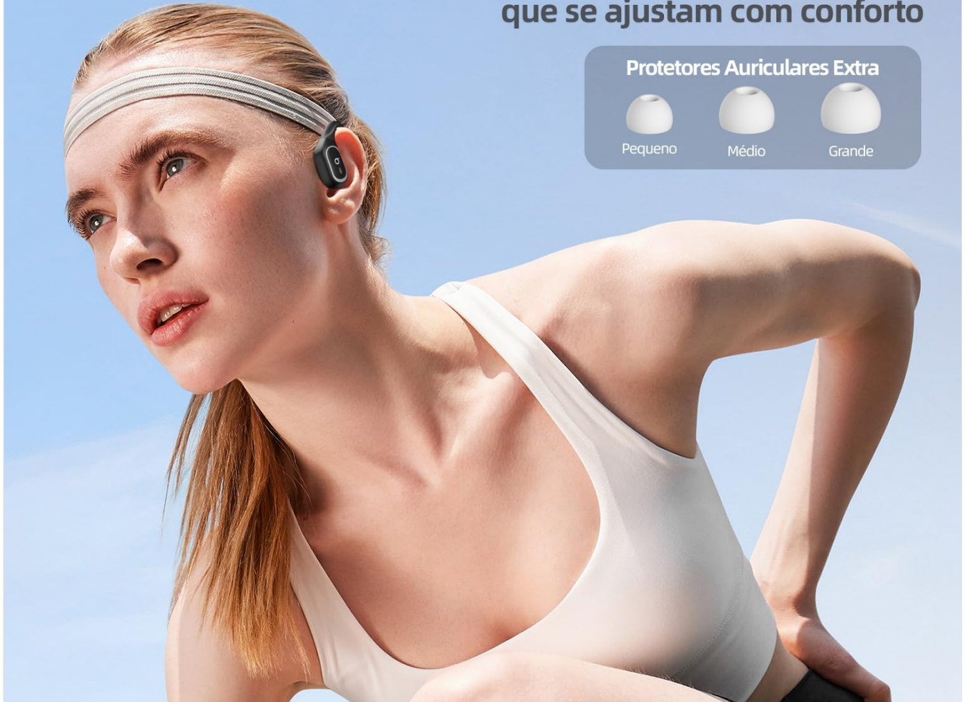
Image: A woman wearing Basike FON240 earbuds, illustrating the ergonomic and comfortable sport design with flexible ear hooks and adjustable tips.