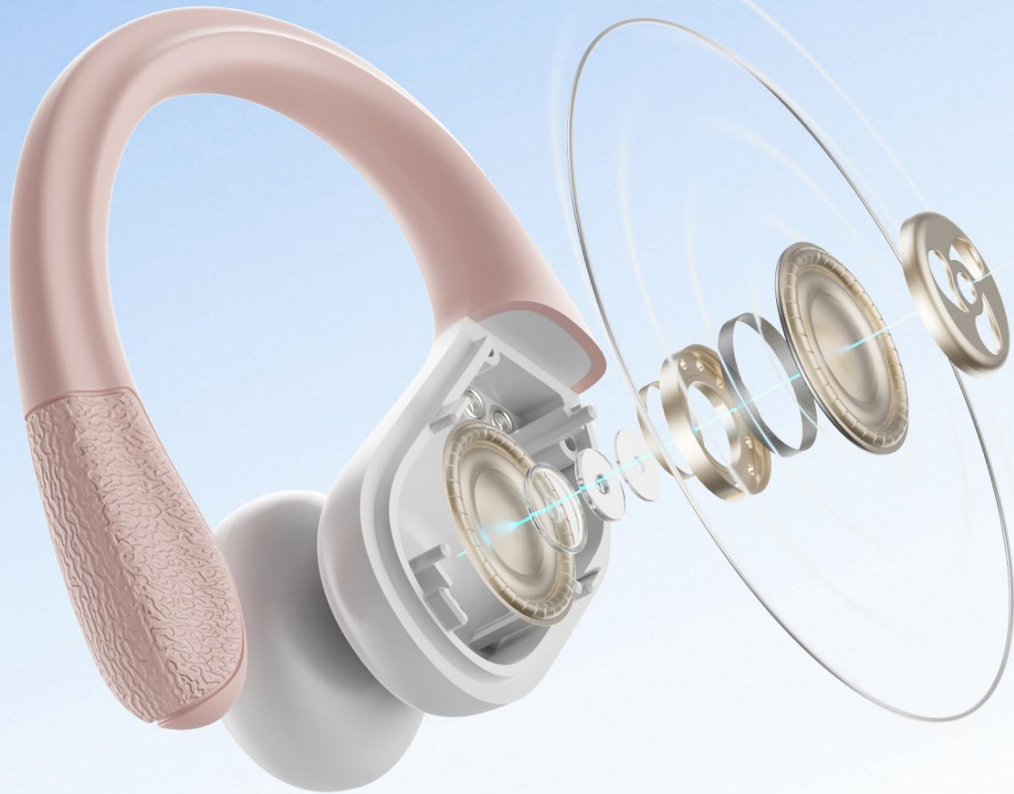
Image: Exploded view of Basike FON240 earbud showing 10mm dual diaphragm for Hi-Fi Stereo Sound.

10mm duplo diafragma entrega graves profundos e agudos nítidos