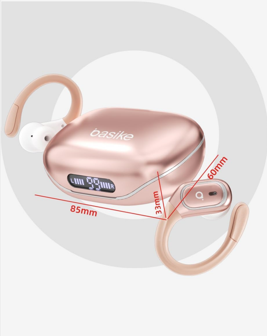
Image: Basike FON240 earbuds and charging case with key dimensions and a visual representation of included accessories like the charging cable and user manual.