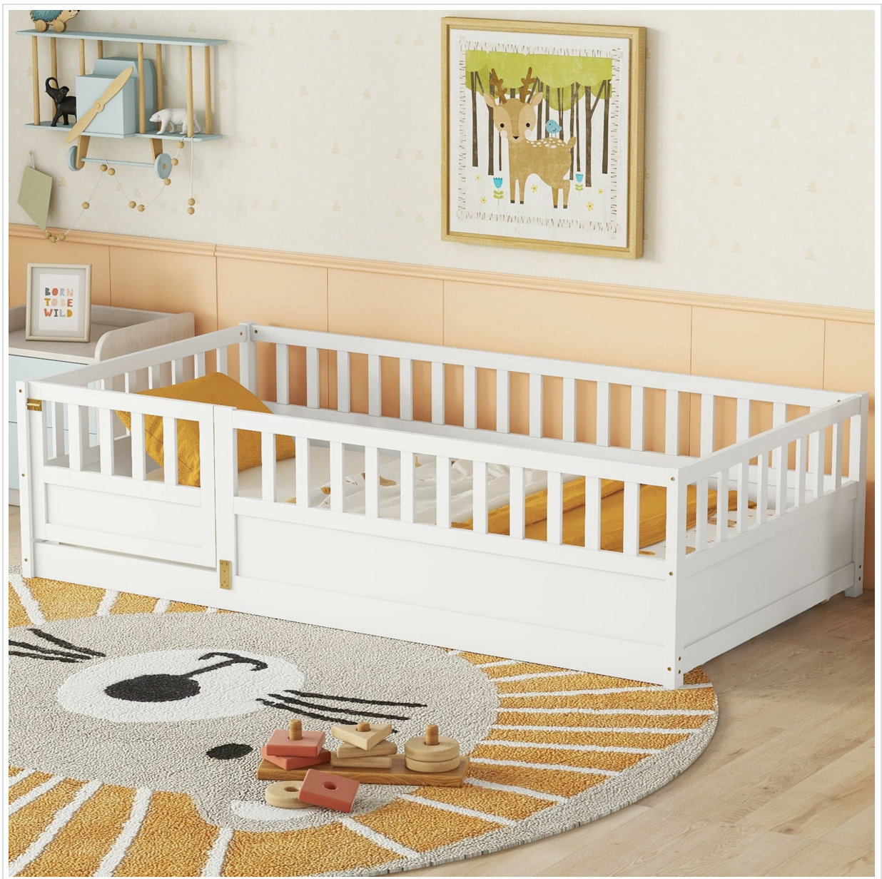
Image: The Bellemave Twin Floor Bed with High Fence in white, showcasing its full structure and design.