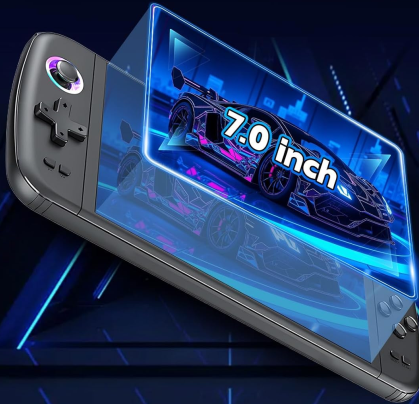
Image: An image emphasizing the console's 7-inch HD color screen with 600x1024 pixel resolution.