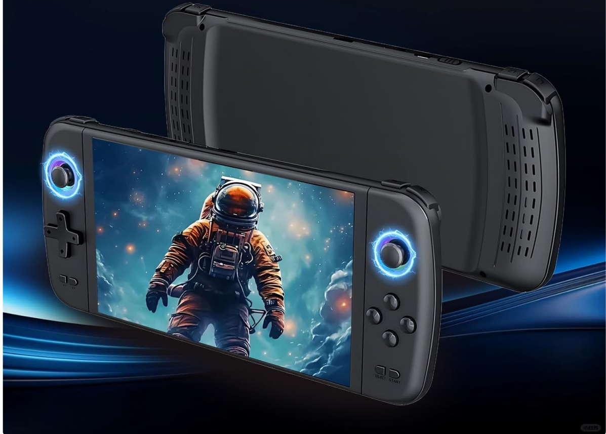
Image: An illustration of the console's 3000mAh battery capacity and charging specifications (5V 2A input).

special game rocker for arcade, high sensitivity and antiskid design