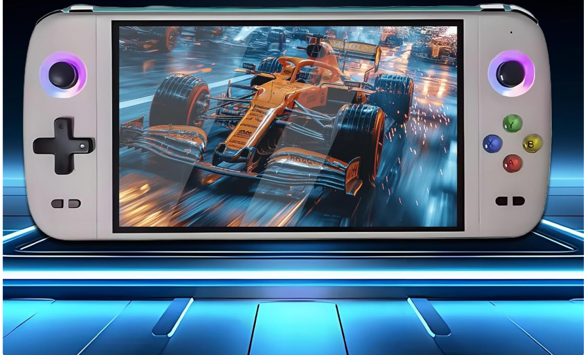
Image: The M27 console showcasing its 16 million color RGB racing rainbow light rings around the joysticks.

RGB horse racing rainbow light effect follows the changing decibel level of the playing sound, jumping rhythm