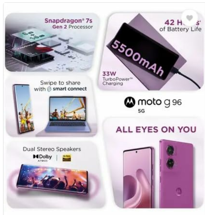
Image: A collage illustrating key features of the Motorola G96 5G, including the Snapdragon 7s Gen 2 processor, 5500mAh battery with 33W TurboPower charging, smart connect functionality, and dual stereo speakers with Dolby Atmos.

Powered by the Snapdragon 7s Gen 2 processor, the G96 5G offers efficient performance. The 5500mAh battery supports 33W TurboPower charging for quick recharges.