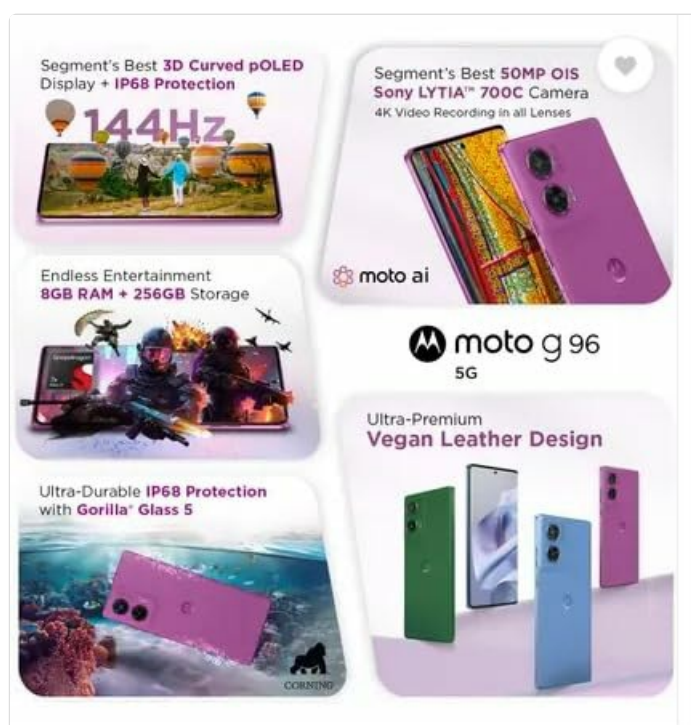
Image: A composite image highlighting the Motorola G96 5G's 144Hz 3D Curved pOLED Display, advanced 50MP OIS camera, 8GB RAM