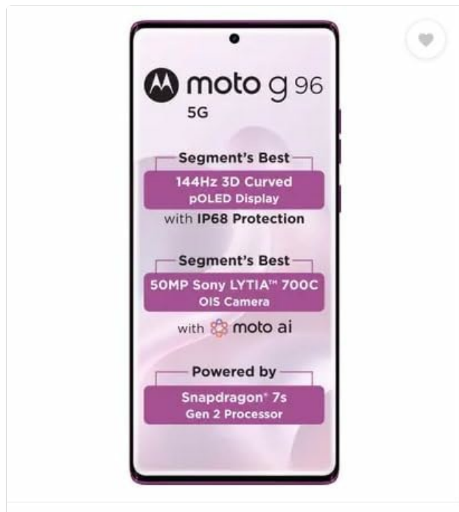
Image: Front view of the Motorola G96 5G, illustrating the display and its curved edges, relevant for initial setup and interaction.