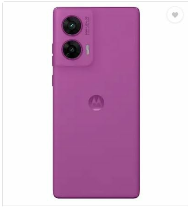
Image: Rear view of the Motorola G96 5G, highlighting the dual camera module and the Motorola logo, illustrating the camera system.