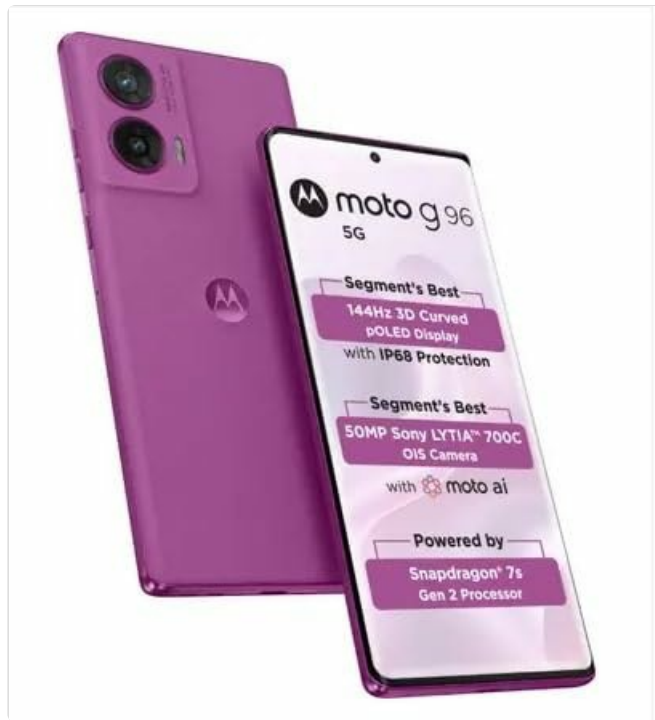
Image: The Motorola G96 5G smartphone, showcasing its front and back, alongside the included 33W charger, USB cable, and SIM ejector tool.