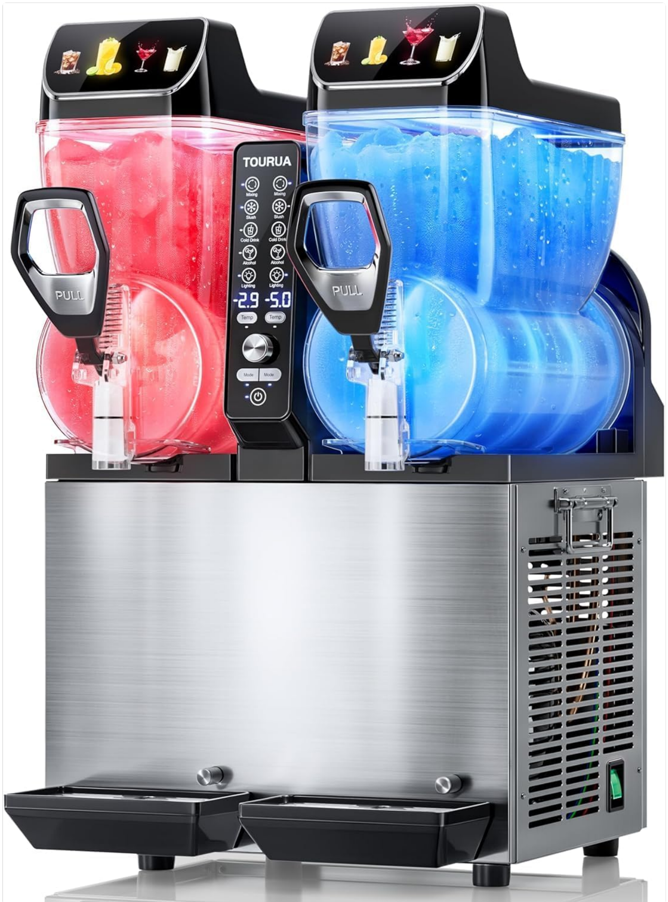
Figure 1: TOURUA Commercial Grade Slush Machine XR-300. This image displays the dual-tank slush machine, highlighting its design and capacity.