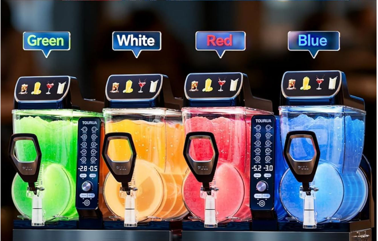
Figure 8: 4-Color LED Light Illumination. The LED lid lights enhance the visual appeal of the frozen beverages.