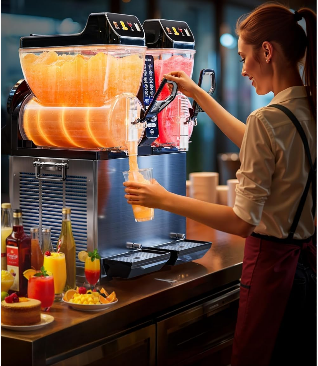
Figure 7: Large Handle and Drip-Free Valve. This image demonstrates the ease of dispensing drinks with the ergonomic handle.

Extra-comfort handle with no-mess pour spout