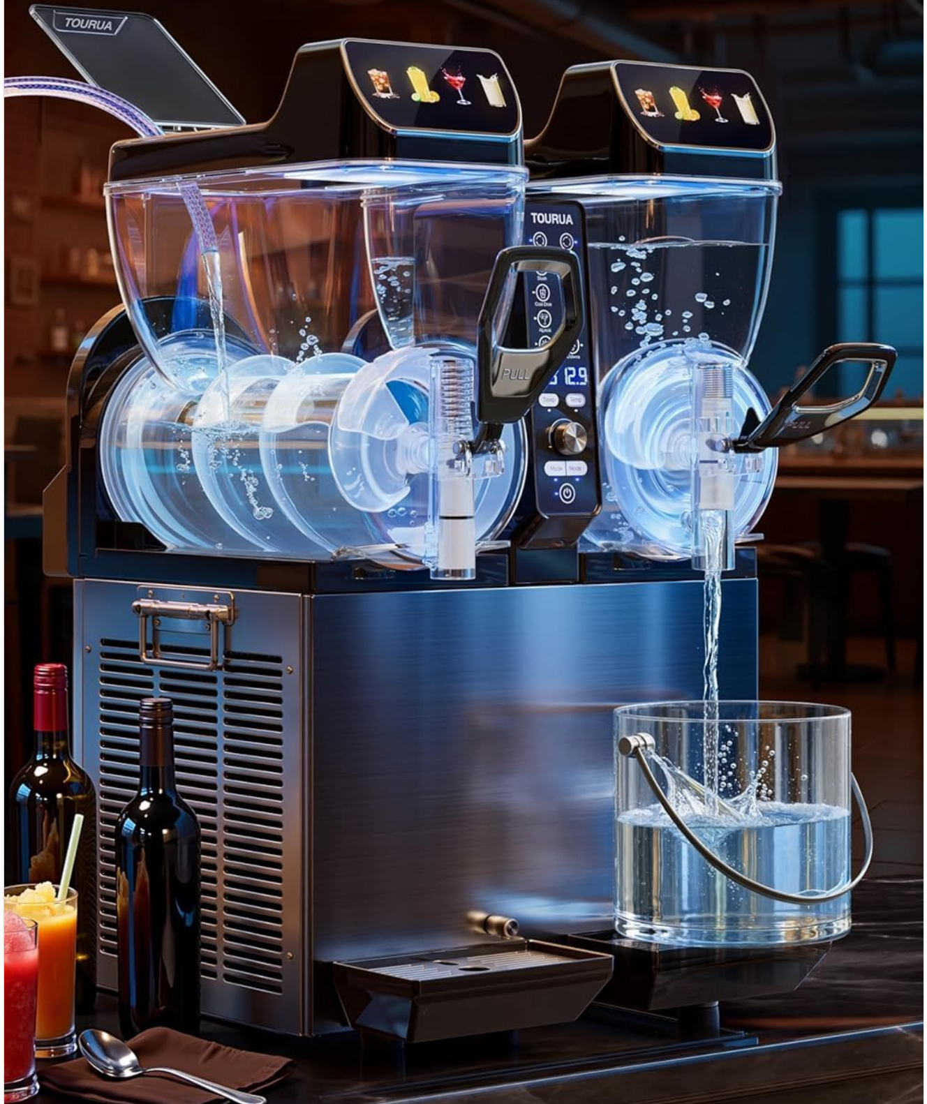
Figure 9: One-Touch Cleaning. This feature simplifies the daily cleaning process for the tanks and internal components.