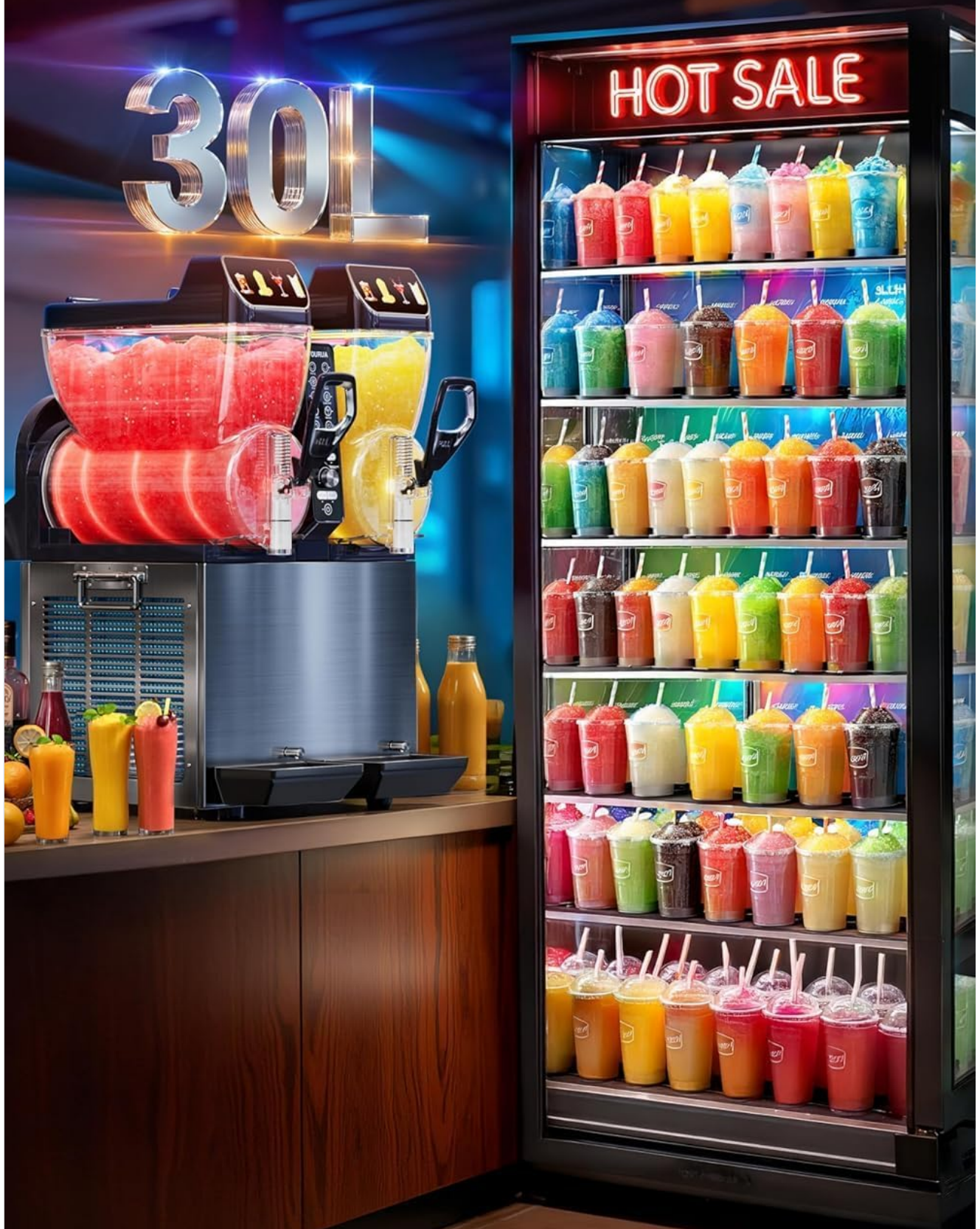
Figure 2: Compact size and placement. The machine's dimensions (32"x19"x18.9") allow for placement on most commercial countertops.

Create 84+ cups of two flavors frozen drinks