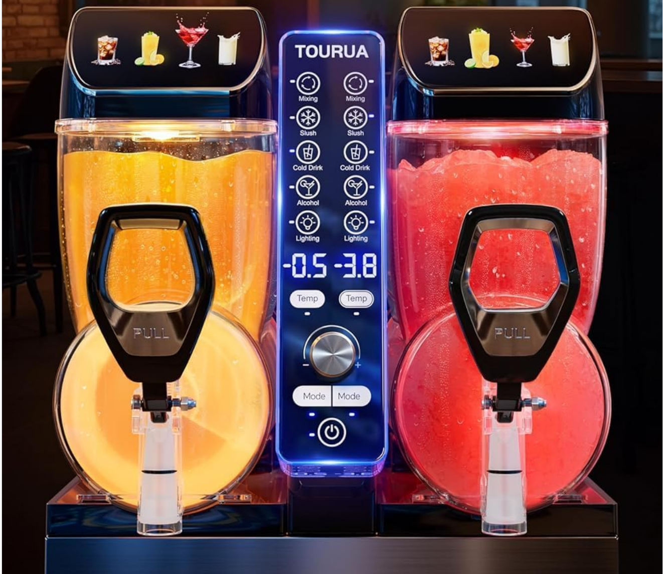
Figure 4: Control Panel. This image shows the digital display and buttons for mode selection and temperature control.