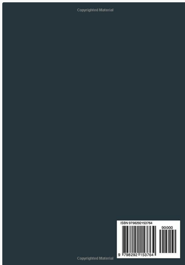
Image 6.1: Back cover of the user manual, displaying the ISBN barcode for identification.