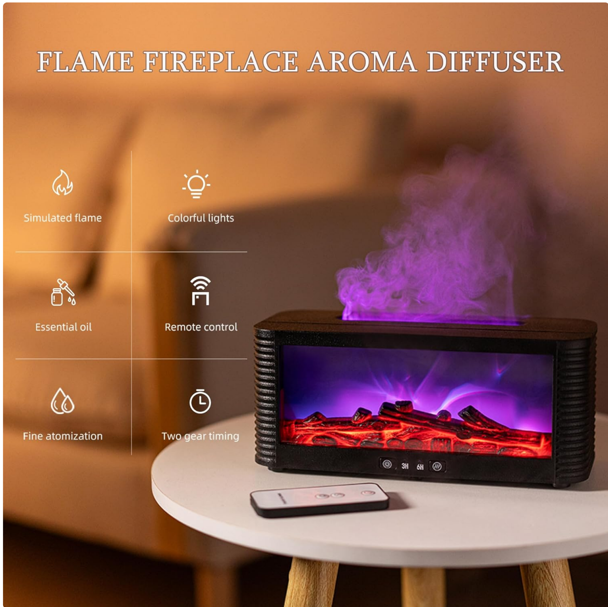
Image Description: The LOVCY Fireplace Aroma Diffuser showcasing its simulated flame effect and cool mist output, creating a relaxing ambiance.