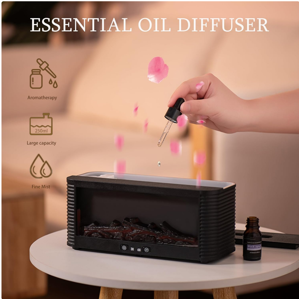
Image Description: A hand uses a dropper to add essential oil into the water-filled tank of the diffuser, ready for aromatherapy.