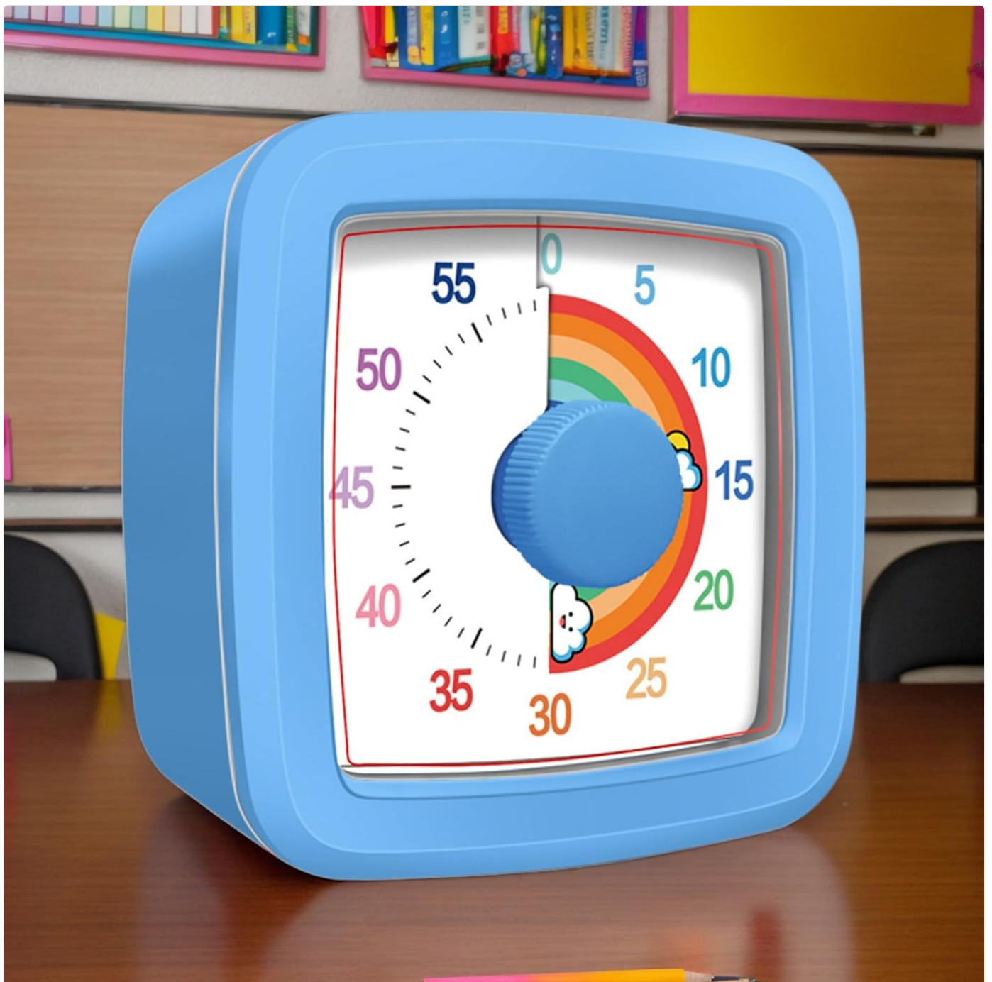
Figure 2: The visual timer in use, demonstrating the red disk indicating remaining time.