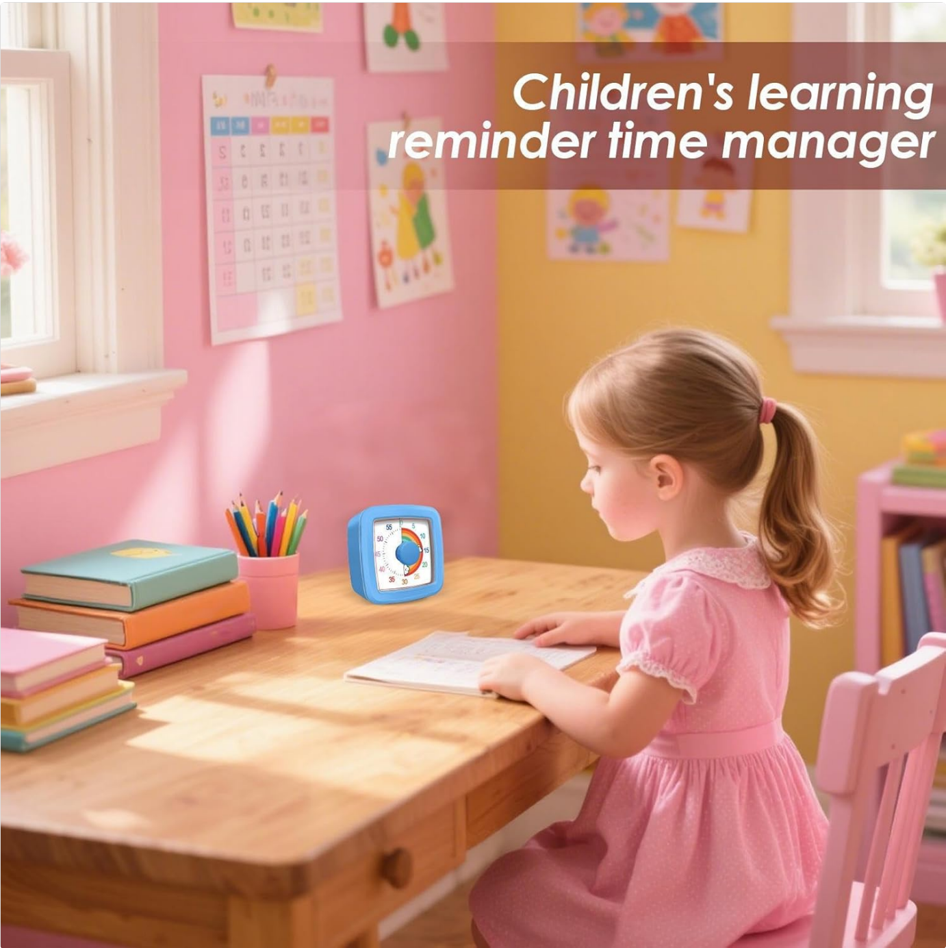
Figure 3: The timer assisting with focus during study time.

Proper care ensures the longevity and optimal performance of your visual timer.