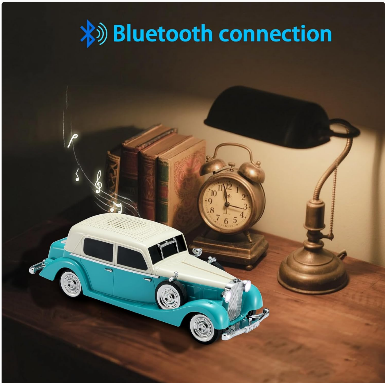
Image: The WS-1934 speaker wirelessly connected to a smartphone via Bluetooth, ready for audio playback.