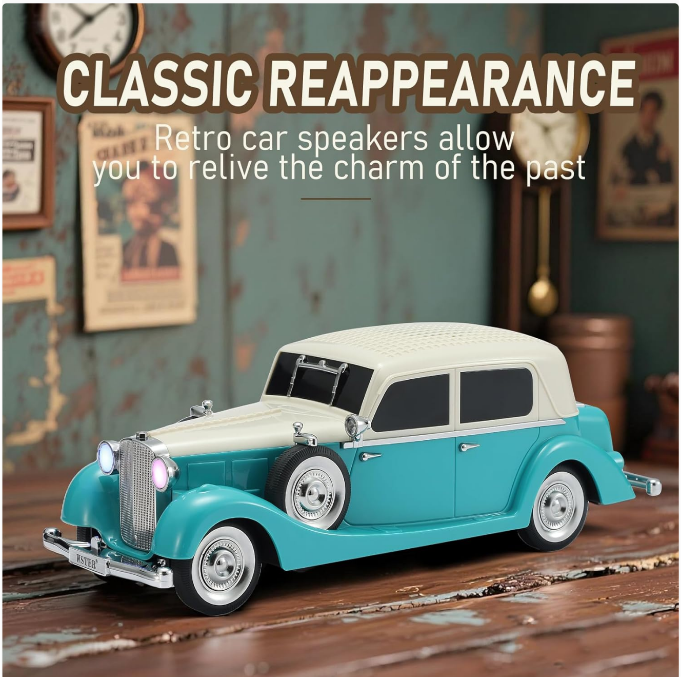
Image: The WSTER WS-1934 speaker with its headlights glowing, showcasing its classic car design.

To power off, repeat the action or long-press the power button.