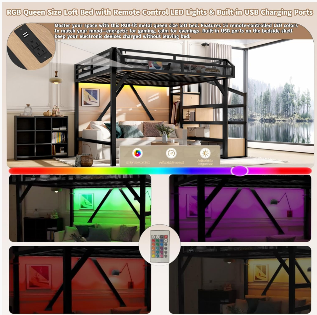
Figure 5.1: The loft bed featuring integrated RGB LED lights, controllable via a remote for customizable ambiance.

The loft bed includes integrated RGB LED lights. Use the provided remote control to adjust color, brightness, and lighting speed. Ensure the LED strip is securely attached to the bed frame.