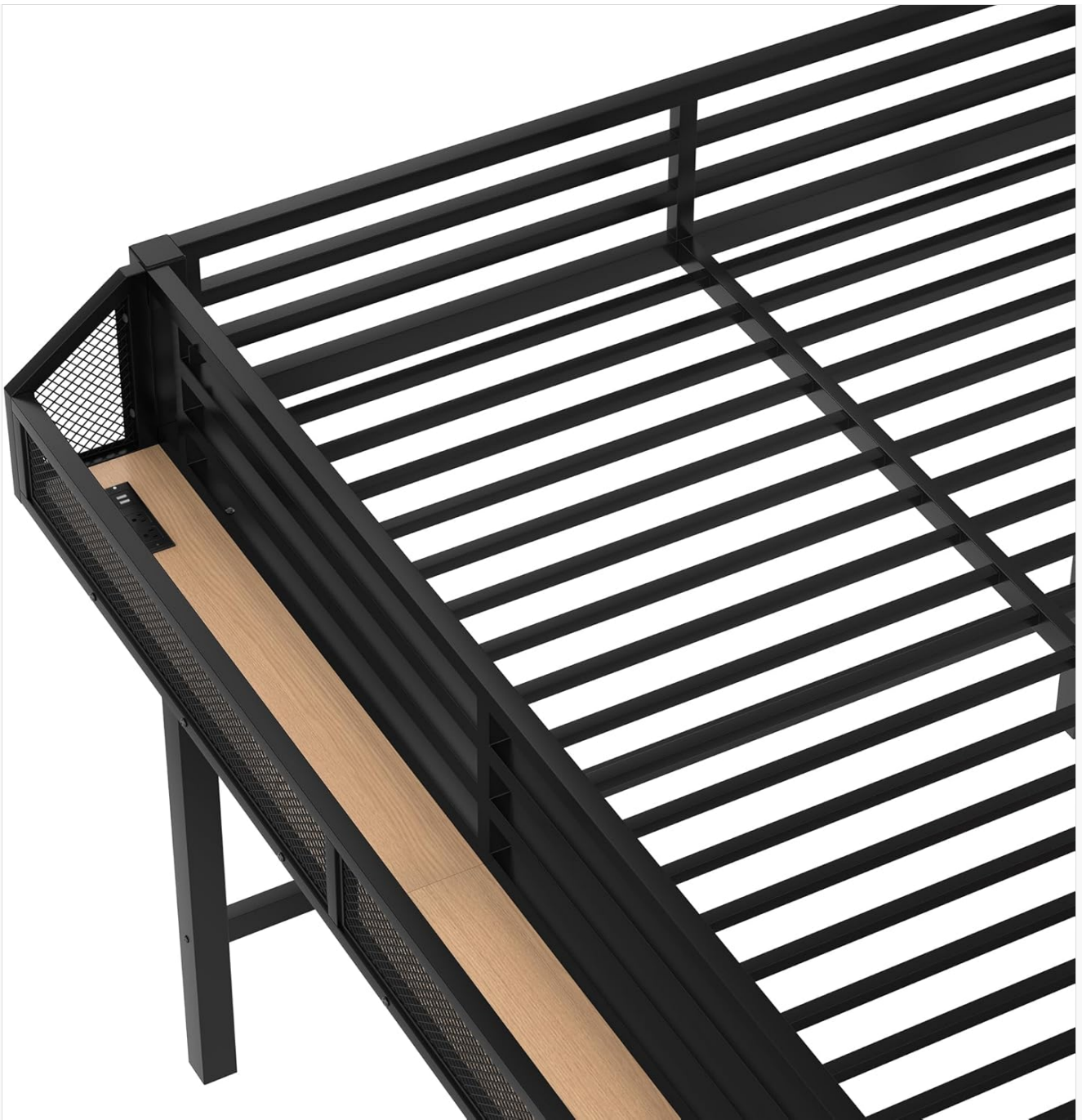
Figure 3.3: View of the bedside shelf with integrated USB ports and power outlets for convenient device charging.

Your browser does not support the video tag.