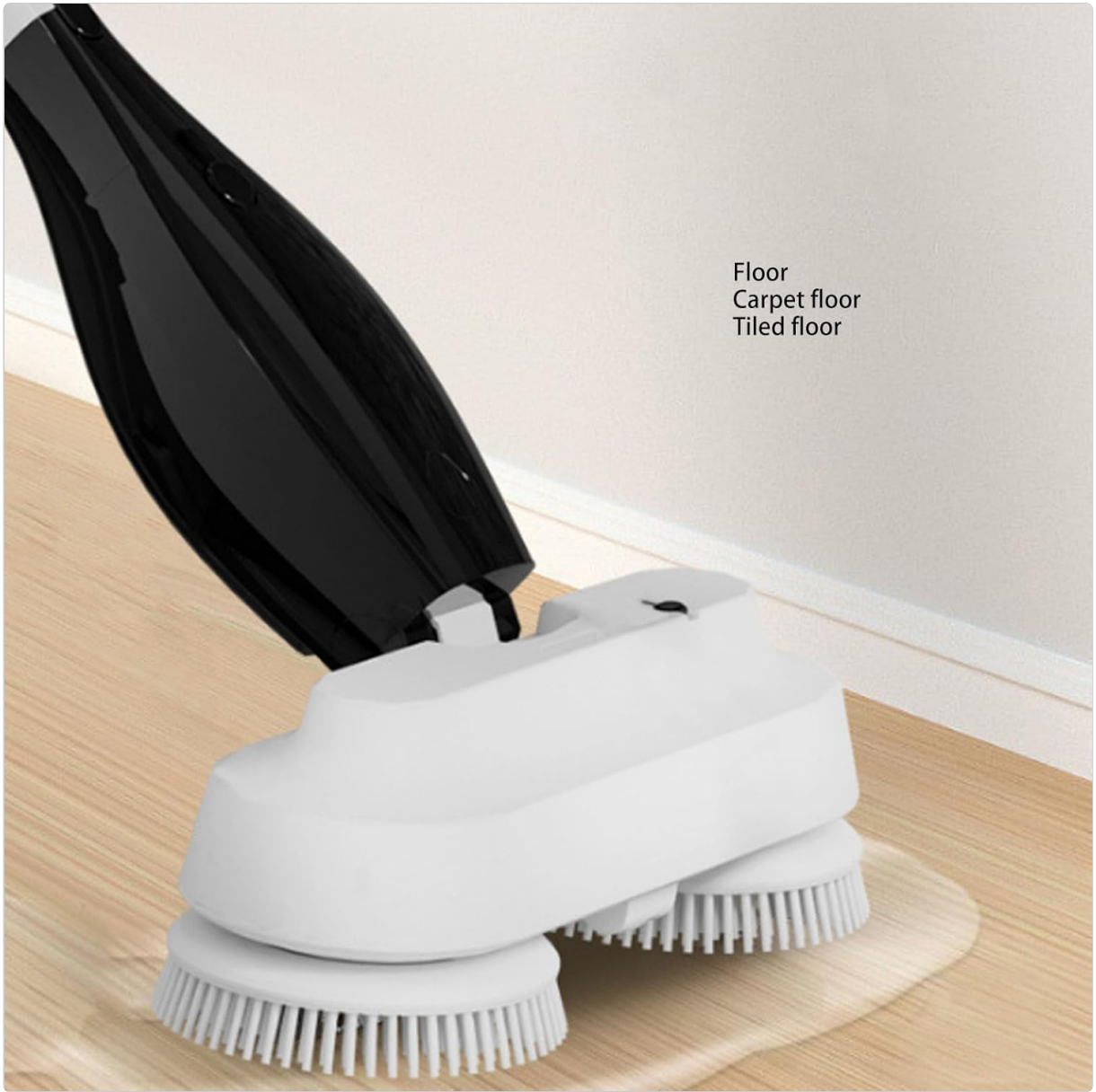
Image: Brush heads in action on a wooden floor.