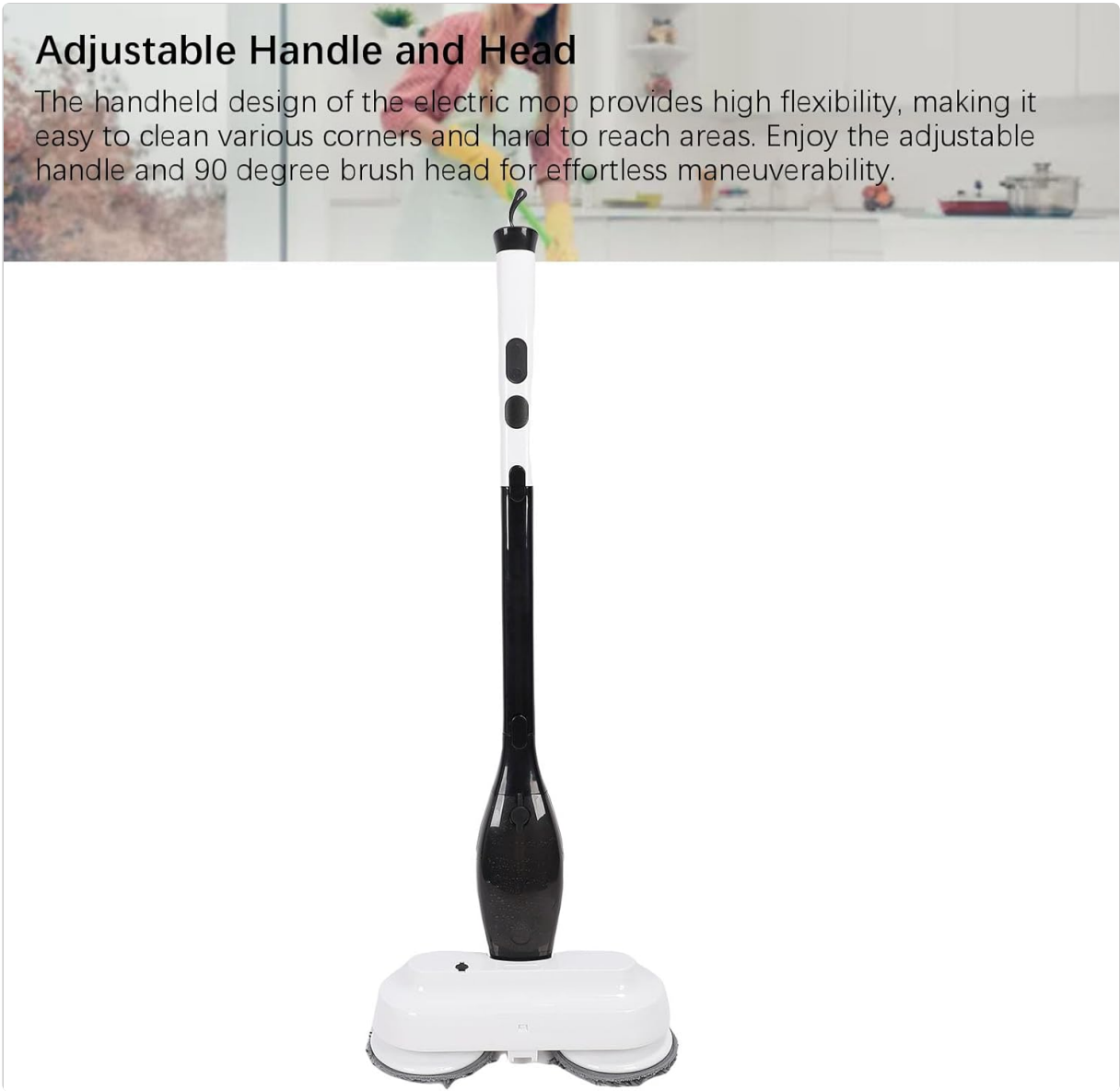
Image: Adjustable handle and head for maneuverability.

The handheld design of the electric mop provides high flexibility, making it easy to clean various corners and hard to reach areas. Enjoy the adjustable handle and 90 degree brush head for effortless maneuverability.