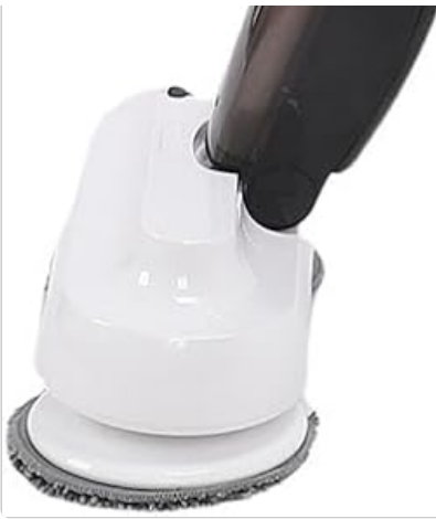
Image: Fully assembled electric mop.