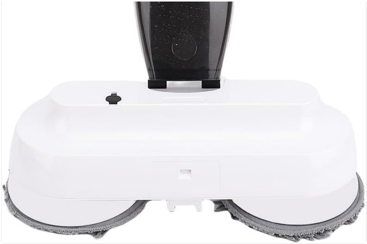
Image: Main product view of the assembled mop.