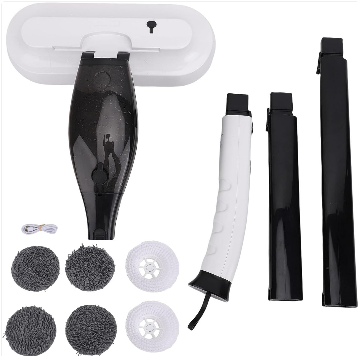
Image: All components included in the package.