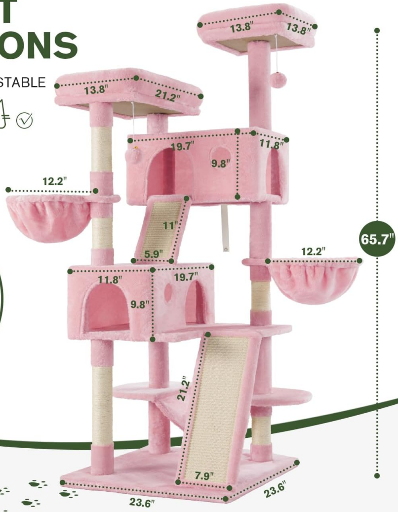
Figure 6: Detailed product dimensions and weight capacities for various components of the cat tree.