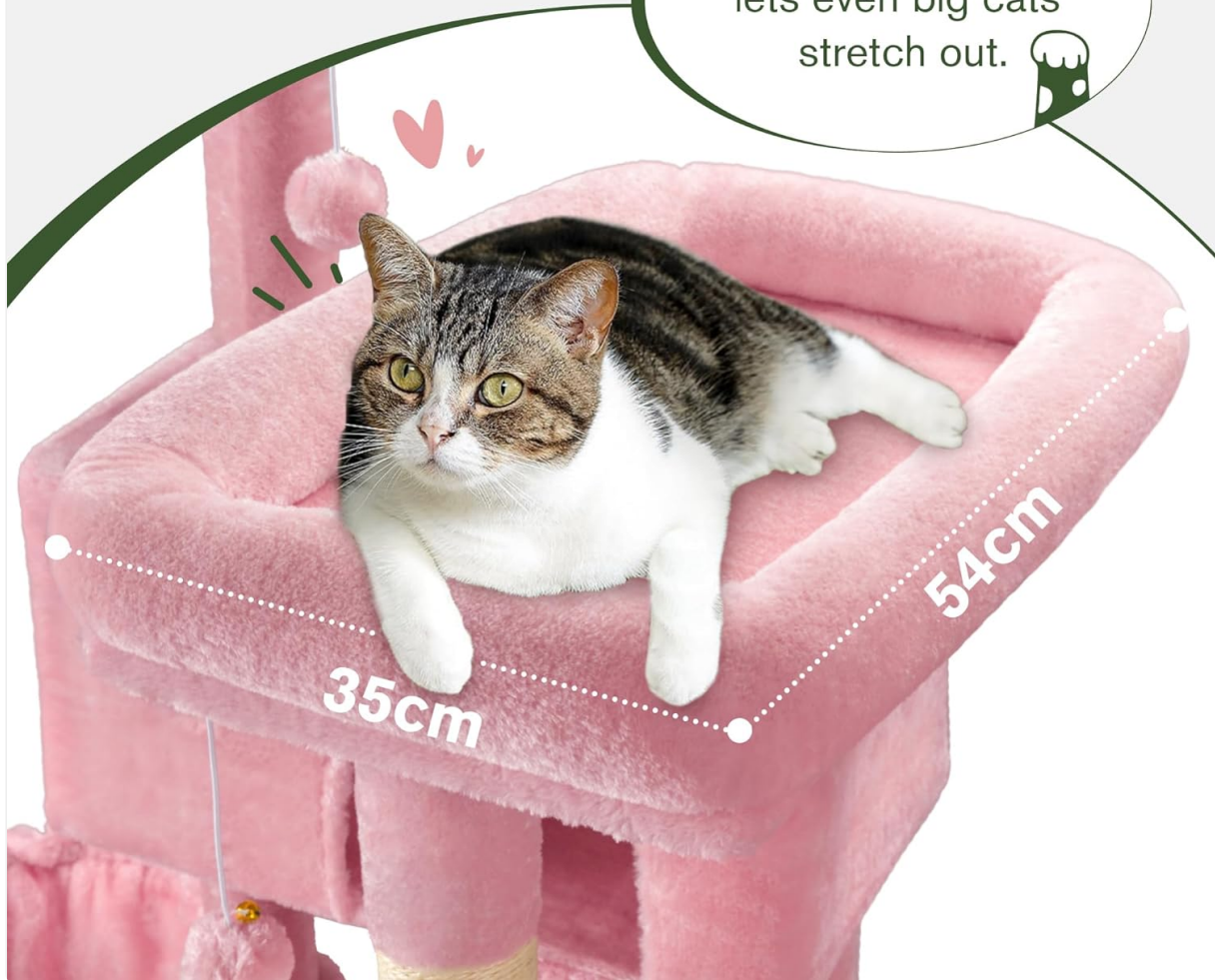
Figure 4: A cat comfortably resting on the spacious top perch, illustrating the ample room for relaxation.

The top perch lets even big cats stretch out.