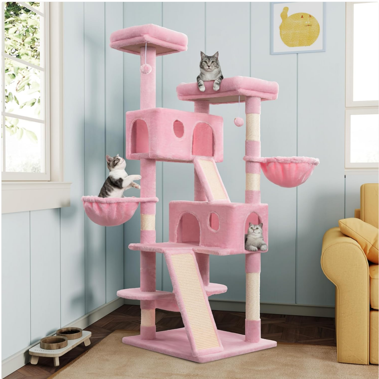
Figure 1: The MUTICOR 66-inch Multi-Level Cat Tree Tower, showcasing its various platforms, condos, and scratching posts.