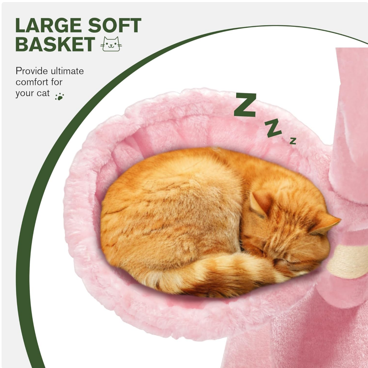
Figure 5: A cat enjoying a nap in one of the large, soft baskets, highlighting the comfort provided.