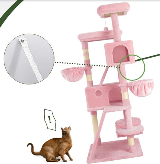
Figure 3: Illustration emphasizing the wide base board and the anti-tipping belt for enhanced stability and safety.

Enjoy the fullest use with dual protection.