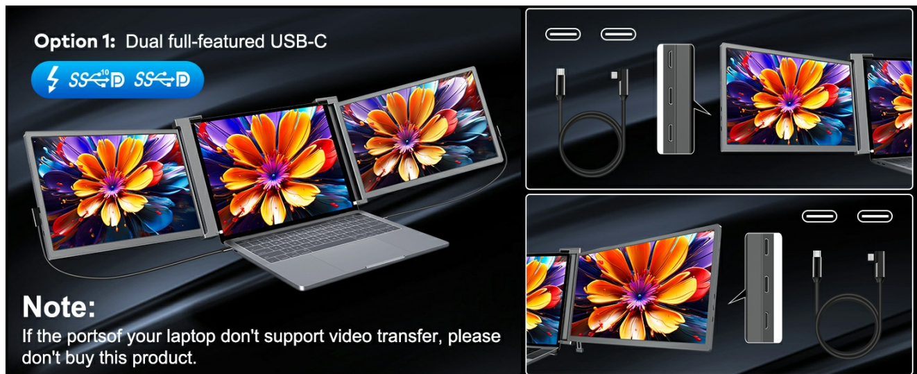
Image: A visual representation of the FOPO triple monitor setup with separate OSD buttons for brightness adjustment on each screen.

Each monitor has separate OSD buttons for brightness adjustment. Use the physical buttons on the monitor to increase or decrease brightness to your preference.