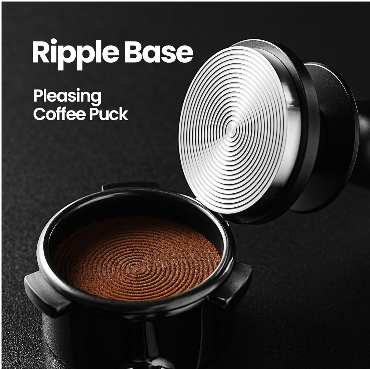
Image: The ripple base creates a distinctive pattern on the coffee puck, designed to optimize water flow and extraction.