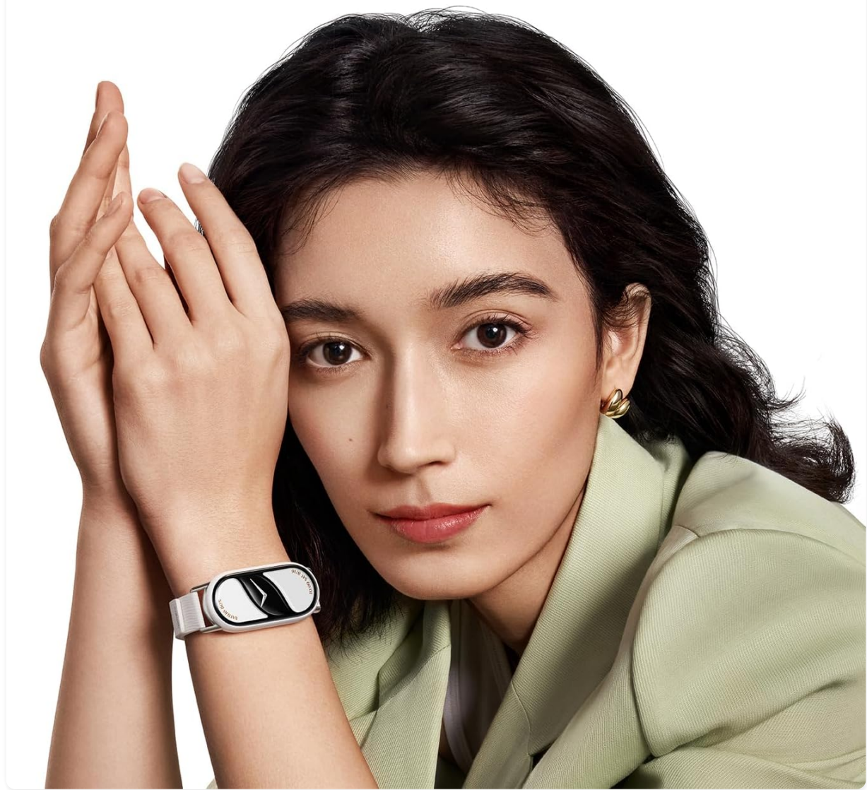
Figure 3: The 1.72-inch AMOLED display offers brilliant clarity and smooth interaction with ultra-thin bezels.