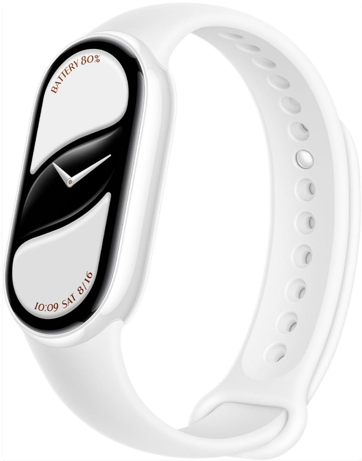
Figure 1: Xiaomi Mi Smart Band 10 Ceramic Edition in Pearl White.