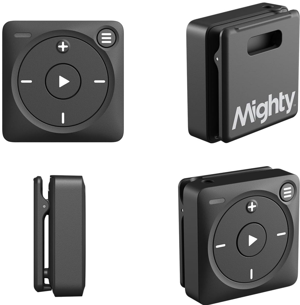
Figure 2: Various views of the Mighty 3 Player, illustrating its small size, clip mechanism, and port locations.