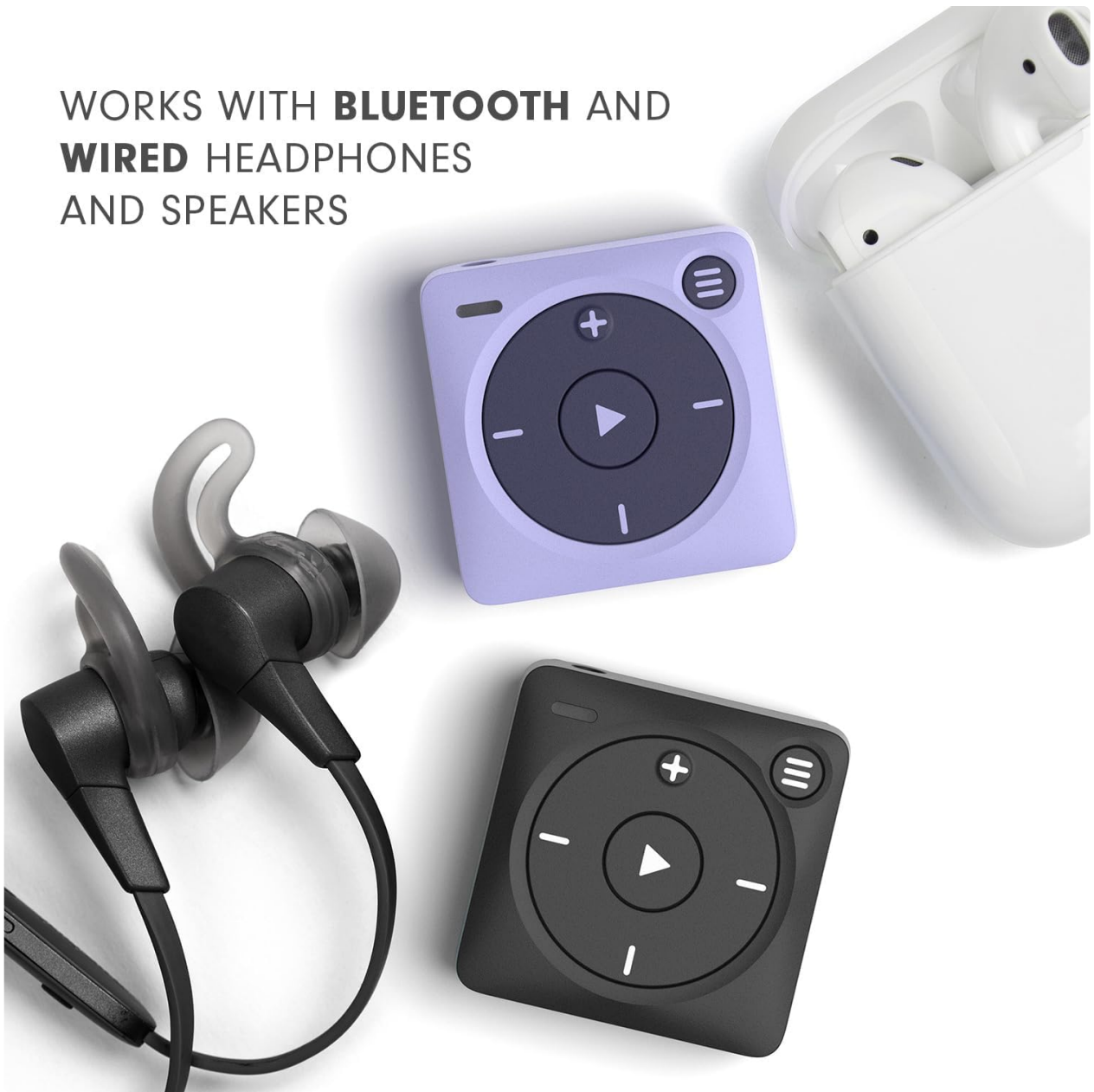
Figure 4: Mighty 3 demonstrating compatibility with both wired and Bluetooth headphones.

WORKS WITH BLUETOOTH AND WIRED HEADPHONES AND SPEAKERS