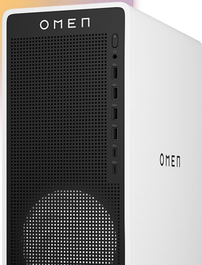
Figure 6: Front and rear port configurations of the OMEN 16L TG03 Desktop.