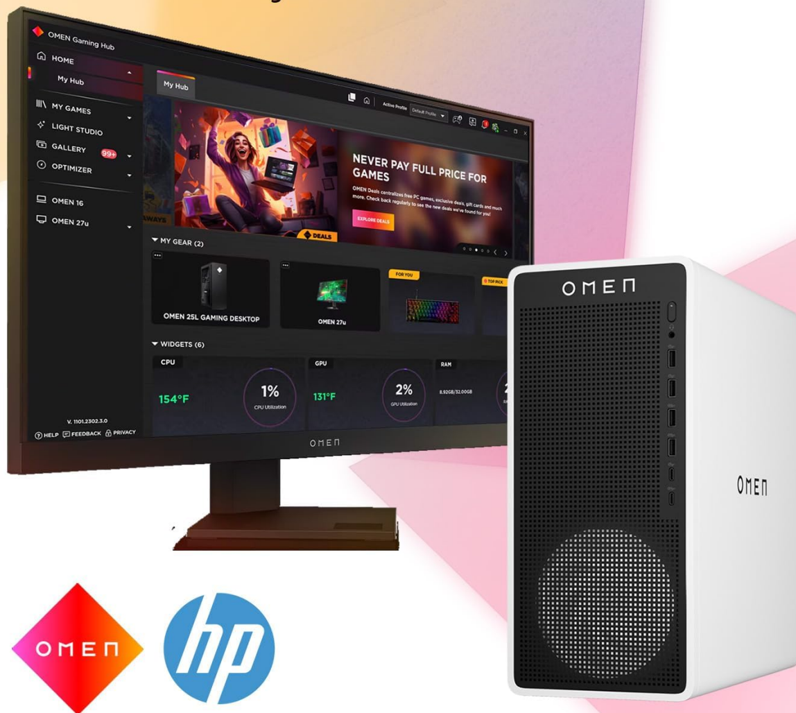
Figure 4: The OMEN Gaming Hub interface for system management and optimization.

Personalize your setup with customizable RGB lighting and personalized setting recommendations for your game in OMEN GAMING HUB.