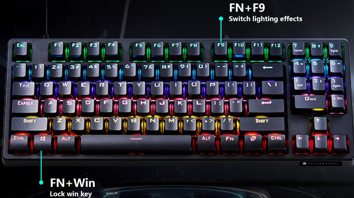
Figure 5: Thunderrobot KG3089R Gaming Keyboard with examples of shortcut key combinations (e.g., FN+F9 for lighting effects, FN+Win to lock the Windows key).