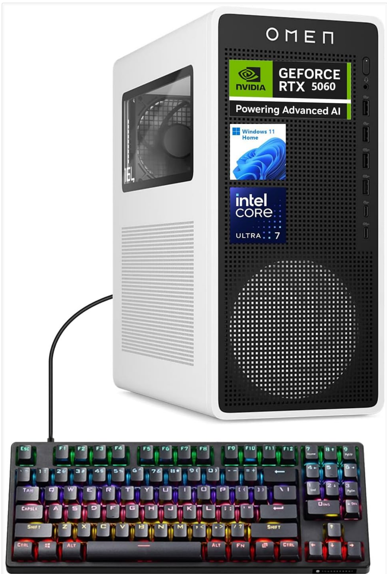
Figure 1: HP OMEN 16L TG03 Gaming Desktop with Thunderrobot Keyboard.