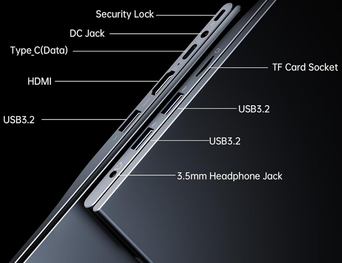
Figure 3.3: Laptop Ports and Interfaces