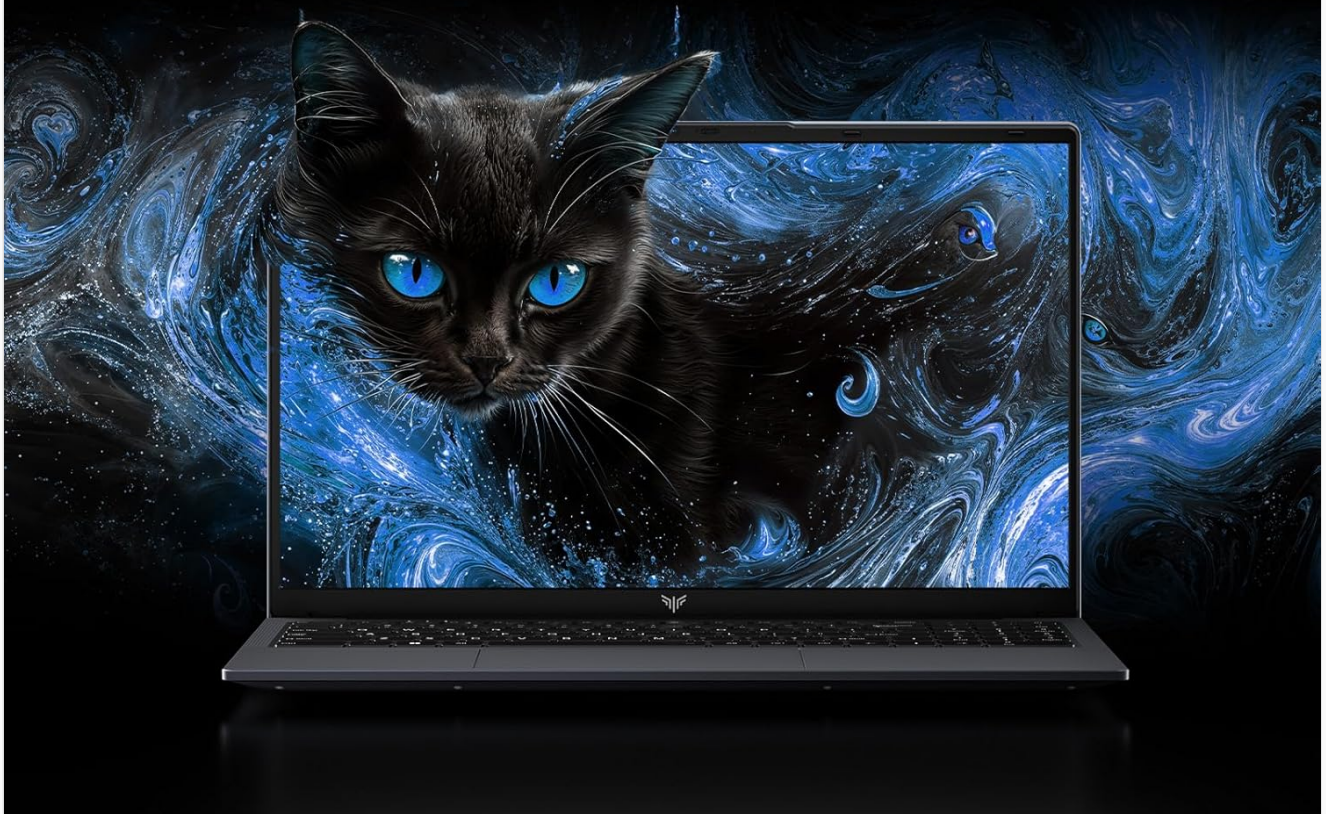
Figure 3.2: Display Features