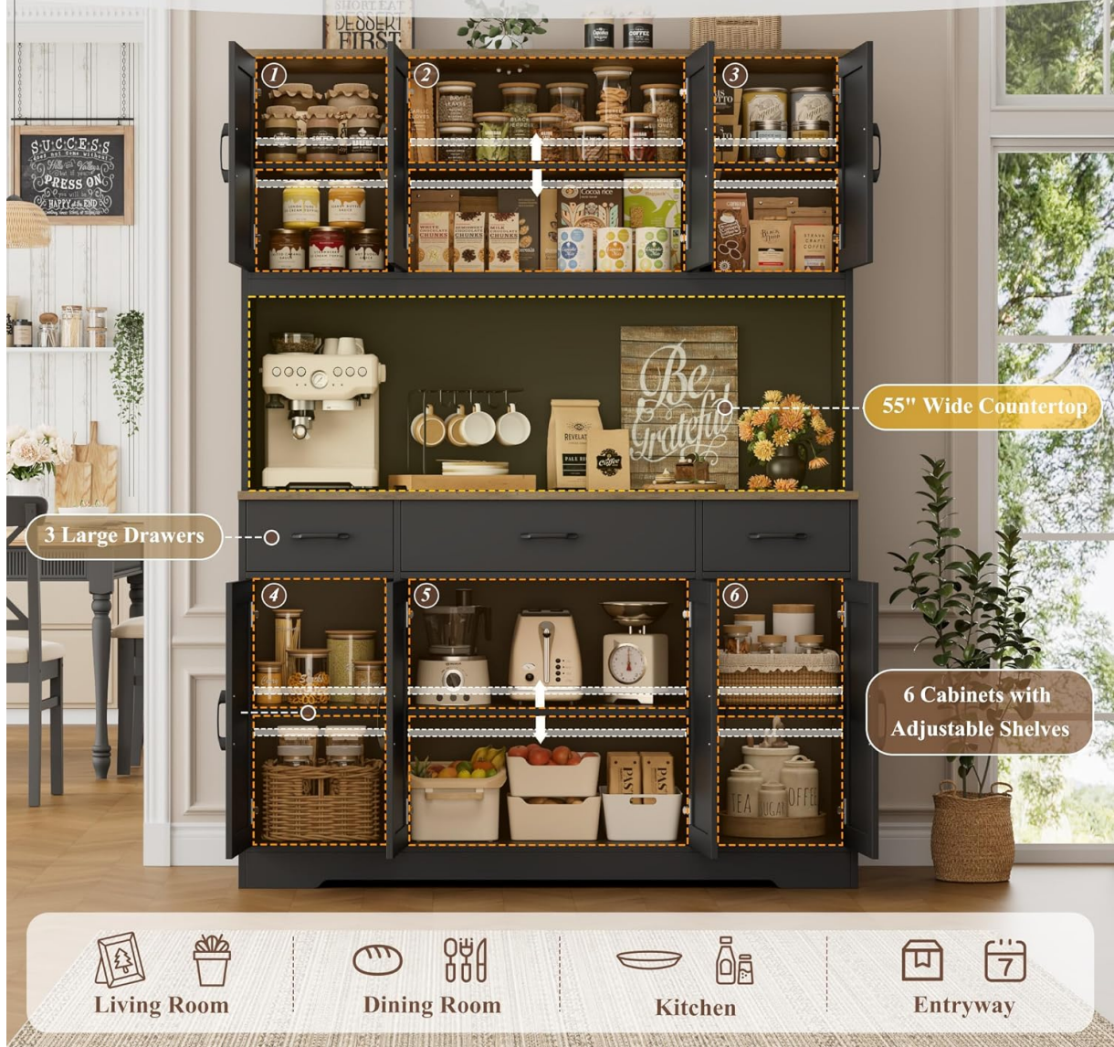
Image 5.2: Overview of the cabinet's storage capacity, highlighting the 55" wide countertop, three drawers, and six cabinets with adjustable shelves.