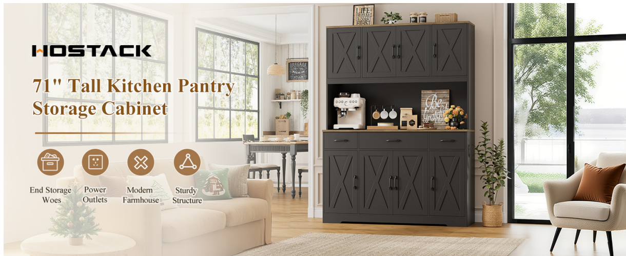
Image 1.1: The HOSTACK 71" Tall Kitchen Pantry Storage Cabinet, showcasing its design and storage capabilities in a home environment.

Thank you for purchasing the HOSTACK 71" Tall Kitchen Pantry Storage Cabinet with Charging Station. This manual provides essential information for the safe assembly, operation, maintenance, and troubleshooting of your new furniture. Please read these instructions carefully before beginning assembly and retain them for future reference.