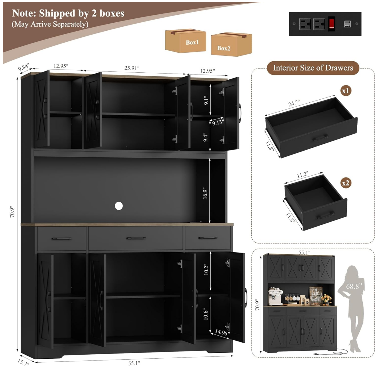
Image 4.1: Detailed dimensions and internal layout of the HOSTACK Kitchen Pantry Storage Cabinet, showing cabinet and drawer sizes.