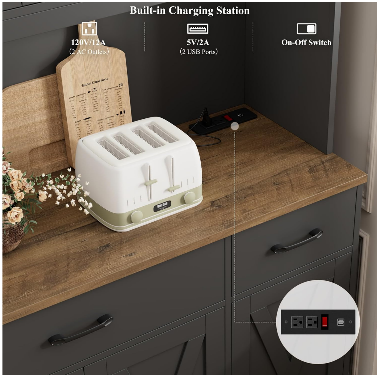
Image 5.1: Detail of the integrated charging station, showing the AC outlets, USB ports, and power switch.

To use, plug the cabinet's power cord into a wall outlet. Use the red on-off switch to control power to the outlets and USB ports. Always turn the switch off when the charging station is not in use or when connecting/disconnecting devices.