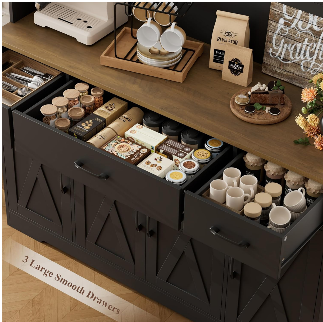
Image 5.3: Detail of the three large drawers, demonstrating their depth and storage potential for kitchen utensils or other small items.