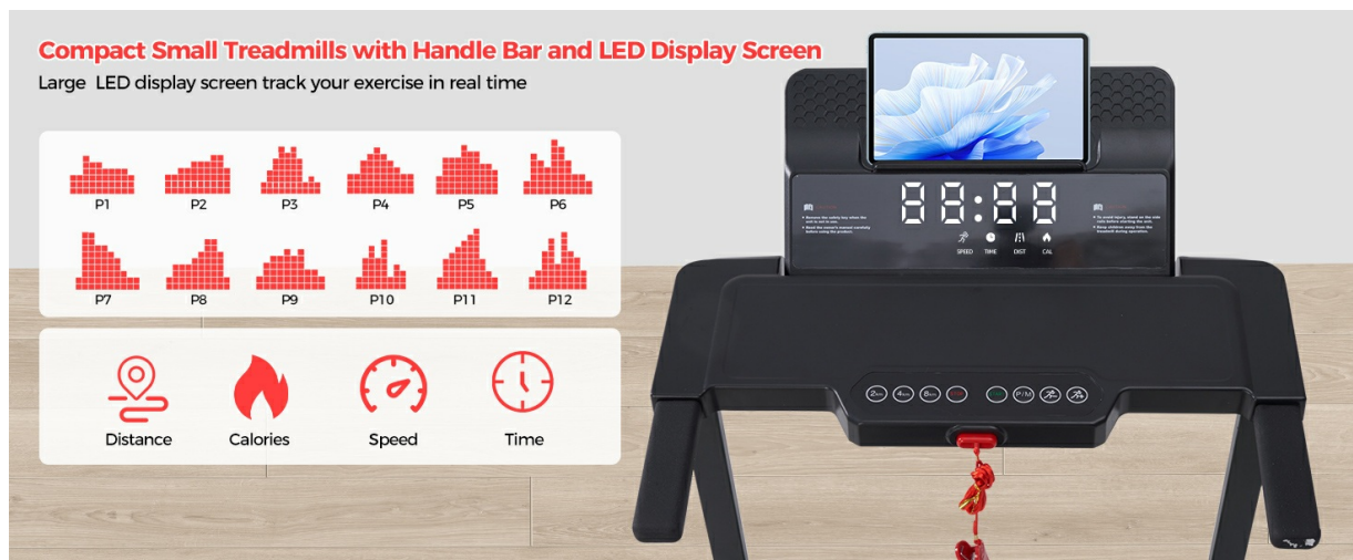
Image: The treadmill console displaying the 12 preset workout programs.