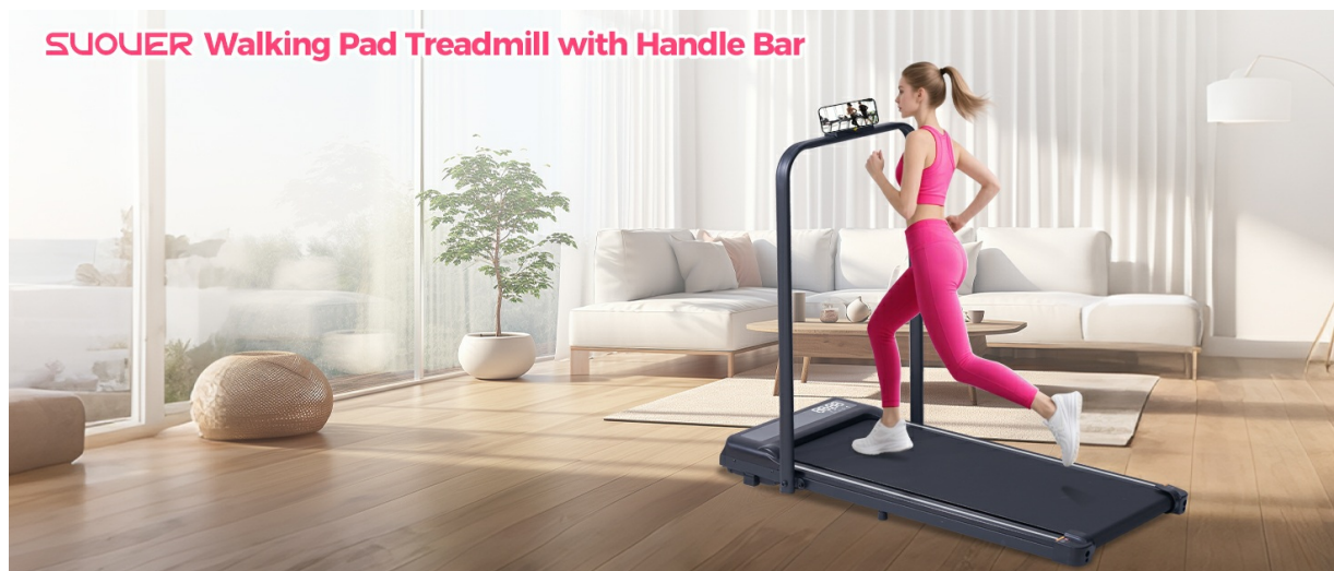
Image: The SUOUER Walking Pad Treadmill with Handle Bar, showcasing its design and functionality.

Thank you for choosing the SUOUER 380TM Pro Max Walking Pad Treadmill. This manual provides essential information for the safe and efficient operation, assembly, and maintenance of your new fitness equipment. Please read this manual thoroughly before initial use and retain it for future reference.