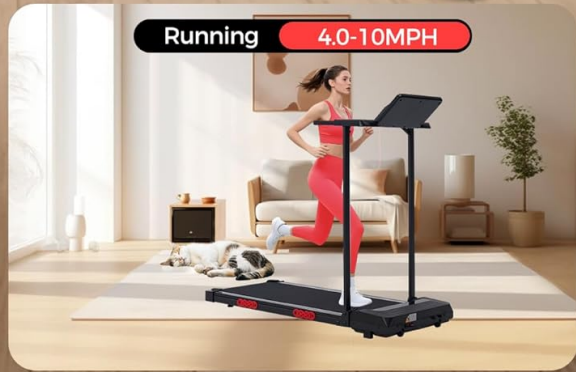
Image: Illustration of the treadmill's versatile usage modes, including working, jogging, and running.