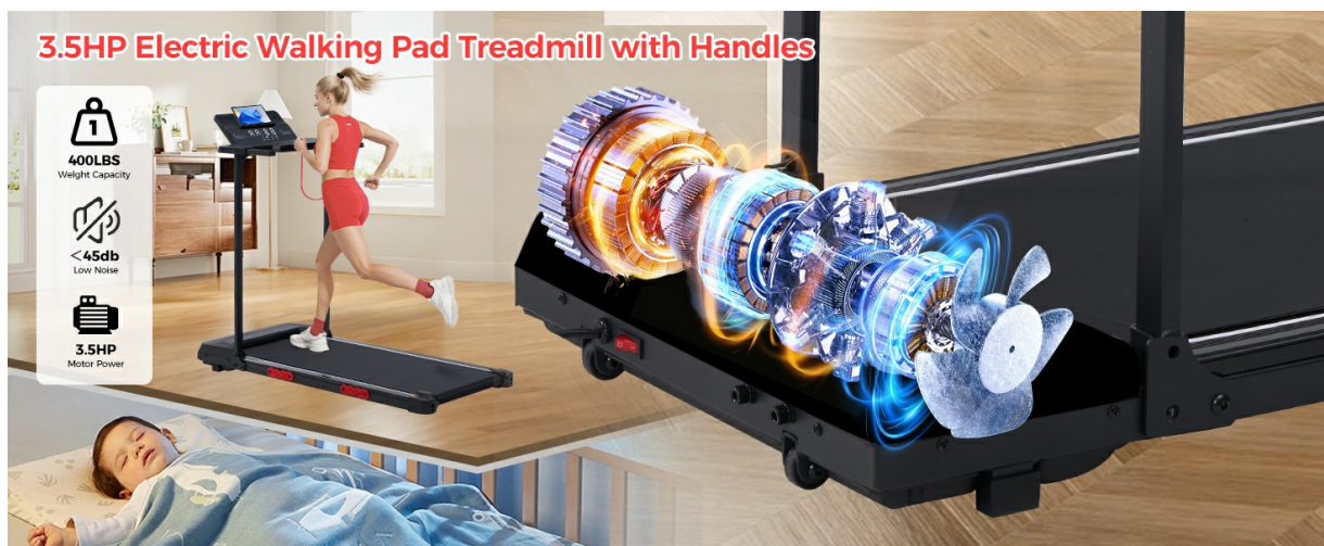
Image: Diagram illustrating the powerful 3.5HP motor of the electric walking pad treadmill.