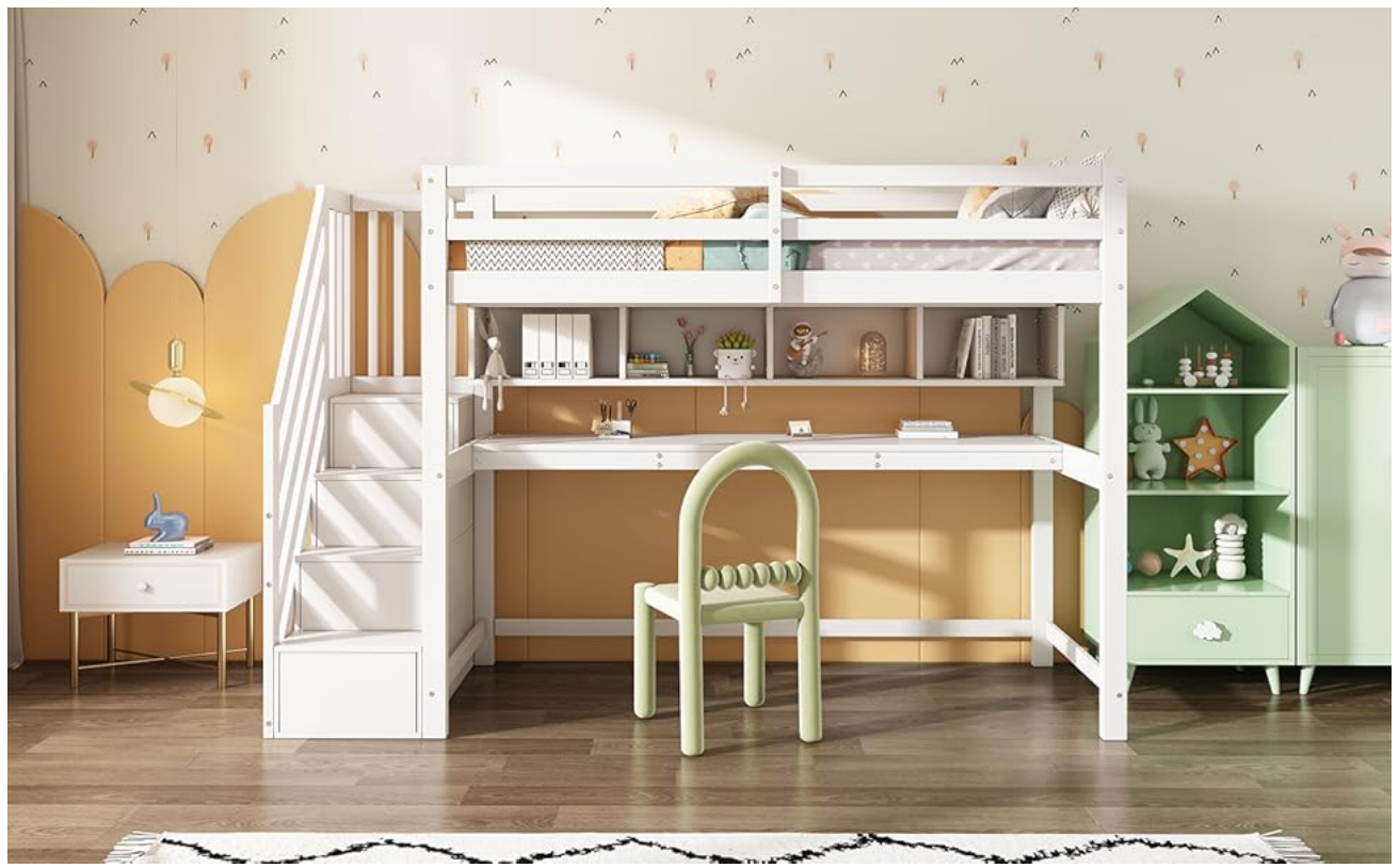
Figure 5: Illustration of the extensive storage options, including stair drawers, shelves, and wardrobe space.