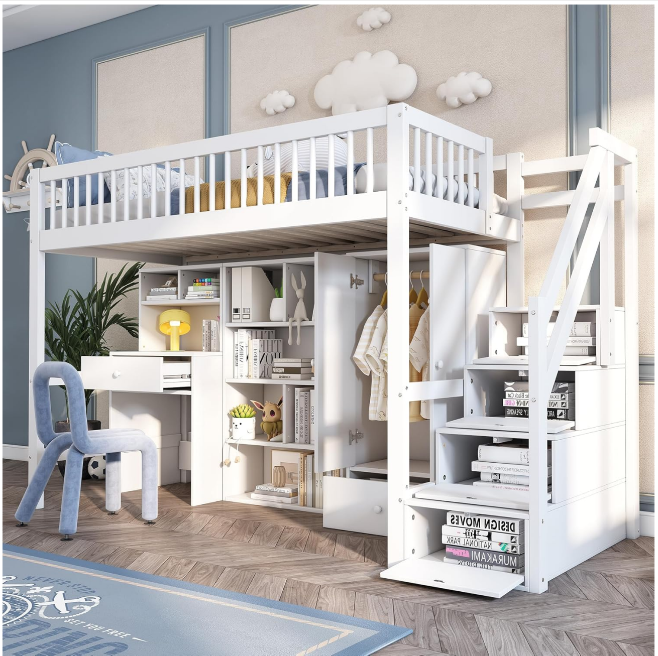
Figure 1: Overview of the Merax Loft Bed, showcasing its integrated features.