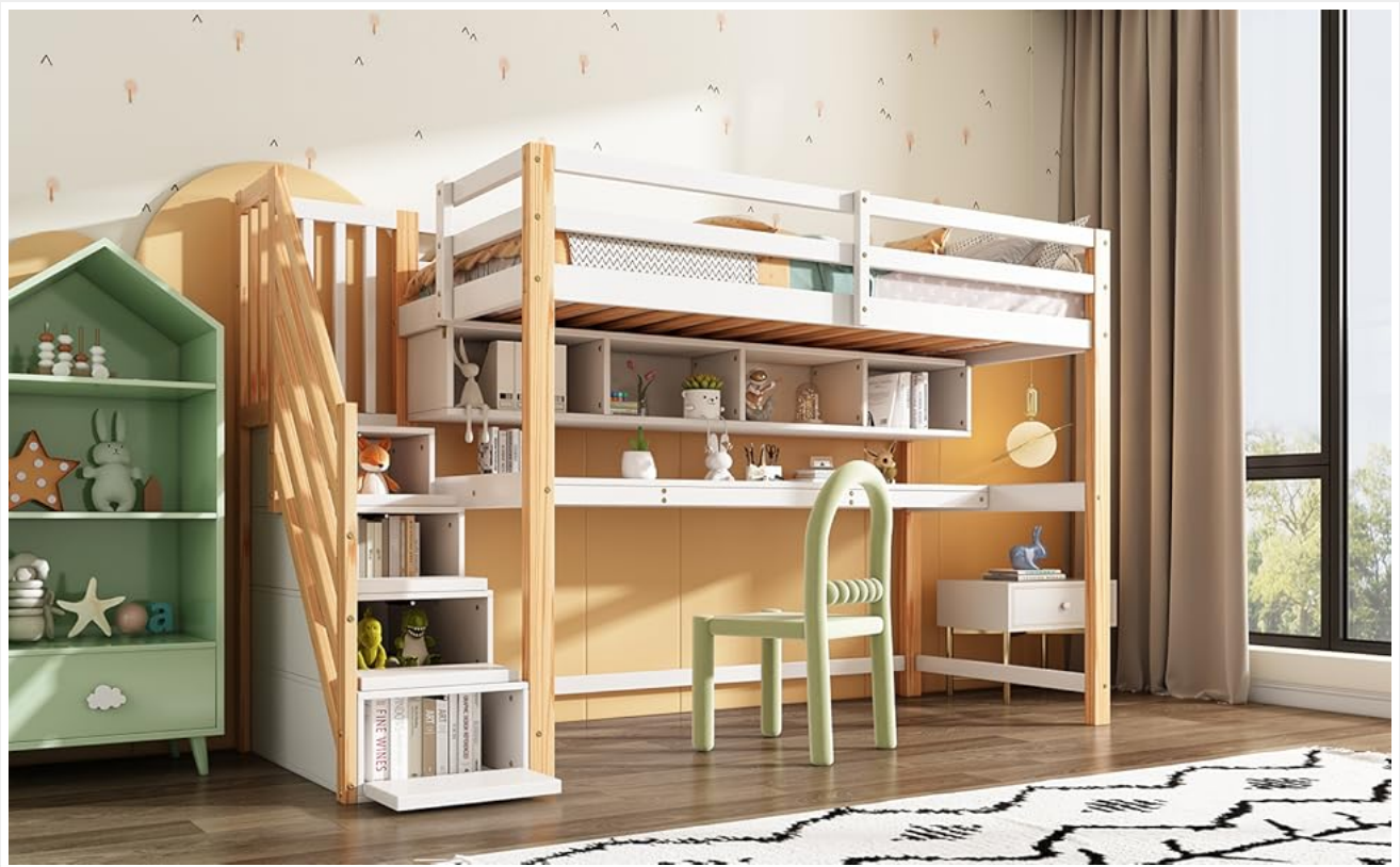
Figure 2: The staircase can be installed on either the left or right side of the bed.